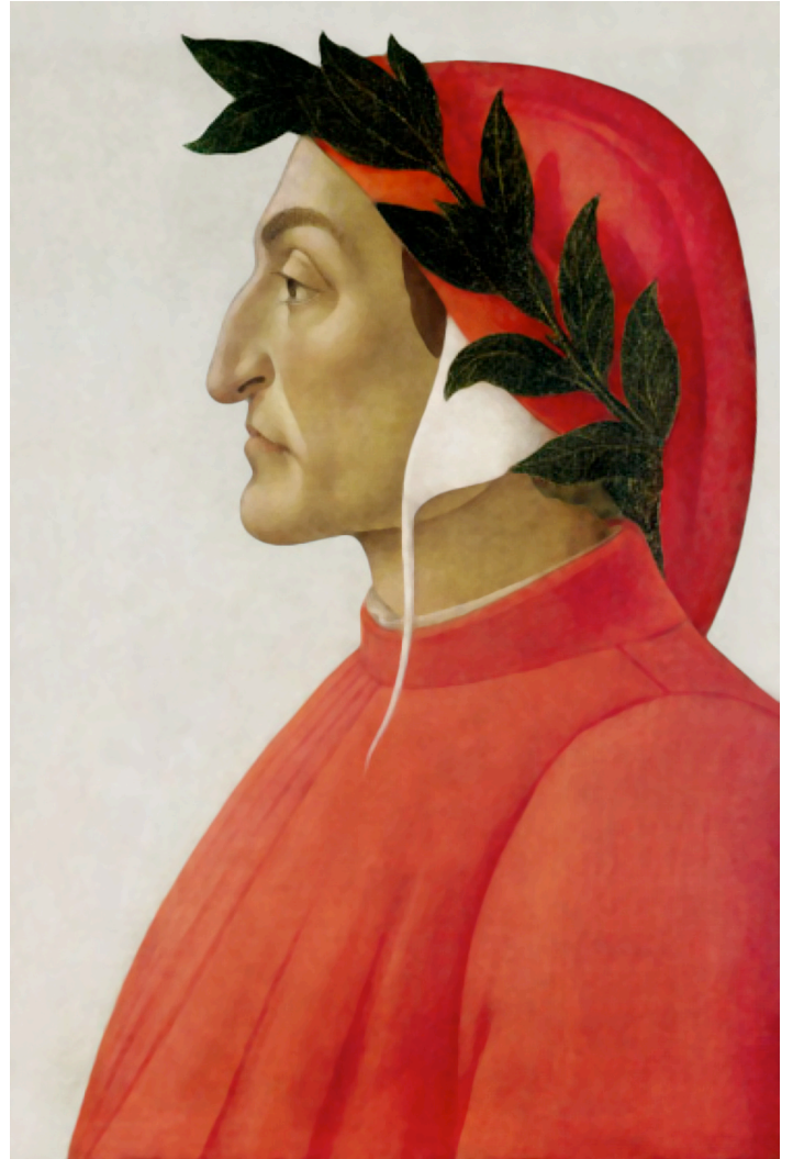
Whitman and Dante. Portrait of Whitman by Thomas Eakins, 1891. Portrait of Dante (“Ritratto di Dante Alighieri”) by Sandro Botticelli, c. 1495.