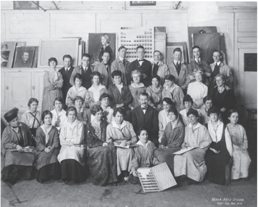
Figure 3. Robert Henri's Art Students League painting class, New York, ca. 1916. Robert Henri is seated in the center of the second row.