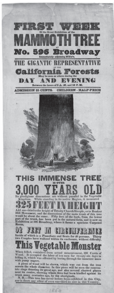
Figure 1. Captain Hanford. Broadside announcing Hanford's Big Tree Exhibit on Broadway, 1854. Image 60618.