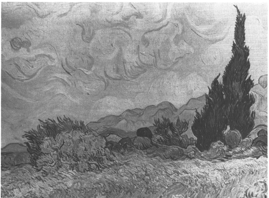
Figure 6: Van Gogh, "Wheatfield with Cypress" (1889). National Gallery, London.

"Line in nature is not found; Unit and universe are round; In vain produced, all rays return; Evil will bless and ice will burn." As Uriel spoke with piercing eye, A shutter ran around the sky. . . . The balance beam of fate was bent; The bounds of good and ill were rent. (Emerson, "Uriel," ll. 21–32)