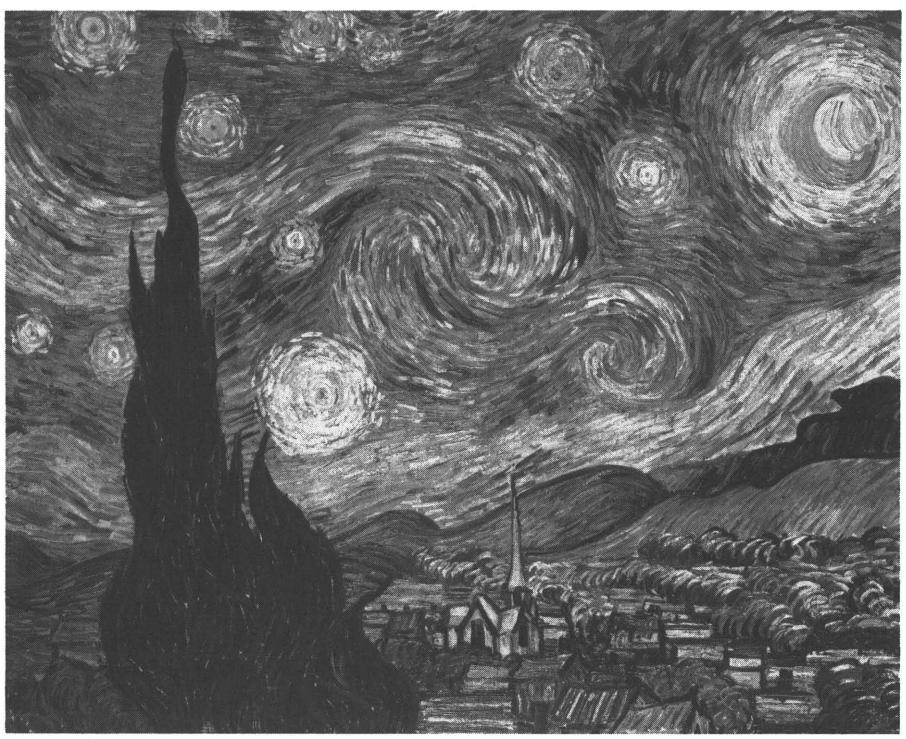
Figure 1: Vincent Van Gogh, "Starry Night" (1889). Museum of Modern Art, New York, acquired through the Lillie P. Bliss Bequest.

The western voyage traced in Van Gogh's paired landscapes emphasizes the importance of "Starry Night's" inherent right-left or (using the conventions evoked by Van Gogh's painted or "mapped" sea) east-west antitheses and confirms what is implicit in the tree's humanly upright form: the cypress is the protagonist of "Starry Night." As Meyer Shapiro has noted, Van Gogh's tree is an eloquent "symbol of human striving." Yet this central symbol of "Starry Night" is far more precisely defined than Shapiro suggests: the human strife represented in the painting is very specifically identified by Van Gogh's pictorial details and title. Standing in solitary opposition to the town on the right or "eastern" part of the canvas and pointing to the heavenly spheres, the cypress represents the prophetic vision of cyclical planetary form and the momentous westward journey of the poems that Van Gogh recommends to his sister and obliquely cites in his title: Whitman's Columbus poems.