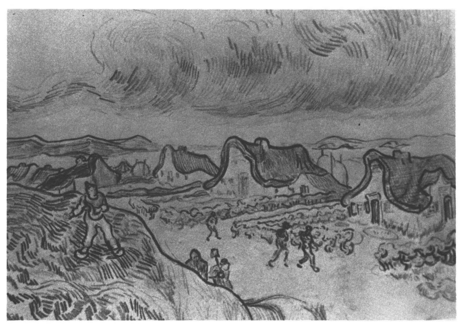
Figure 3: Van Gogh, "View of Field with a Sower Near a Road with Houses" (1889–90). Stedelijk Museum, Amsterdam.

ship of the soul, voyaging, voyaging, voyaging" ("Aboard at a Ship's Helm"). In "A Broadway Pageant" and "Passage to India," Whitman presents his American Adam as an heir to the Genoese prophet who proved the "rondure of the world" (p. 414). Carrying Columbus's repudiation of Thulean "limits and imaginary lines" to its logical conclusion, Whitman's Adam points beyond Cathay to a "passage to more than India":