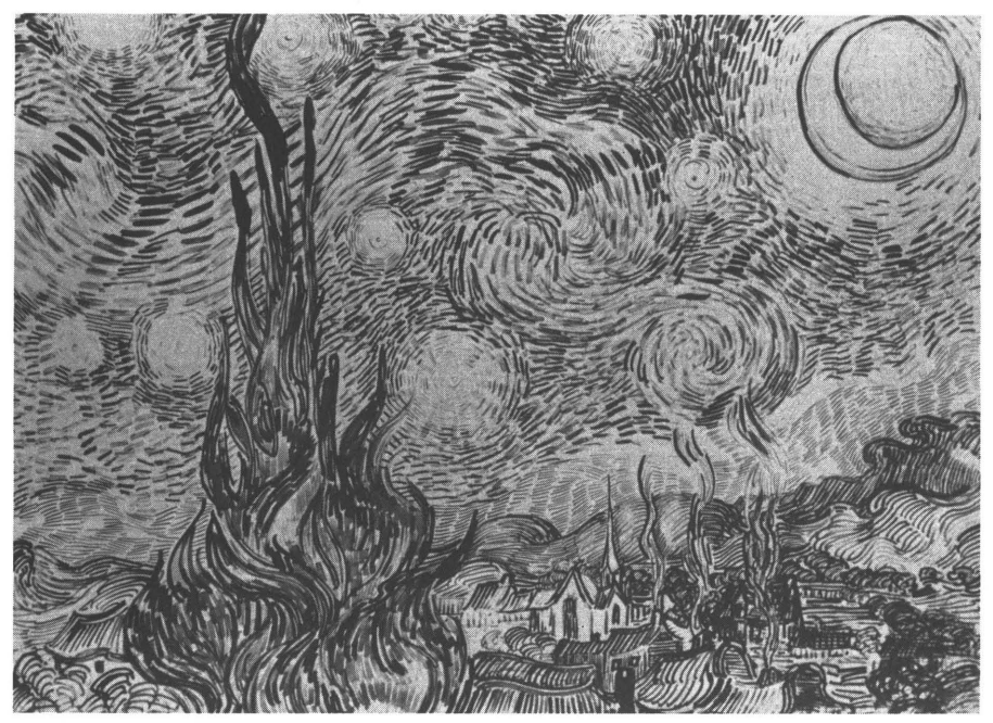
Figure 4: Van Gogh, Ink Study for "Starry Night" (1889). This sketch, formerly in the Kunsthalle Museum in Bremen, Germany, was destroyed in World War II.<sup>20</sup>

Embracing Columbus's discovery of earthly "rondure" as a principle of human life, Whitman insists that "to be in any form" is to be round (Song of Myself, p. 57). While Whitman inexplicably gives "mathematical expression" to his central vision of cyclically recurring and evolving life by "Chanting the Square Deific," the geometric form that pervades his poetry is the circular design invoked at the beginning of From Noon to Starry Night "Thou Orb Aloft Full-Dazzling." Whitman's "square deific" is significantly deconstructed by its own fourth side, which is identified as the "general soul" of life and the spirit or "breath" of poetry. Described as the quintessential form underlying the "life of the great round world, the sun and stars, and of man," Whitman's Santa Spirita reconciles the linear oppositions of the other three sides of his "square deific" - God, Saviour, and Satan – by literally finishing or destroying the form that it completes. Whitman's four-part godhead or "square entirely divine" ends in a "great round," and this collapse of the poem's explicit Euclidean metaphor demonstrates the superior power of the "mathematical expression" implicit elsewhere in Whitman. Whitman's celebrations of his cosmic, orbiting self are preeminently chants of cycles, and not squares.