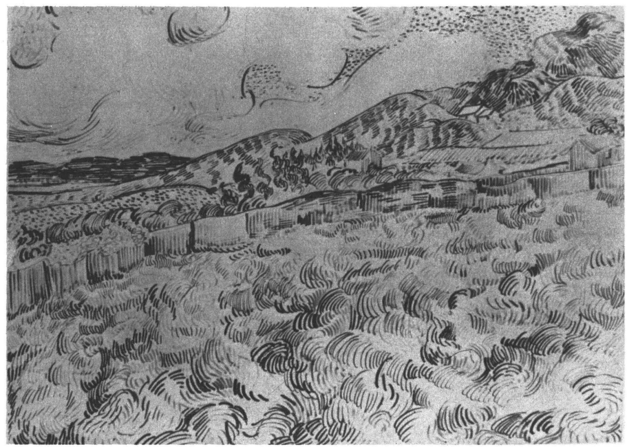
Figure 5: Van Gogh, "Cornfield with Hills" (1889). Stedelijk Museum, Amsterdam.

In the poem Van Gogh quotes in the title of "Starry Night," Whitman recognizes the "dazzling orb" as a "twin" or token of himself. Speaking to the sun on terms of friendly equanimity, he asks it to guide the twilight of his life as it has guided his "hot . . . noon":