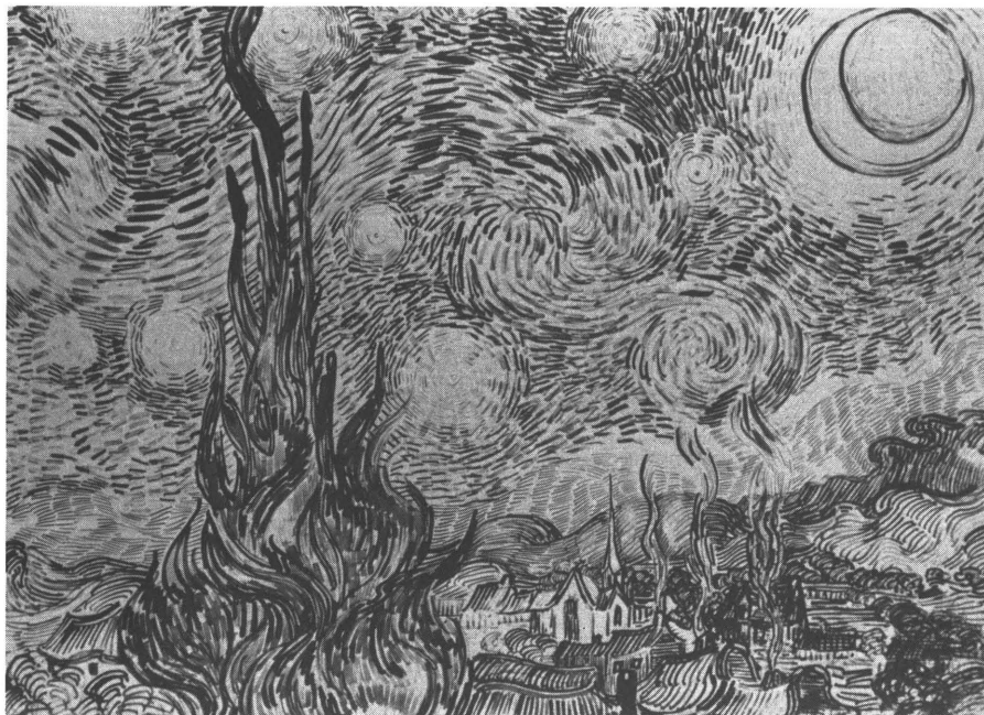
Figure 4: Van Gogh, Ink Study for “Starry Night” (1889). This sketch, formerly in the Kunsthalle Museum in Bremen, Germany, was destroyed in World War II. 20

Embracing Columbus’s discovery of earthly “rondure” as a principle of human life, Whitman insists that “to be in any form” is to be round ( Song of Myself , p. 57). While Whitman inexplicably gives “mathematical expression” to his central vision of cyclically recurring and evolving life by “Chanting the Square Deific,” the geometric form that pervades his poetry is the circular design invoked at the beginning of From Noon to Starry Night in “Thou Orb Aloft Full-Dazzling.” Whitman’s “square deific” is significantly deconstructed by its own fourth side, which is identified as the “general soul” of life and the spirit or “breath” of poetry. Described as the quintessential form underlying the “life of the great round world, the sun and stars, and of man,” Whitman’s Santa Spirita reconciles the linear oppositions of the other three sides of his “square deific” – God, Saviour, and Satan – by literally finishing or destroying the form that it completes. Whitman’s four-part godhead or “square entirely divine” ends in a “great round,” and this collapse of the poem’s explicit Euclidean metaphor demonstrates the superior power of the “mathematical expression” implicit elsewhere in Whitman. Whitman’s celebrations of his cosmic, orbiting self are pre-eminently chants of cycles, and not squares.