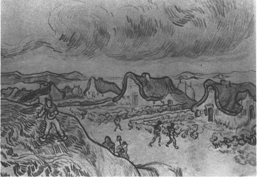
Figure 3: Van Gogh, “View of Field with a Sower Near a Road with Houses” (1889–90). Stedelijk Museum, Amsterdam.

ship of the soul, voyaging, voyaging, voyaging” (“Aboard at a Ship’s Helm”). In “A Broadway Pageant” and “Passage to India,” Whitman presents his American Adam as an heir to the Genoese prophet who proved the “rondure of the world” (p. 414). Carrying Columbus’s repudiation of Thulean “limits and imaginary lines” to its logical conclusion, Whitman’s Adam points beyond Cathay to a “passage to more than India”: