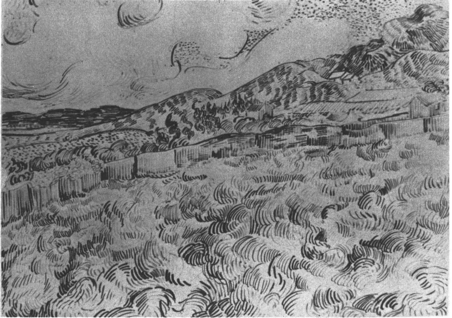
Figure 5: Van Gogh, “Cornfield with Hills” (1889). Stedelijk Museum, Amsterdam.

In the poem Van Gogh quotes in the title of “Starry Night,” Whitman recognizes the “dazzling orb” as a “twin” or token of himself. Speaking to the sun on terms of friendly equanimity, he asks it to guide the twilight of his life as it has guided his “hot . . . noon”: