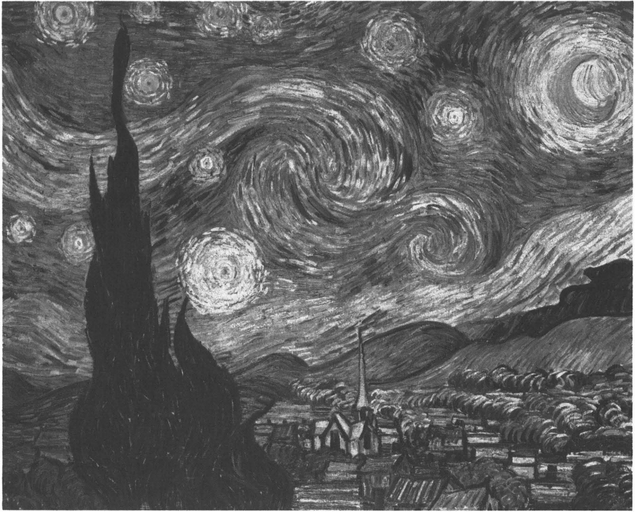
Figure 1: Vincent Van Gogh, "Starry Night" (1889). Museum of Modern Art, New York, acquired through the Lillie P. Bliss Bequest.

The western voyage traced in Van Gogh's paired landscapes emphasizes the importance of "Starry Night's" inherent right-left or (using the conventions evoked by Van Gogh's painted or "mapped" sea) east-west antitheses and confirms what is implicit in the tree's humanly upright form: the cypress is the protagonist of "Starry Night." As Meyer Shapiro has noted, Van Gogh's tree is an eloquent "symbol of human striving." Yet this central symbol of "Starry Night" is far more precisely defined than Shapiro suggests: the human strife represented in the painting is very specifically identified by Van Gogh's pictorial details and title. Standing in solitary opposition to the town on the right or "eastern" part of the canvas and pointing to the heavenly spheres, the cypress represents the prophetic vision of cyclical planetary form and the momentous westward journey of the poems that Van Gogh recommends to his sister and obliquely cites in his title: Whitman's Columbus poems.