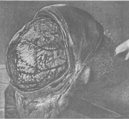
Figure 2. Illustration from Henry W. Cattell's Postmortem Pathology (J. B. Lippincott, 1906), 239.

Cattell also devotes a paragraph or two in each of his books to the delicate issue of permission, not just permission to perform the post mortem, but permission to take away the organs. "You should be sure you have the right to make the post-mortem before you begin," he writes. "The nearest relative, or the one who is going to pay the expenses of the funeral, should give consent in writing." 42 In Whitman's case, Cattell heeded none of these warnings. According to the Press : 43