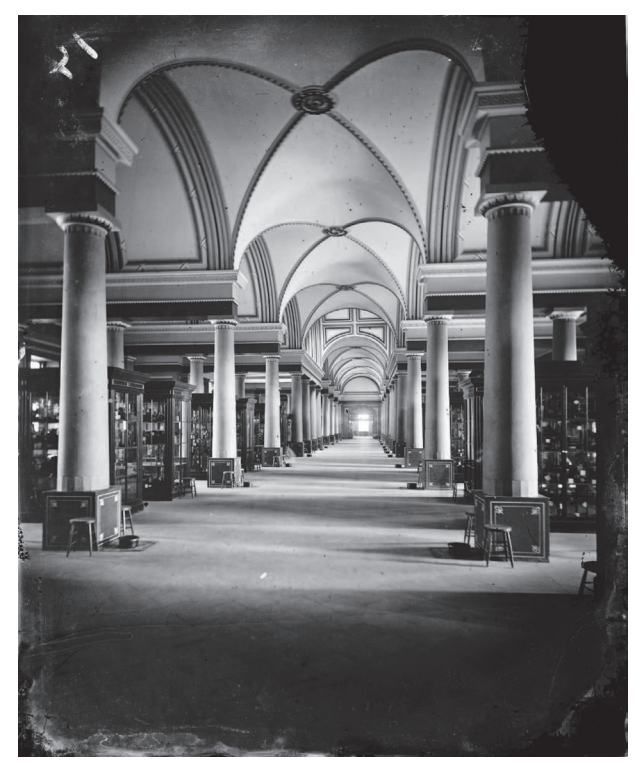
Figure 1. "Old Patent Office Model Room." Washington D.C., 1865.

names are lost," when their bodies remain unburied? (MDW 16). This is a central question of Memoranda, Specimen Days, and Drum-Taps, which the figure of the specimen attempts to reconcile. As a representative body capable of merging with others, who died similar deaths in similar places, the specimen allows the act of mourning to be unbroken by the limits of selfhood and otherness, known and unknown.