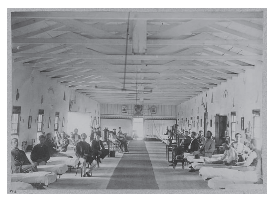
Figure 2. "Ward K, Armory Square Hospital, August 1865."

These resurrected patients invade the present with phantasmal sensations. The ladies' perfumes are obscured by the "odor of wounds and blood"; the "violins' sweetness" is drowned out by the "groan[s]" of the dying. The inauguration is superseded by the illumined bodies reflected in the glass cabinets, their suffering rendering them somehow transcendent.