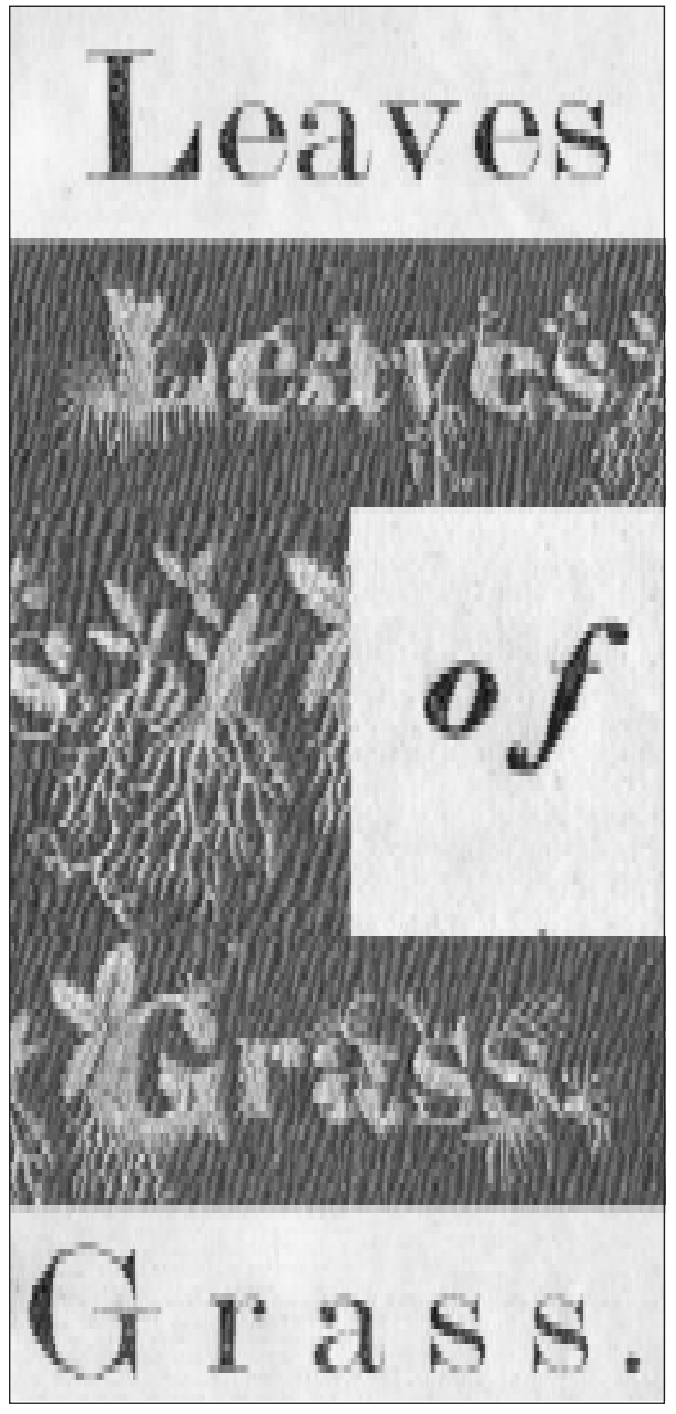
Comparison of fonts for title page and cover of the 1855 Leaves of Grass . See pp. 85-97.