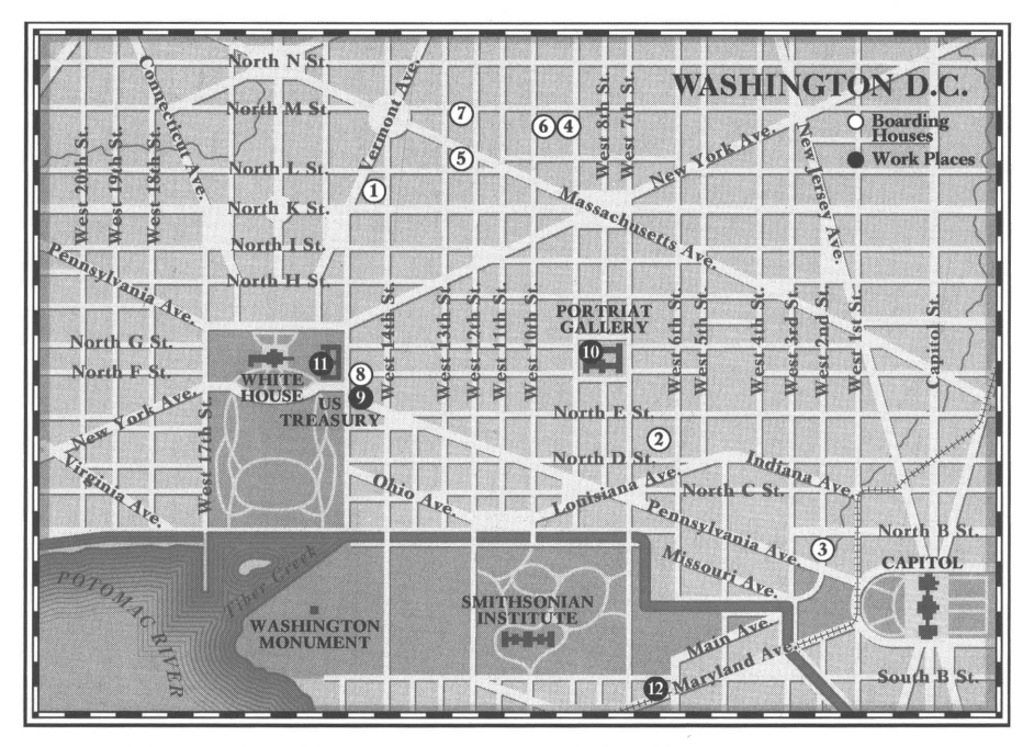
A map of Whitman's residences and workplaces in Washington, D.C. See pp. 23-28.