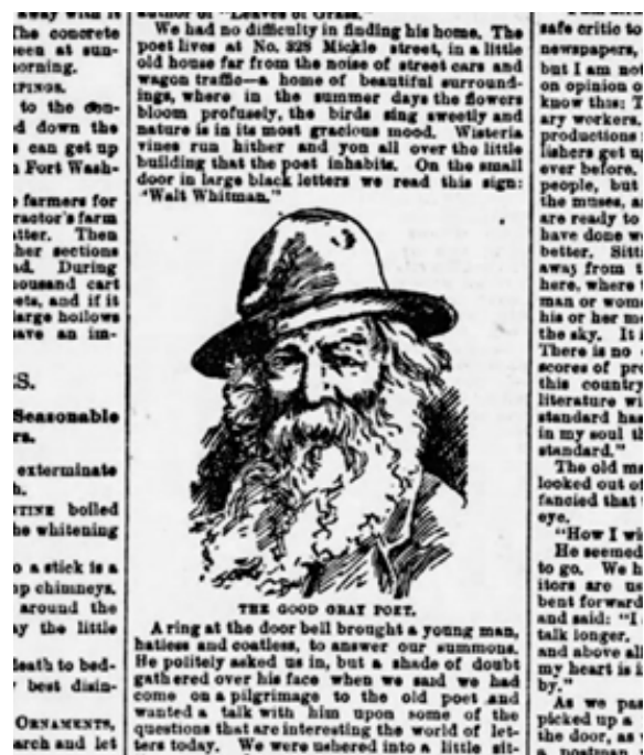
Figure 2: Detail of “The Good Gray Poet,” in Evening Star .

its second-hand sourcing, the article describes Whitman’s environment in intimate detail, contrasting the “tranquil” city of Camden with the “noisy industrial centers” to which the author is averse. 7 As Rivas relays his friends’ impressions, he juxtaposes Whitman’s paralysis with his “haughty” ( soberbia ) lion’s mane and “manly” ( varonil ) face. 8 Following a series of increasingly reverent descriptions of Whitman’s countenance, the narrative ends in high praise of a “poet-seer” destined to prophesize in song a glorious future for a continental “our America” ( nuestra América ). 9 The profile frames an unattributed pen-and-ink portrait of the subject’s face. The gaze, the position of the collar, and the weight of the furrow of his brow recall a photograph by Jacob Spieler probably taken in 1876. 10