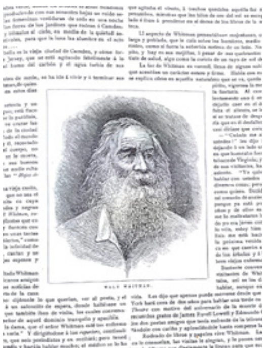
Figure 1: Detail of “El poeta Walt Whitman.”