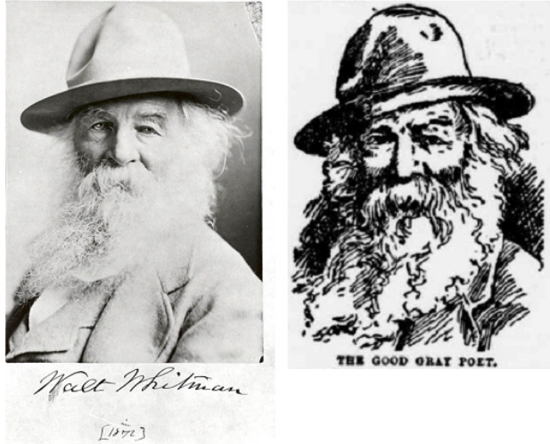
Figure 3: Comparison of Sarony's photograph with the sketch in the Evening Star .