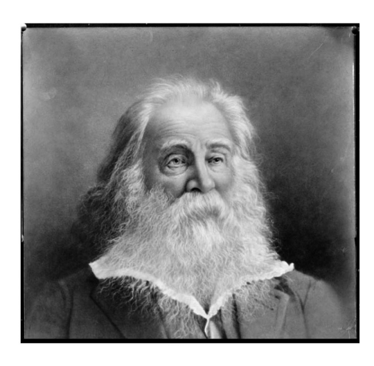
The 1889 Gutekunst photograph ( 4 \frac{3}{4} \times 6 \frac{1}{2} ,") is compared here with the painting reproduced on the back cover of the Spring 2008 issue of the Walt Whitman Quarterly Review . The reproduction of the photograph on the left has had scratches and the tone scale slightly adjusted in Photoshop by LH for greater clarity.