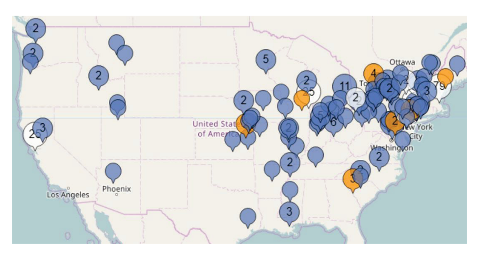
Figure 1. Some locations of reprints of Whitman's poetry, seen in the Library of Congress's ViewShare interface (viewshare.org/views/mxcohe/walt-whitmans-poetry-reprints).

We draw from a wide range of nineteenth-century venues, including newspapers, magazines, advertisements, reviews, correspondence, interviews, and anthologies. The net we cast is wide because of the challenging realities of nineteenth-century publishing. Poems were not always reprinted in full, and often had their titles removed or altered. The names of authors sometimes only appeared as initials, if they appeared at all. In studying any nineteenth-century poem or short story, it is methodologically significant that the author might not have been a meaningful figure for readers of a text because of the era's rampant reprinting and excerpting. While the Poetry Reprints effort emerges from the increasing use of digital archives to study nineteenth-century textual circulation, it speaks back to that emerging methodology as well, which is full of possibilities but laced with pitfalls. Some of our initial discoveries also have implications for the study of Whitman's poetry, his career, and his approach to the literary marketplace. In what follows, we describe the background of this work and our approach. We then offer two case studies from our early findings, and we conclude with reflections on their implications for the wider effort to study the circulation of nineteenth-century literature.