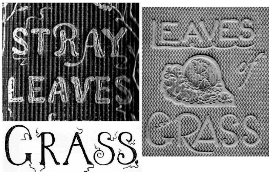
Figure 3: Top left: Stray Leaves spine (detail); right: cover 1860 Leaves of Grass ; lower left: title page 1860 Leaves of Grass (detail).