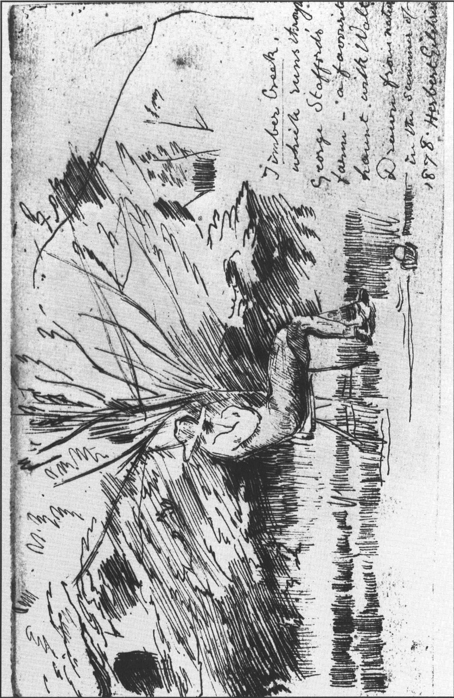
Herbert Gilchrist's pen and ink drawing of Whitman at Timber Creek in 1878. On exhibit at New York Public Library. See p. 232.