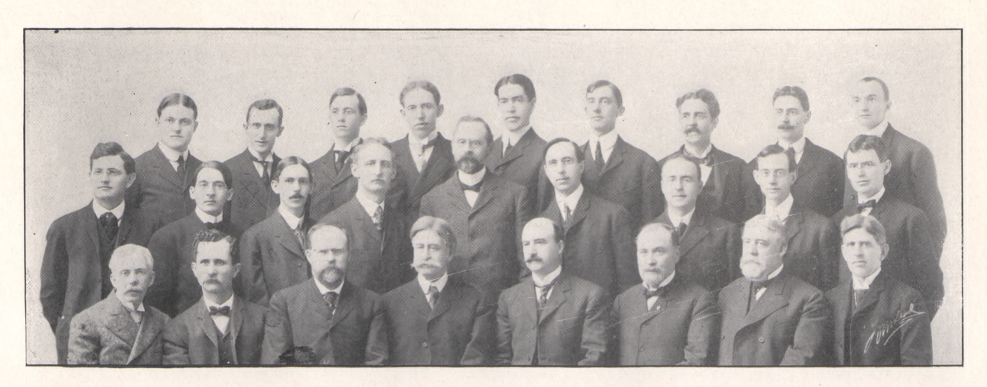
FACULTY OF THE COLLEGE OF APPLIED SCIENCE