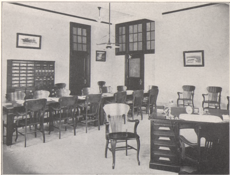
FIG. 2 PLATE I