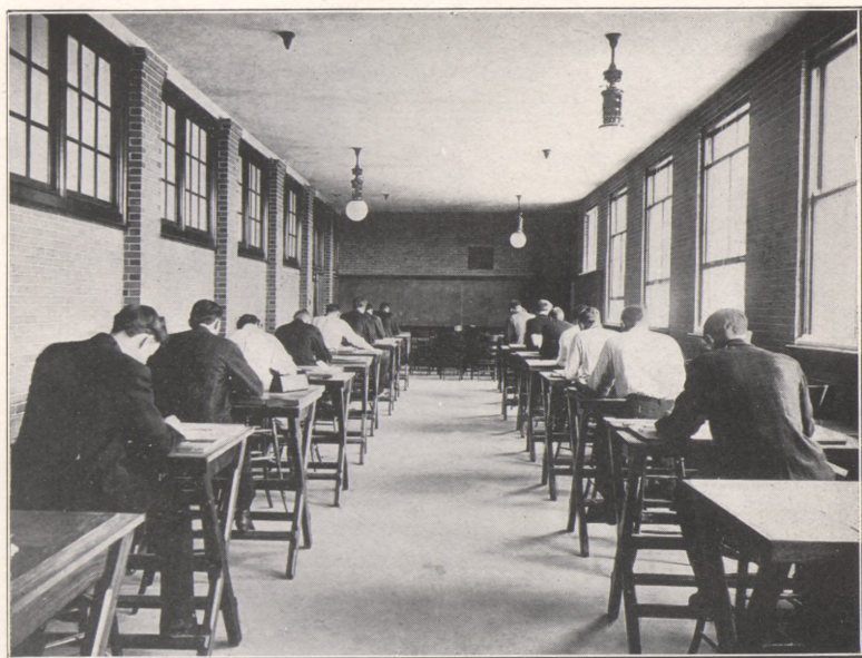
FIG. 2 PLATE II