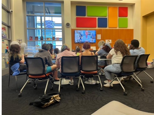
Figure 1. Students in the Teen Space at the Iowa City Public Library watching The Undergraduate Life of Hector .

Overall, I am immensely grateful to have participated in the Latham program. The people I met along the way have made it fruitful, and I have learned many valuable lessons. One primary lesson that I learned is to never doubt the amount of time and effort that creative work takes to get to the final product. I learned this throughout my time editing my videos as they took a large chunk of my time to complete in a way that satisfied me and fulfilled the criteria that would fit my target audience.