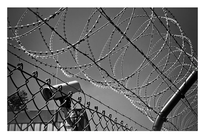
Figure 1: Surveillance Camera.

There are unfortunately many more examples like the above incidents, and, under our current national administration, they are increasing, as white people feel licensed and emboldened to publicly express their racist rage and fear. In the opinion piece "Why Do White People Feel Entitled to Police Black People," published in the online publication the Root , Monique Judge brilliantly addresses the last incident we mention above with a counter scenario: "Imagine this particular situation in reverse. A ... white woman comes home to her apartment building and finds her entry blocked by a ... Black man ... demanding that she tell him what apartment she lives in [and that she] has to prove ... she lives there." If this scenario seems absurd, we should consider why, in our current cultural climate, the idea of a Black man policing a white woman's behavior in the public sphere is unimaginable.