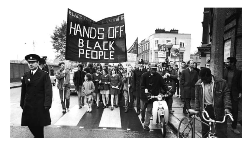
Figure 2: A protest organized by the Black Defense Committee in response to the profiling and repression of Black people. Notting Hill, 31 October 1970.

In Policing the Crisis: Mugging, The State, and Law and Order, Stuart Hall and his coauthors lay out how regimes of power stir up fear of groups who experience social, cultural, and political marginalization through memory screens, which distort their history of oppression (Hall 1978). These regimes create a constellation of repression, surveillance, and demonization. This tactic of mobbing through moral panics and fear mongering upholds a repressive state. In order to retain power, racist regimes convince the white majority to fear and demonize the racial Other. Prime Minister Margaret Thatcher and her cronies in law enforcement sensationalized "mugging" as a rationale to tighten border security, and to harass, ostracize and seek to control and surveil Black and brown bodies to consolidate their conservative base. The state used these tactics as a screen to avoid addressing the racism that undergirds the actual choices of the poor and the push and pull factors of immigration.