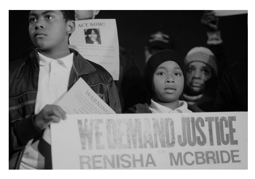
Figure 6: "Youth demand justice in the shooting death of an African American girl in Dearborn Heights during the early morning hours of November 2, 2013." 7 November 2013.

To attend to these problems, we argue for a move that is, in some ways, a return to classic Birmingham School cultural studies from which Hall was a key founder, and, in other ways, a divergence from this school. Like Western Marxism more generally, cultural studies, as its name so clearly indicates, turned to culture as a realm of struggle both semi-autonomous from and tightly articulated to the economic and political structures that shape everyday life under capitalism. Their method was also Marxist in nature, consisting in the continuous dialectical untangling of reification and utopia, domination and resistance, the people and the power bloc, in the proliferating products of the culture industry. A change since then is the relationship between the culture industries and political power. If, in the later twentieth century, we could assume a close and complex articulation between political power and cultural hegemony, which it is our job as Americanists and intellectuals to expose, there is now in the twentieth century an increasing divergence between those who hold the reins of state power and those who finance and create global culture.