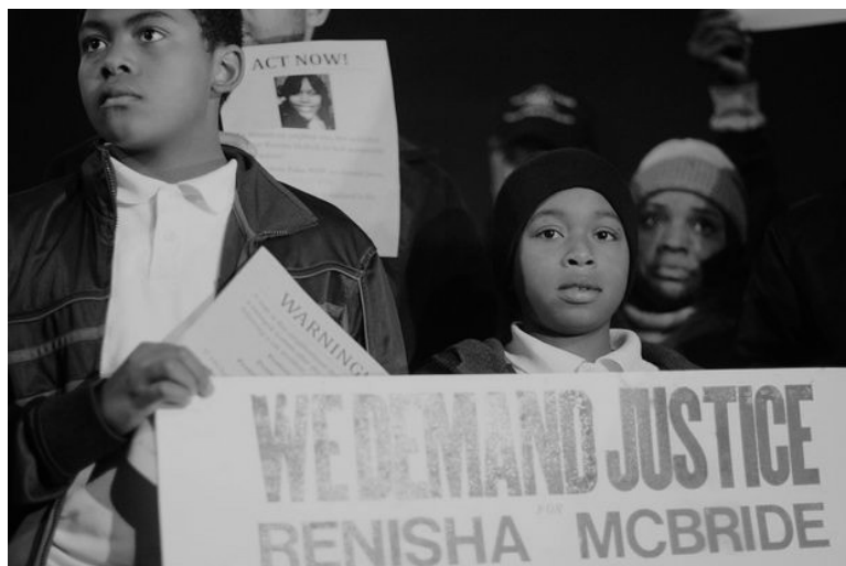
Figure 6: "Youth demand justice in the shooting death of an African American girl in Dearborn Heights during the early morning hours of November 2, 2013." 7 November 2013.

To attend to these problems, we argue for a move that is, in some ways, a return to classic Birmingham School cultural studies from which Hall was a key founder, and, in other ways, a divergence from this school. Like Western Marxism more generally, cultural studies, as its name so clearly indicates, turned to culture as a realm of struggle both semi-autonomous from and tightly articulated to the economic and political structures that shape everyday life under capitalism. Their method was also Marxist in nature, consisting in the continuous dialectical untangling of reification and utopia, domination and resistance, the people and the power bloc, in the proliferating products of the culture industry. A change since then is the relationship between the culture industries and political power. If, in the later twentieth century, we could assume a close and complex articulation between political power and cultural hegemony, which it is our job as Americanists and intellectuals to expose, there is now in the twentieth century an increasing divergence between those who hold the reins of state power and those who finance and create global culture.