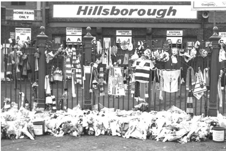
Figure 2: Tributes at Hillsborough Stadium:

The 1989 Hillsborough stadium crush that killed 96 football (soccer) fans is commonly marked as the titanic shock that transformed the English game from its insular, violent, and distinctly working-class 1970s and 1980s version to the corporate international spectacle it became in the 21st century. In the crush, at the start of a FA Cup semi-final, dozens of fans suffocated, trapped between fences at the front of the stands and the weight of the fans behind them. It was the most catastrophic of a series of fatal crowd incidents in English football stadiums in the 1980s that were caused in part by authoritarian police tactics and poorly-regulated infrastructure. As popular historian David Goldblatt (2014) writes, the disaster became, “a summation of the many changes that football and the nation had undergone” (44). Hall’s “The Neoliberal Revolution” allows us to consider the crush and its aftermath not as a radical shift, but part of an expansion of a larger hegemonic project enacted by the state and its corporate allies to gain more control over public spaces like football stadiums. As state strategies steeped in violence became less tenable, powerful neoliberal entities re-envisioned the stadium as a class-stratified profit center with the potential to serve their ideological purposes.