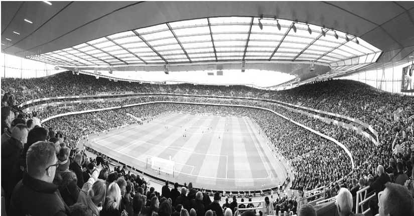
Figure 4: Arsenal's Emirates Stadium, 22 October 2016.