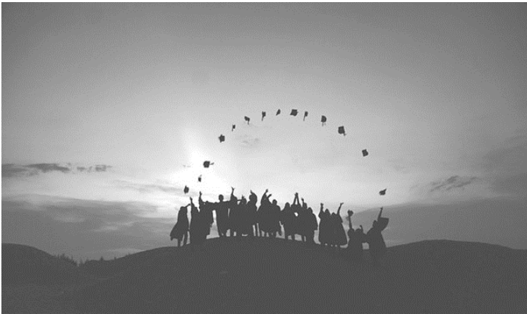
Figure 2: “Graduates.”

It is common, on such an occasion, to see students wearing various insignia of “distinction”—tassels and medals and the like. And, to be sure, Hall, himself the recipient of a Rhodes scholarship to Oxford in 1951, would have offered nothing but the sincerest congratulations to these hard-working young women and men who graduate with honors. Although he abandoned work on a Ph.D. in order to focus on political activism, ultimately Hall found his calling in academia. Never, though, did he cease believing that the role of education is not to sort students into the categories of winner and loser, gifted and dull, but instead “to enlarge our capacities as people .” And never did he lose faith in the potential of people , working together, to develop a “vision of how the society as a whole could be better and what we would have to do to make it so” (66-67). We do not need mediocre meritocracy. We certainly do not need hereditary aristocracy. What we do need is utopian thinking. We need to “throw ourselves beyond the limits of what exists” and regain faith in our ability to transform our dreams of what “could exist” into reality. Most of all, we need everyone, including every member of my daughter’s graduating class, to help us get there.