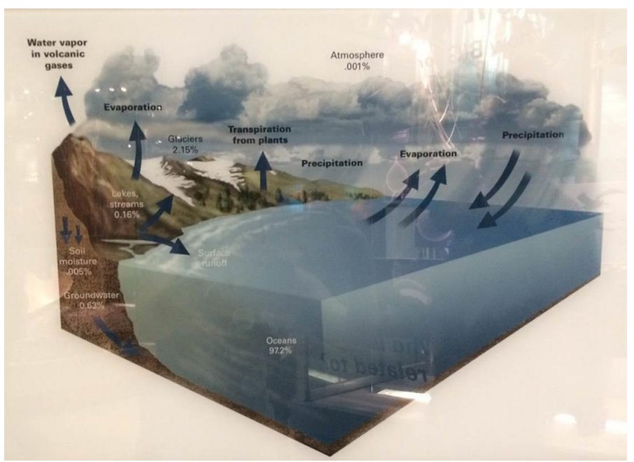
Figure 2. Diffractive photo of the hydrological cycle at the Smithsonian Natural History Museum exhibit on oceans taken May 20, 2018.

there are "elements that can come into play in various strategies. It is this distribution we must reconstruct, with the things said and concealed, the enunciations required and those forbidden, that [discourse] comprises" (p. 100). In this image, aside from a few scattered trees and a pale patina of grass, living organisms are absent. By leaving out living organisms, the image obscures the intimate and fraught relationships between water, human, and nonhuman life and conceals water's identity as a life force.