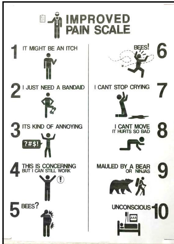
Figure 2. “Improved Pain Scale.” Unknown Author. Available from https://www.reddit.com/r/nursing/comments/6y4iia/an_improved_pain_scale/

10, but it is presented in two vertical columns, which makes the items appear less closely connected. The phrasing of the first item, “It might be an itch,” suggests that it is unclear if a person is experiencing pain, and if so, what kind of pain. This is different from the FACES scale, which begins with “no pain” and does not specify any particular pain sensations (such as itching or burning, or as this scale later describes, bee stings). Questions about the existence and type of pain persist through item 5. From there, the distance between each item increases exponentially—from “Bees!” to “I can’t move it hurts so bad” to “Mauled by a bear or ninjas.” The scale ends with “unconscious,” implying that a person is no longer capable of rating their pain. In this scale, both the quantitative measures and qualitative types of pain are increasing. Because the images do not show the same kind of overall iconic progression, they better represent the unpredictable yet persistent experience of living with pain.