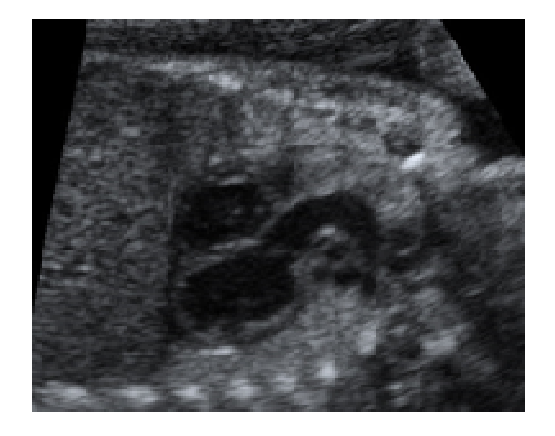
Figure 2: Dilated aortic root evident at 28w4d

Ultrasound at 37w5d showed AFI of 6.79; assessment for fetal anomalies was not done at this time. Fetal evaluation prior to delivery at 38w5d identified oligohydramnios (AFI-4.92), persistence of elongated long bones, and a reassuring biophysical profile with a BPP 8/8. Fetal echo revealed dilation of the aortic root, proximal pulmonary artery, and pulmonary valve annulus.