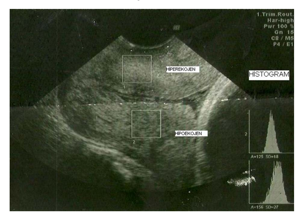
Figure 1: Description of histogram method with transvaginal ultrasonography

an ultrasonography instrument branded as General Electric Logic 9 (USA) 5 MHz transvaginal probe, and evaluated by the same person.