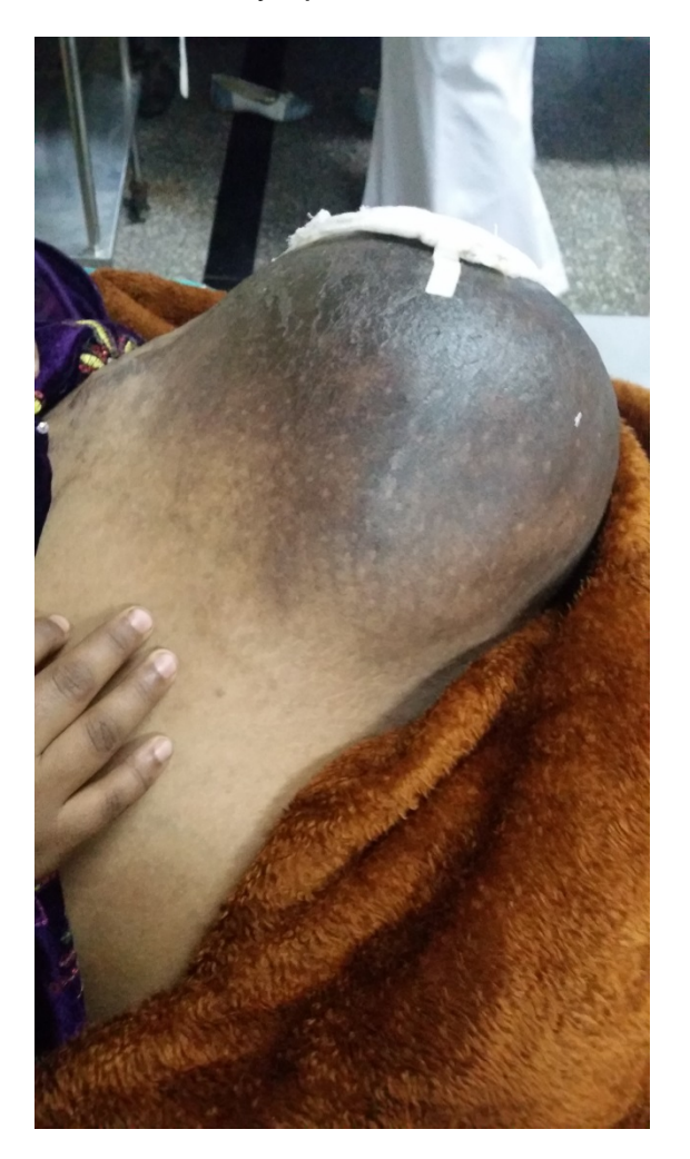
Figure 1: Abdominal examination revealed a big infraumbilical incisional hernia

1). Her ultrasound scan reported a single living fetus with average biometry of 28 weeks. Surgical consultation advised MRI to exclude strangulation (Figure 2). MRI revealed no strangulation, so the patient was managed conservatively with good care of the skin, bed rest and analgesics till resolution of symptoms.