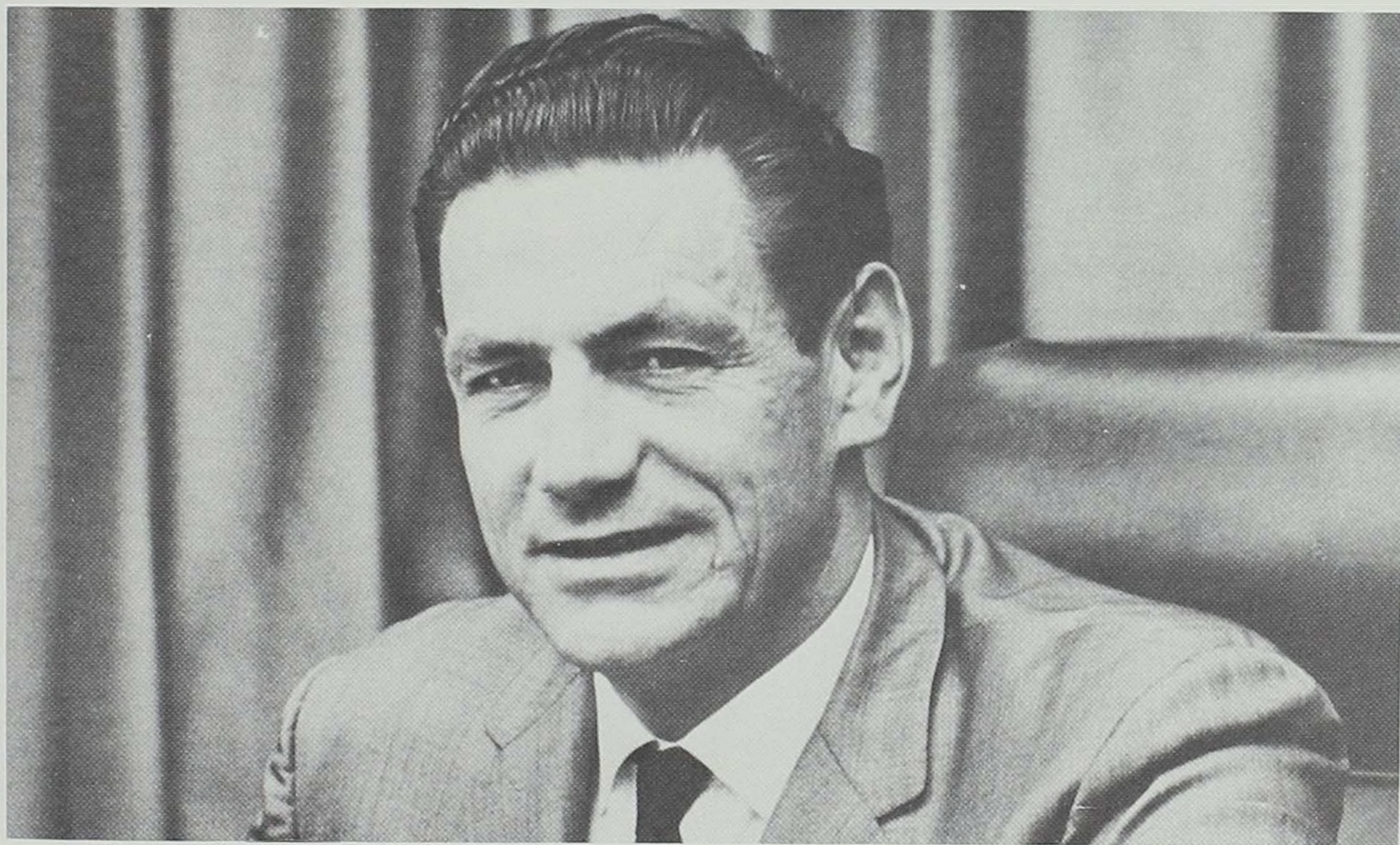
Governor Harold Hughes (SHSI)