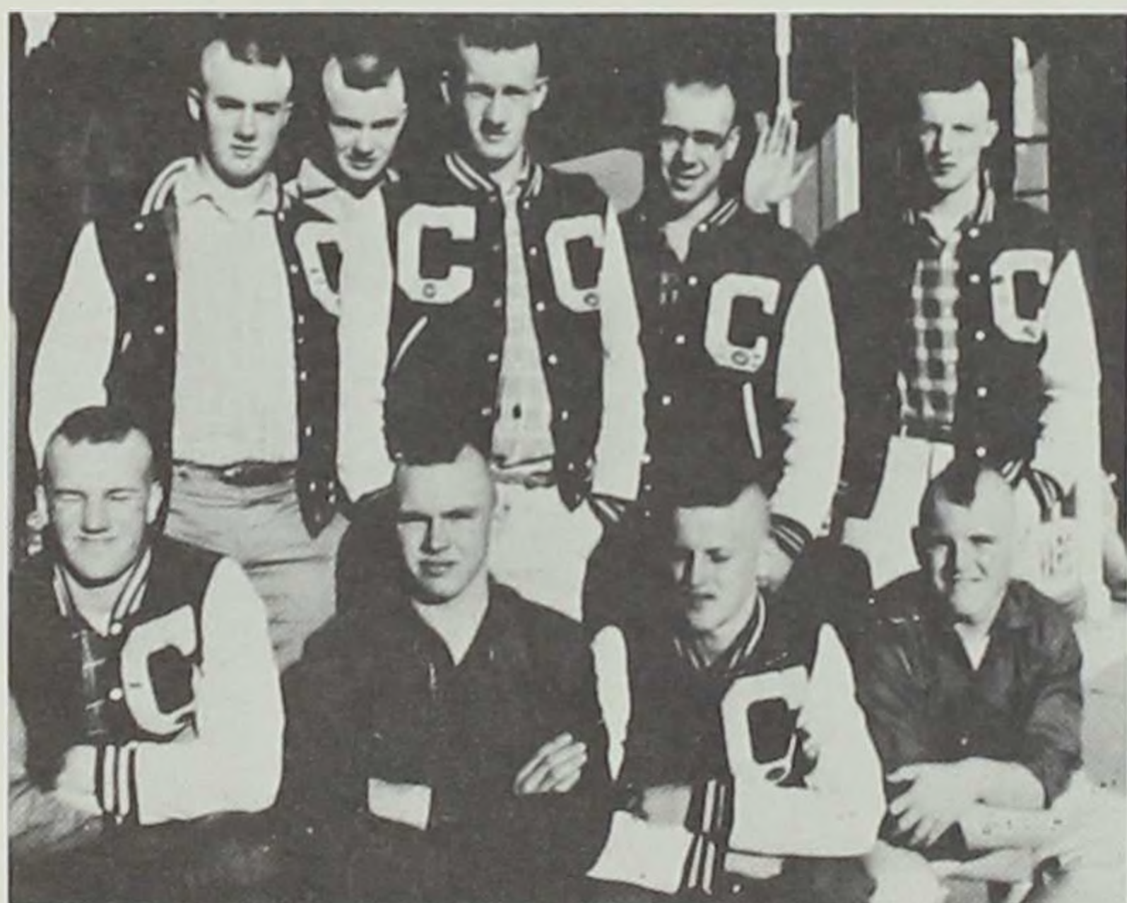
Iowa teenagers from Columbus Junction High School were expelled for their Mohawk haircuts in 1959.

editorial reply to the Waterloo Courier on May 12, 1958, local teenagers queried: