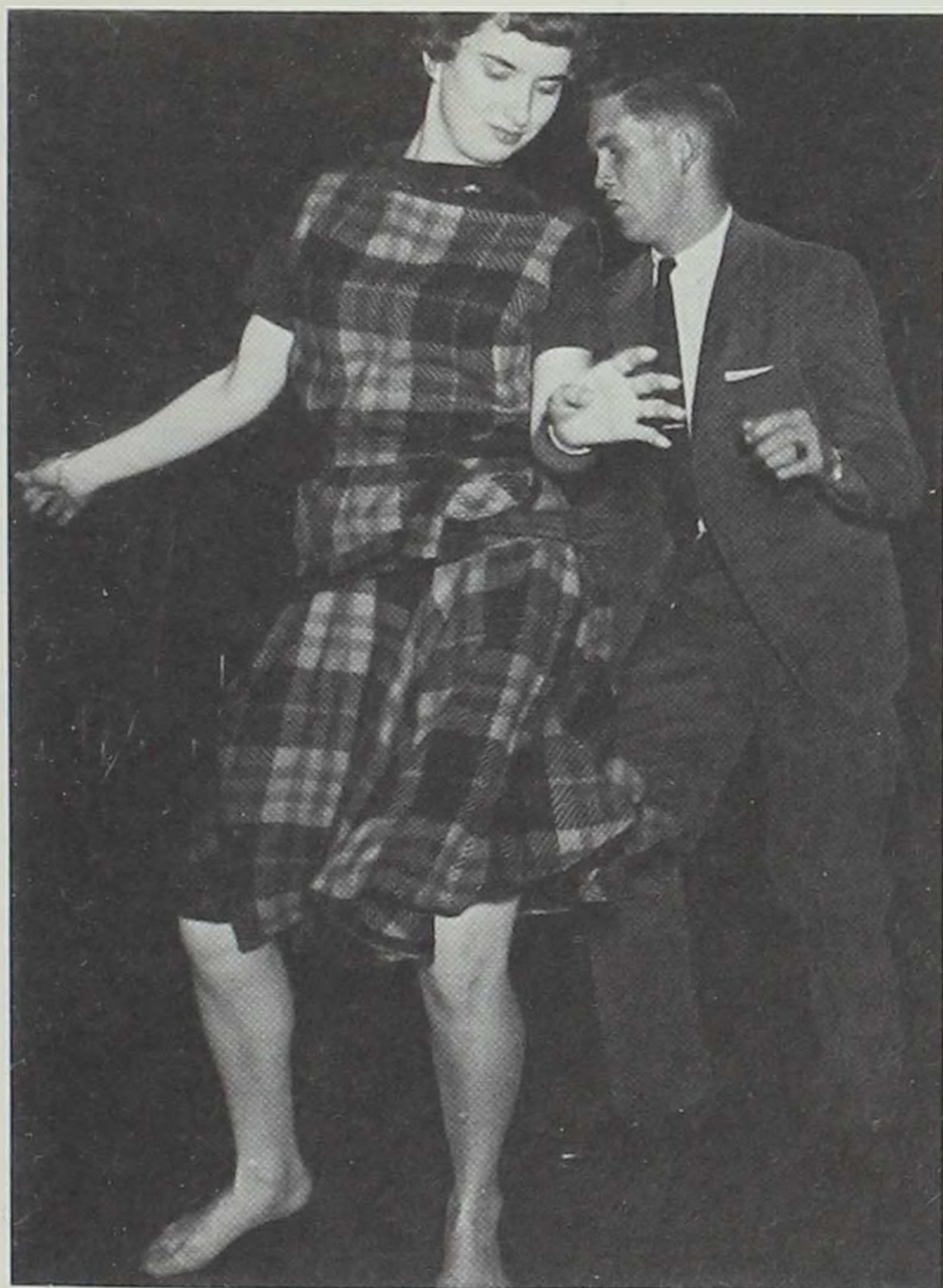
Iowa teenagers rock 'n' roll in the 1950s