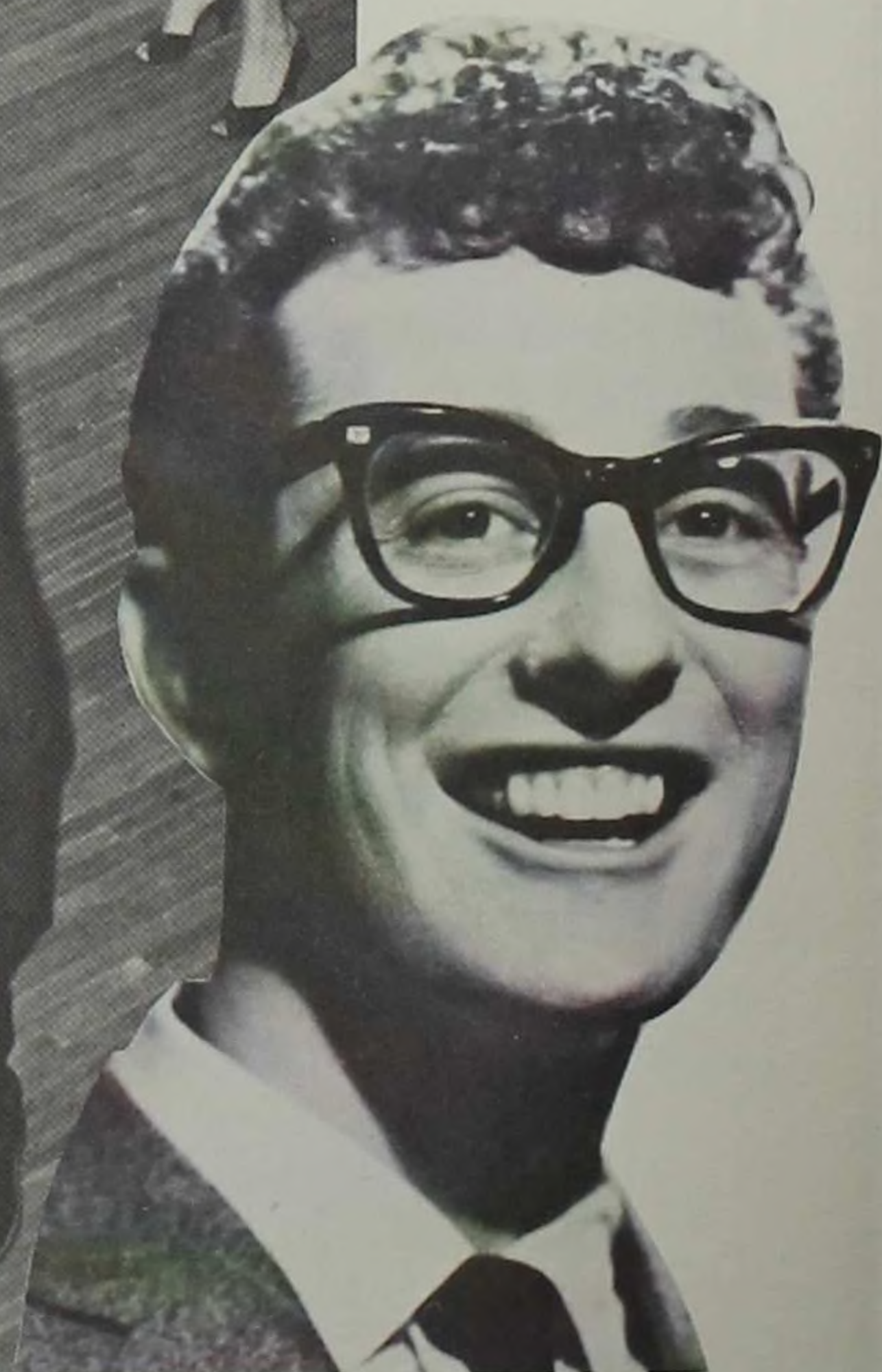
Buddy Holly