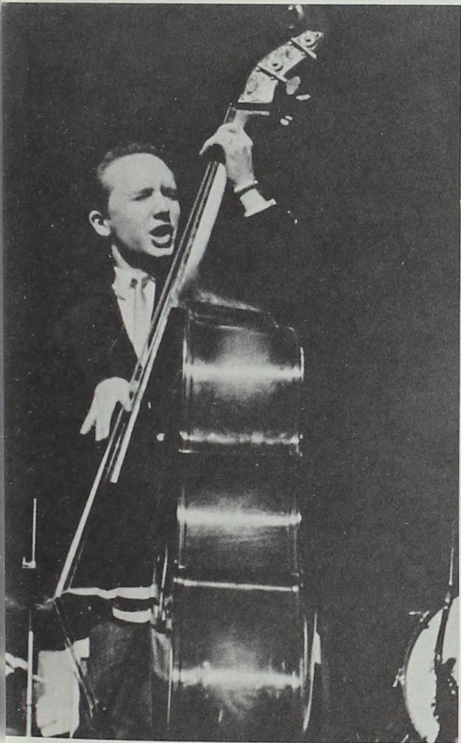
rickets) on bass

ground in composing Broadway and film music. His studio was unique musically as well as geographically. Instead of charging musicians studio time by the hour, he charged by the finished product, which encouraged musicians like Buddy Holly to refine and polish their songs.