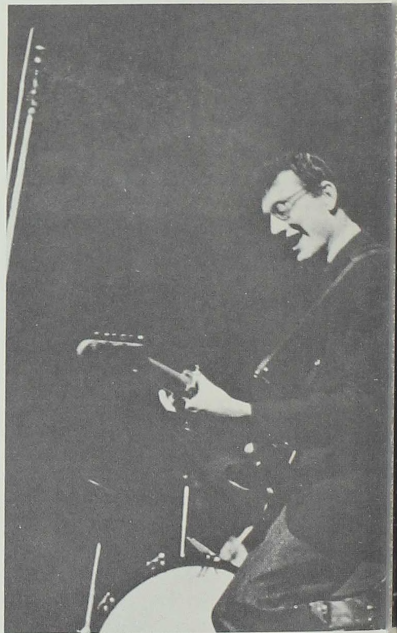
Buddy Holly, with Joe B. Mauldin (one of the original Crickets)

The "Buddy and Bob Show" expanded numerically and musically in 1955 to include drummer Jerry Allison, another young Lubbock musician who echoed Buddy's growing appreciation for rock 'n' roll music. Sonny Curtis, a local guitarist, also joined the group. Hol-