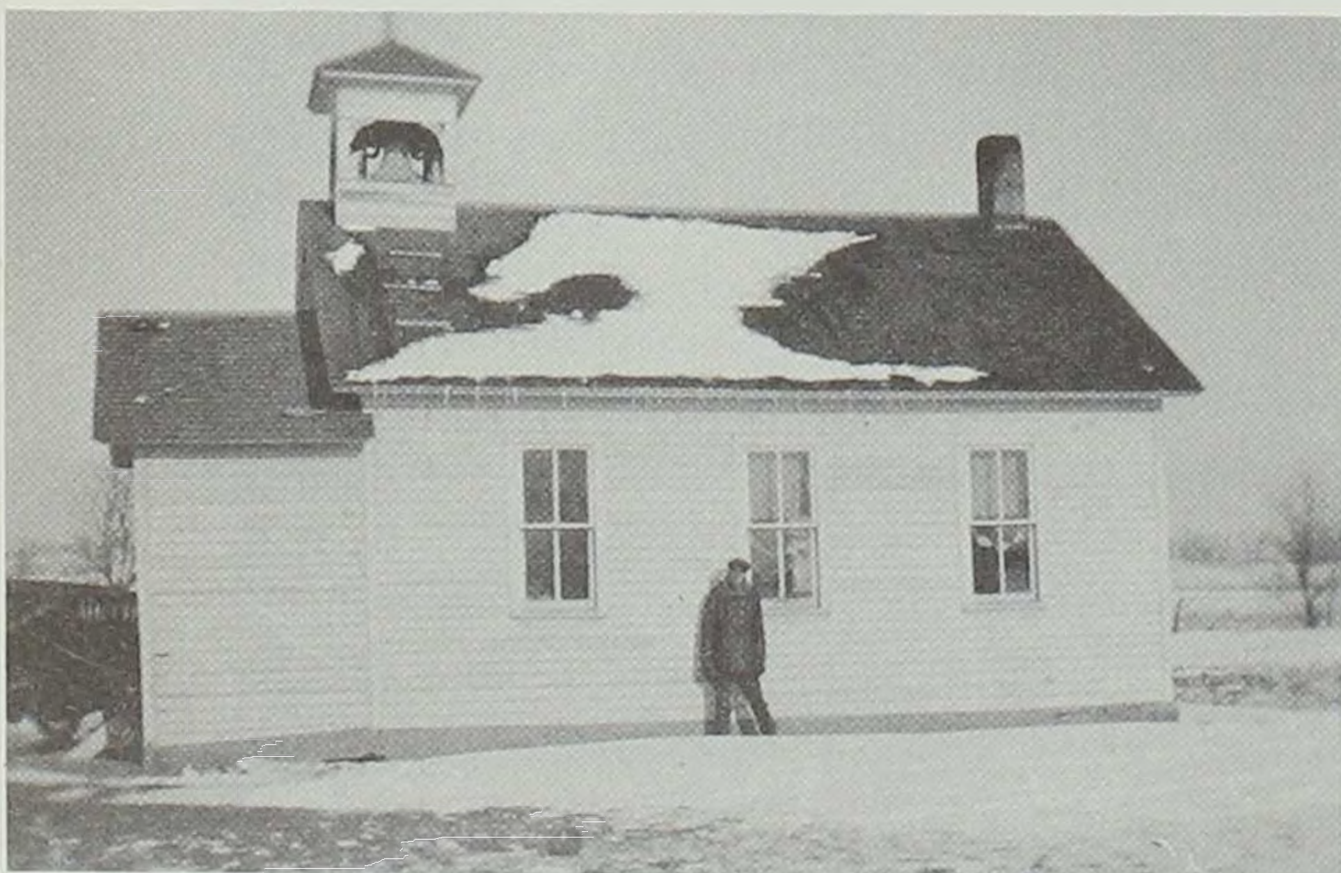
The author and her cousin Ione taught in country schools two miles apart. Here, Ione's school (District Number 5 in Grant Township) on a less snowy day in 1936.