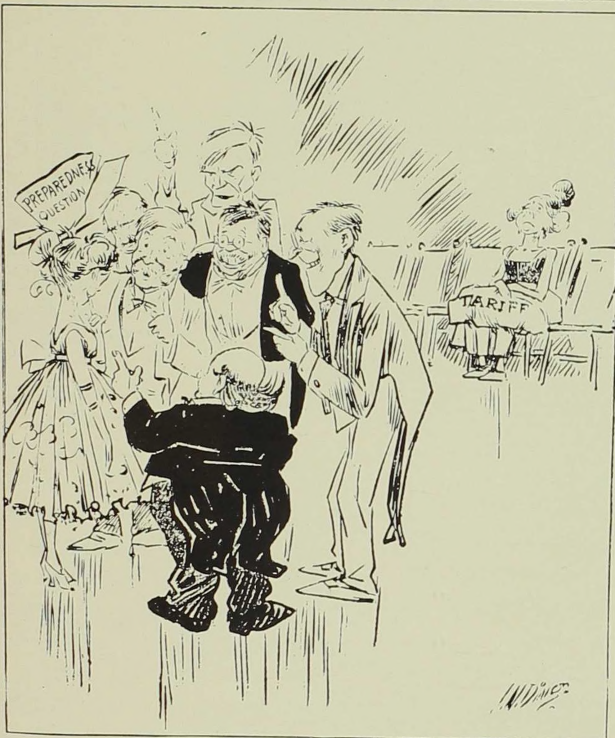
CARTOON BY "DING" IN THE DES MOINES REGISTER, FEBRUARY 1, 1916