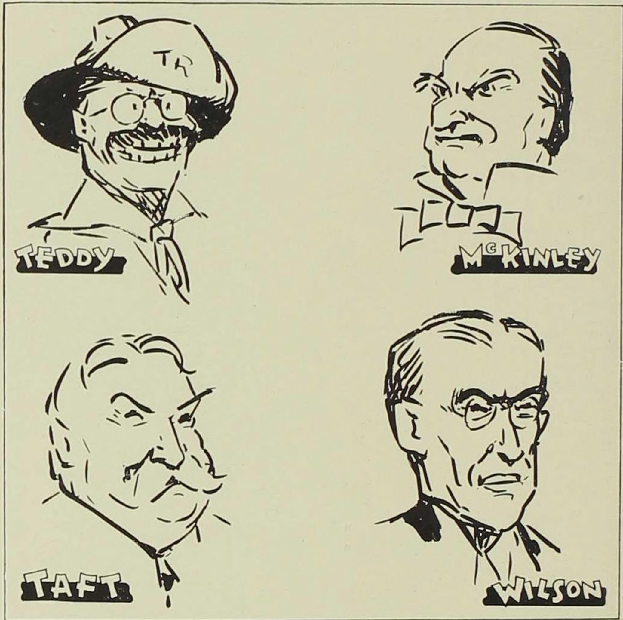
DRAWN EXPRESSLY FOR THE PALIMPSEST BY "DING"