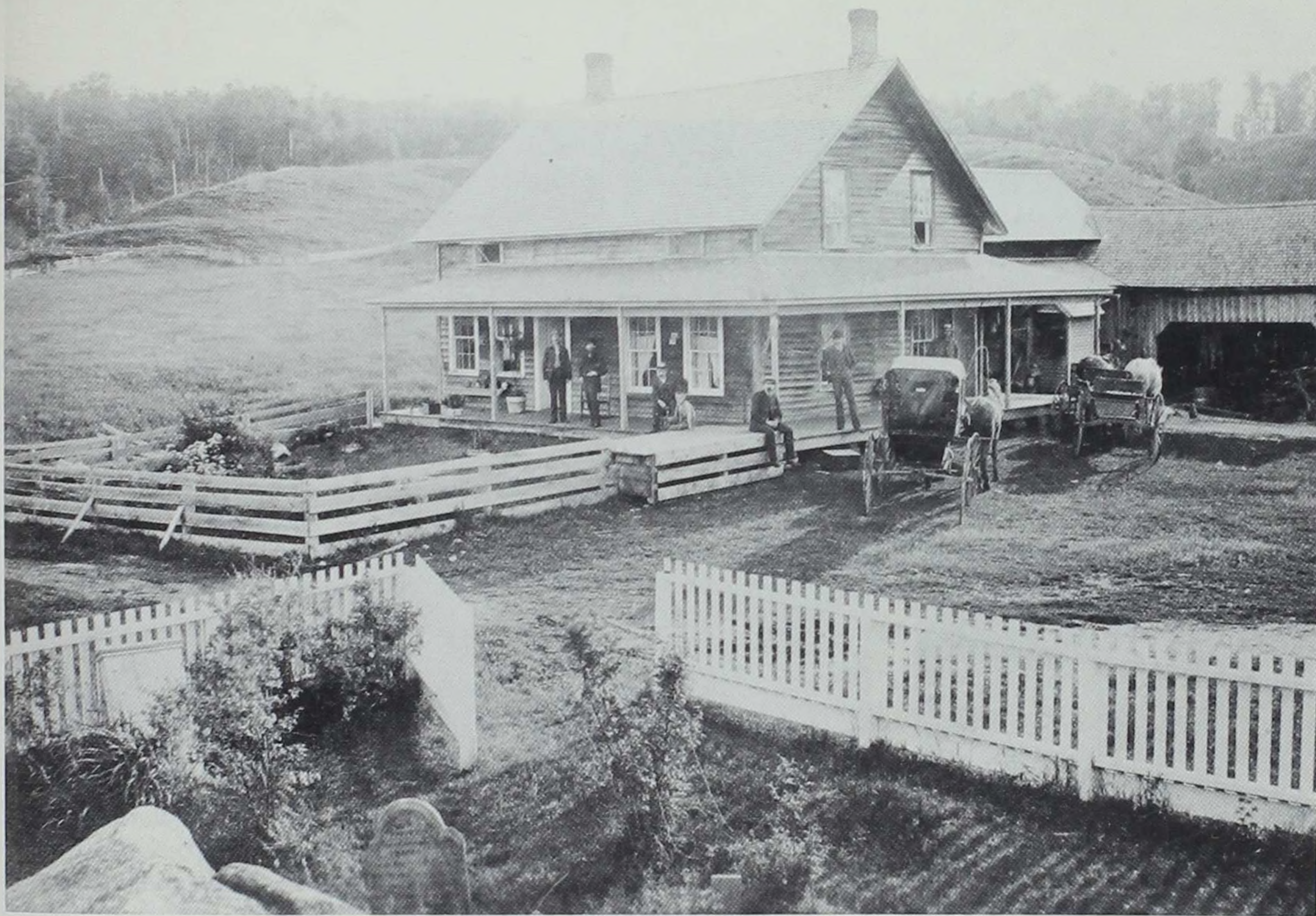
John Brown's home in North Elba, New York. His grave is enclosed by the picket fence in the foreground.

along the Shenandoah River, near the water's edge.