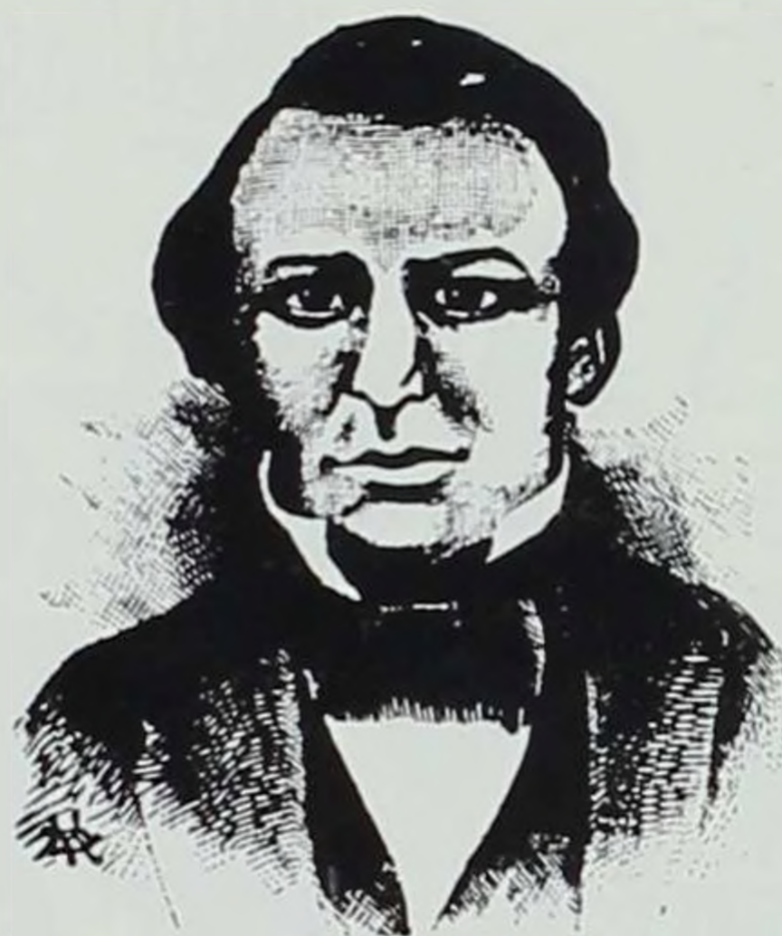
JOHN HENRI KAGI.

Of Brown's followers, only John Kagi, Brown's secretary of war, knew that a possible target was the federal arsenal at Harpers Ferry, at the fork of the Potomac and Shenandoah rivers. When Brown finally disclosed the details, Charles Tidd and Brown's sons branded the plan an act of suicide. Steward Taylor and others joined the dissidents—but Brown's charisma quickly pulled the group together again. They waited out the final months before the attack in a farmhouse five miles from the small Virginia bordertown of Harpers Ferry (below).