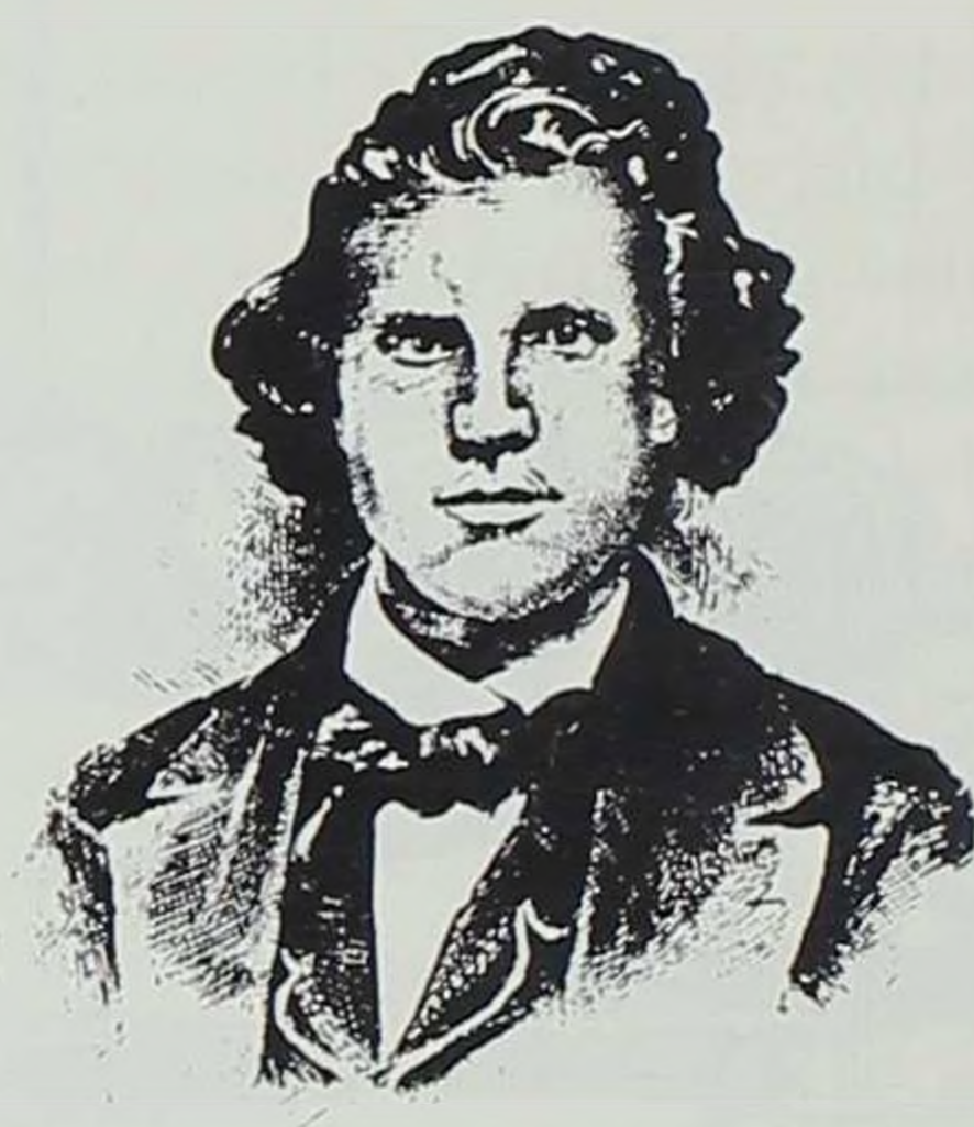
DAUPHIN ADOLPHUS THOMPSON.

until the next decade brought the Civil War.