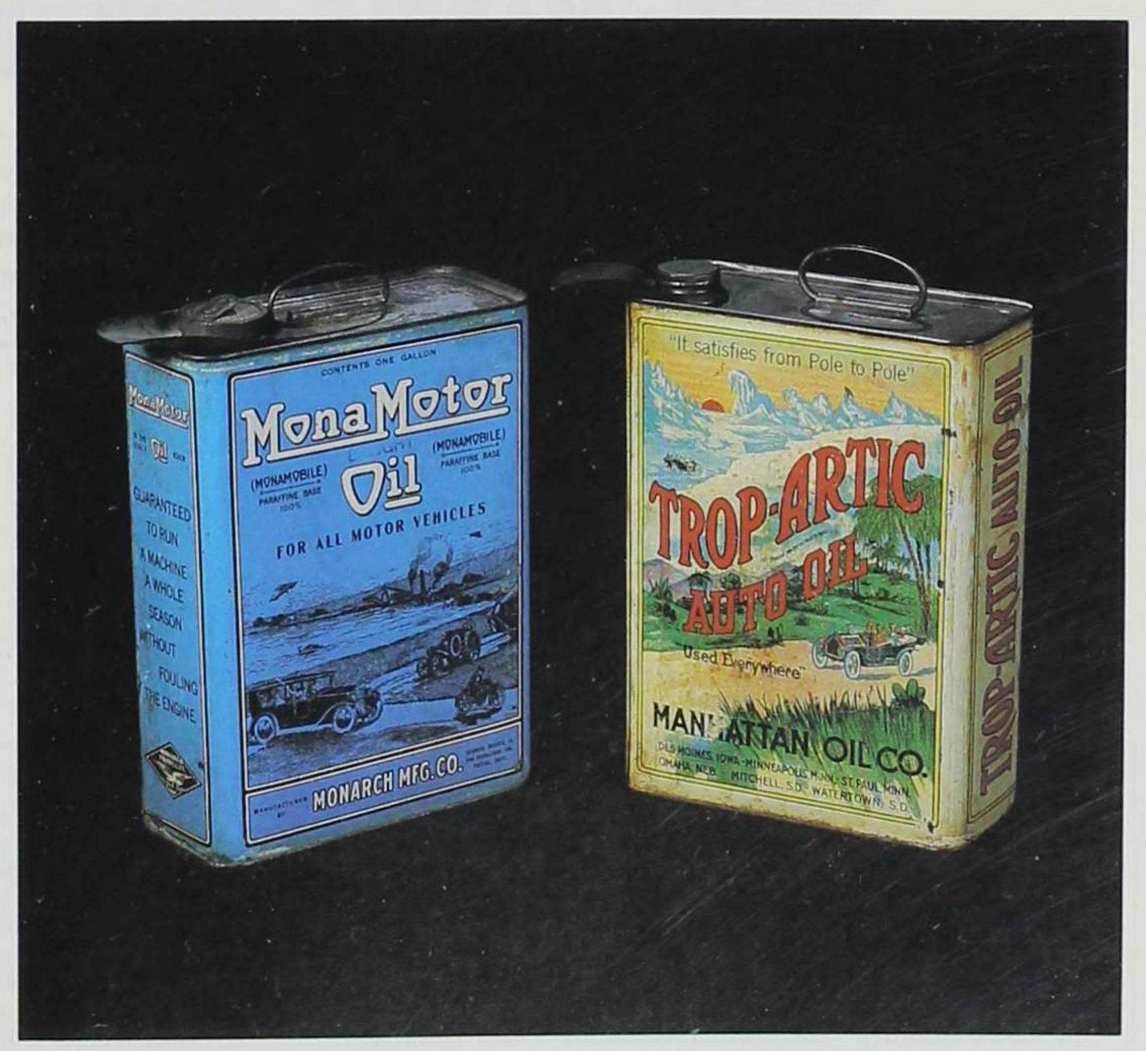
Rare today, the once ubiquitous one-gallon can, often with its own spout, was

ily favored the major oil companies that owned most of Iowa's bulk stations and service stations and, hence, could control prices. In 1935, two thousand Iowa oil