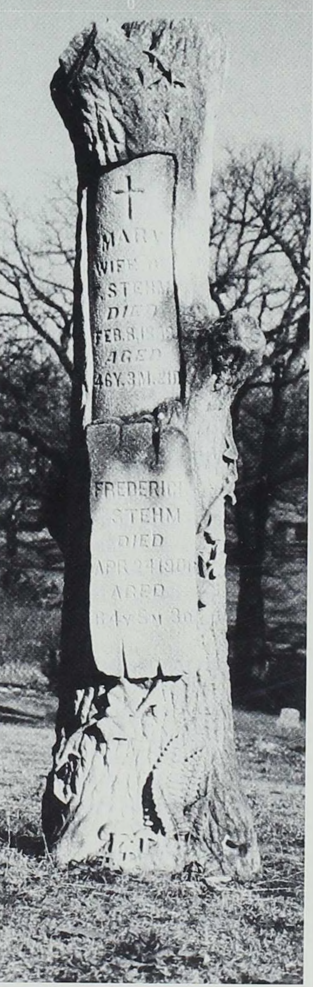
Typically, a section of "bark" appears to have been peeled back, leaving space for carving.

Colorado stonecarver Henry Cicutto agrees that "they're not really so hard. The log is easy. Now when someone wants a log with an axe or an anchor with a chain, that's another matter." Yet one reason for the popularity of the treestump marker may have been its potential to be individualized with personal symbols. The treestump itself symbolizes an ended life, as these markers most often replicate a broken tree trunk, abruptly cut off. Though one treestump marker in Woodland is actually ceramic rather than limestone, the size may symbolize the infancy of the person it commemorates. Only fourteen inches high, the ceramic marker was made as a tribute to infant Edward Louis Israel, whose short life spanned December 26, 1911 to January 21, 1912. Details artfully carved into treestump markers bear more symbolism. The rose, for example, can symbolize everlasting love. One marker uses the symbol figuratively and literally. A treestump includes carved ivy, a symbol of adorned with a large carved rose is strong and enduring faith and