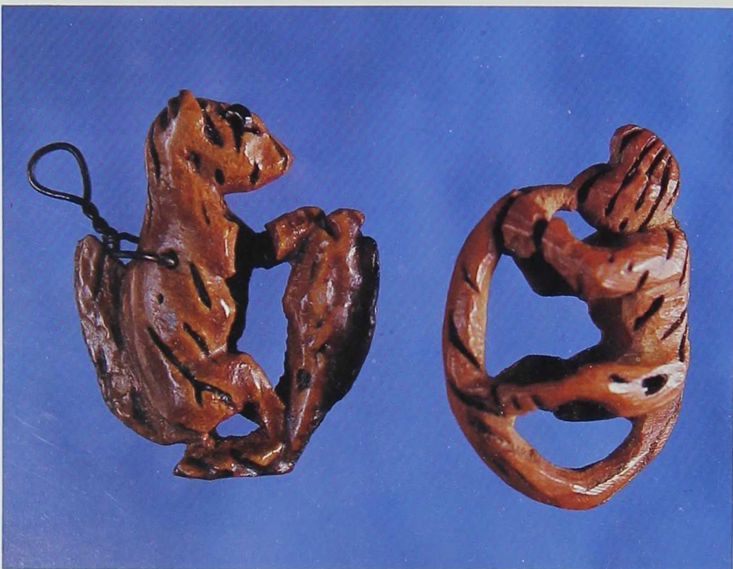
Left: Carved from peach pits, a squirrel (clutching an ear of corn) and a monkey (1¼").