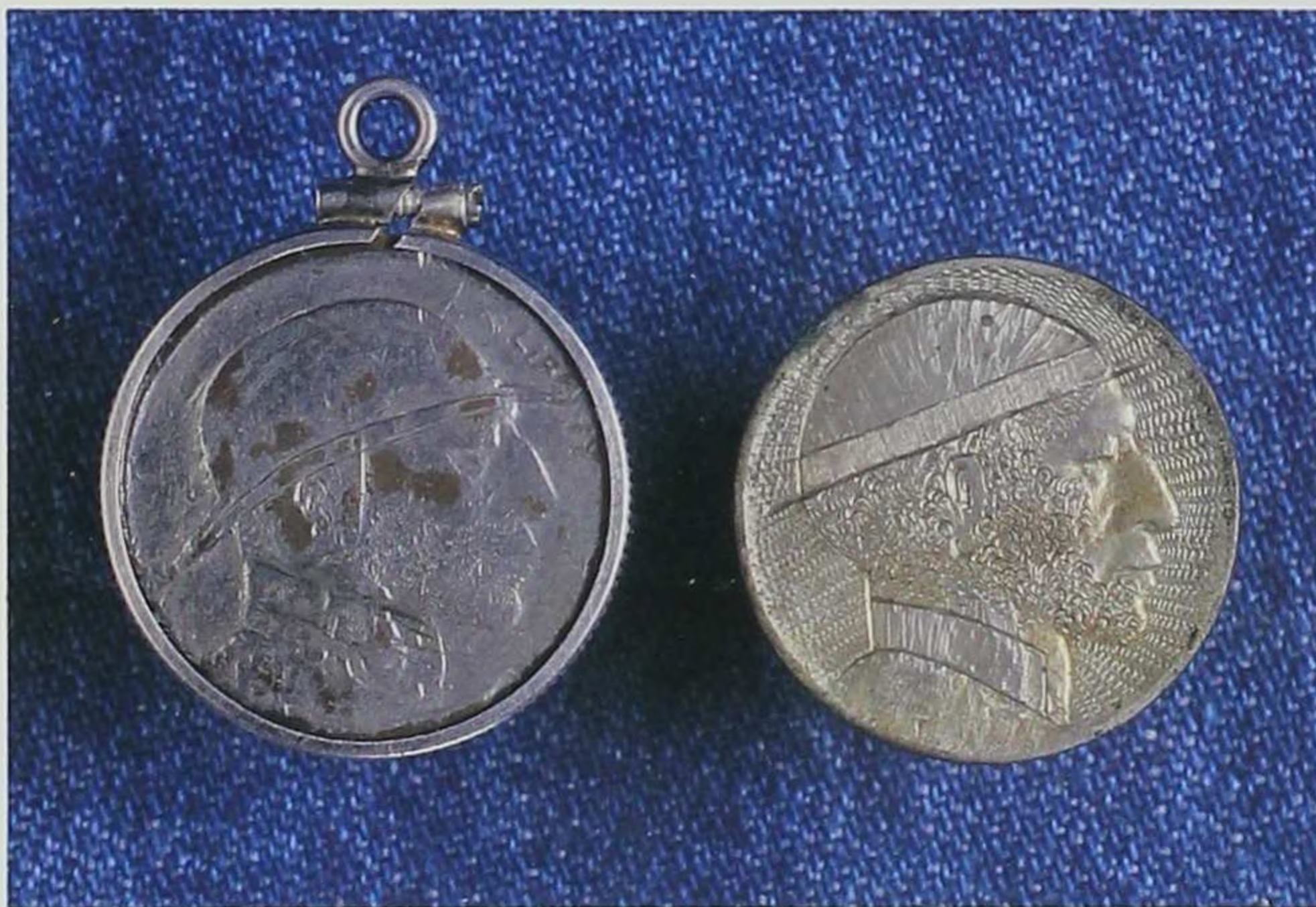
According to Horton, unemployed engravers, and others with such skills, created "hobo nickels" by altering the profile on Indian-head nickels. Encased, some may have been used as watch fobs.