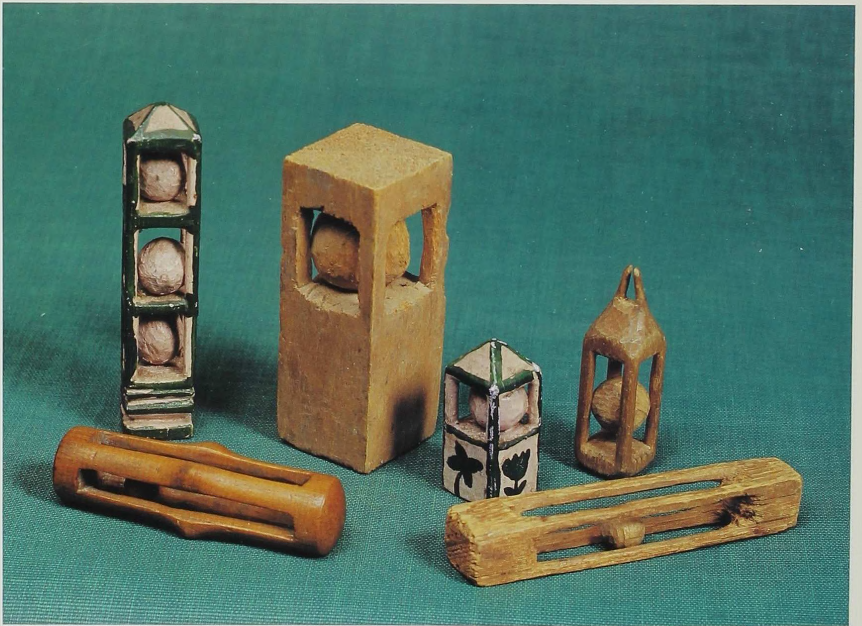
Above: Carved from a single piece of wood, the ball-in-the-box is still an extremely common creation. Some shown here were found in flea markets; one, in the walls of a small-town depot. Hoboes sometimes wore the simpler ones (front row) as slides on red bandana neckerchiefs.