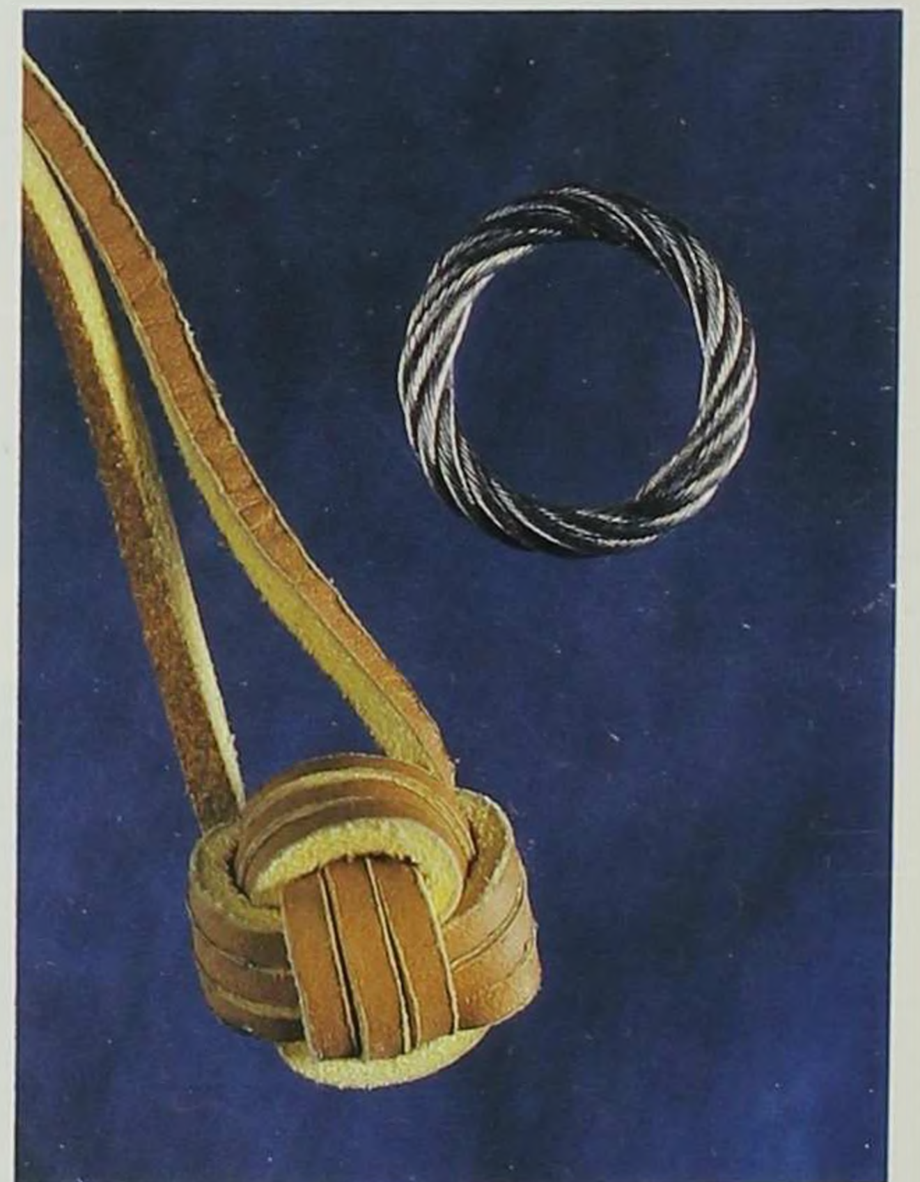
Today's hoboes still create tokens of their personal style: leather pendant by "Knot-man" (son of "Alabama Hobo") and cable ring by "Frisco Jack." The rings have been auctioned at Britt's hobo festivals to raise money for the hobo section of the town's Evergreen Cemetery.