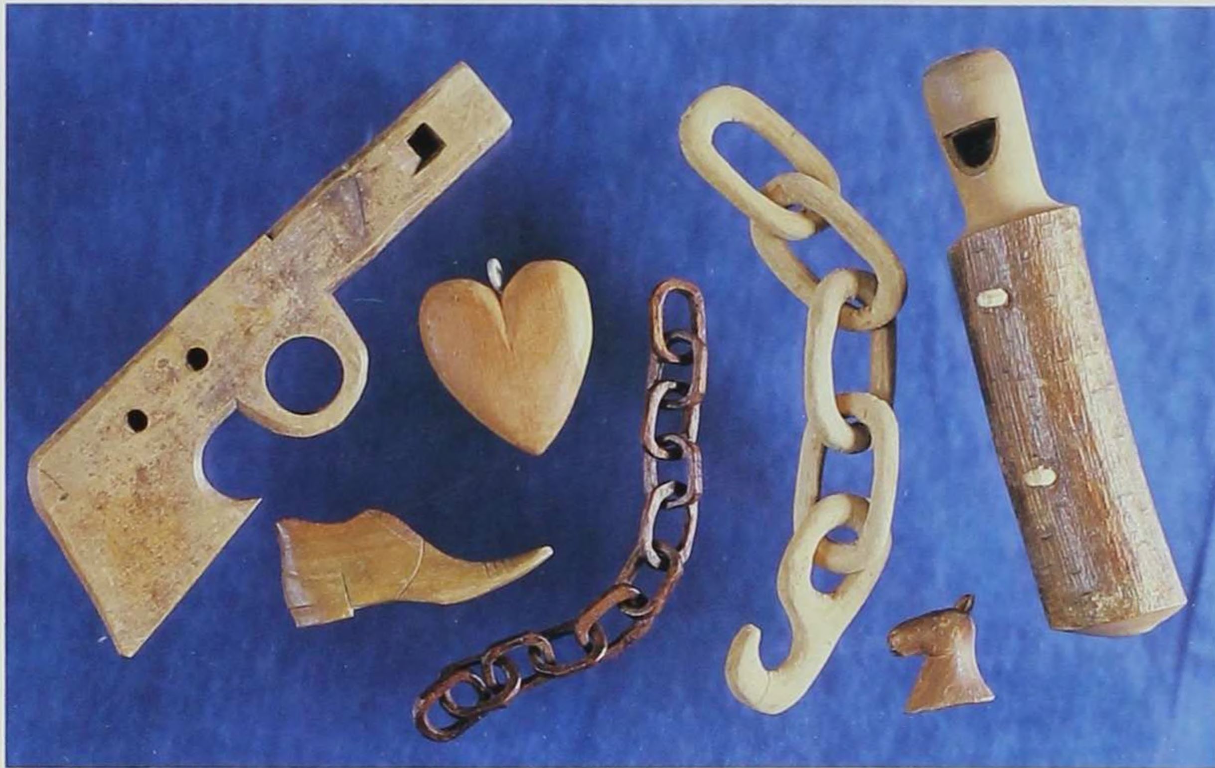
Left: More creations from the whittler's knife. Two whistles (one shaped like a gun); chains from a single piece of wood; and a shoe, heart, and horse. These may have been carved by hoboes as tokens in return for a meal or other kindness.