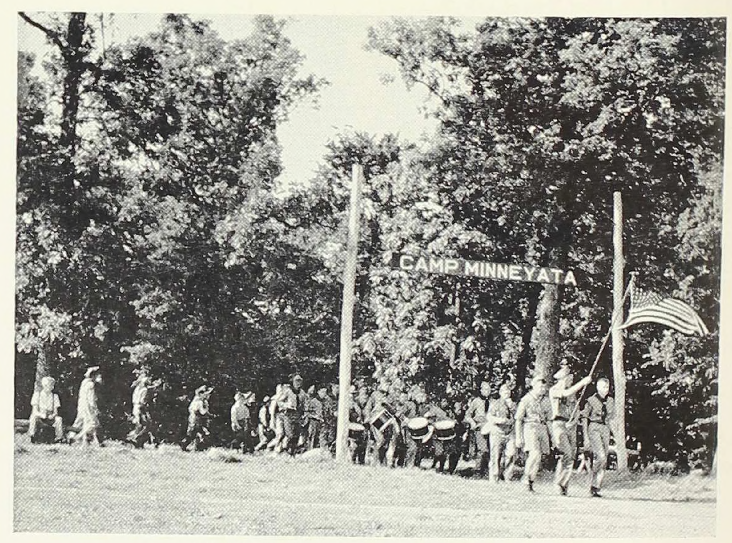
Buffalo Bill Council Scouts on Parade