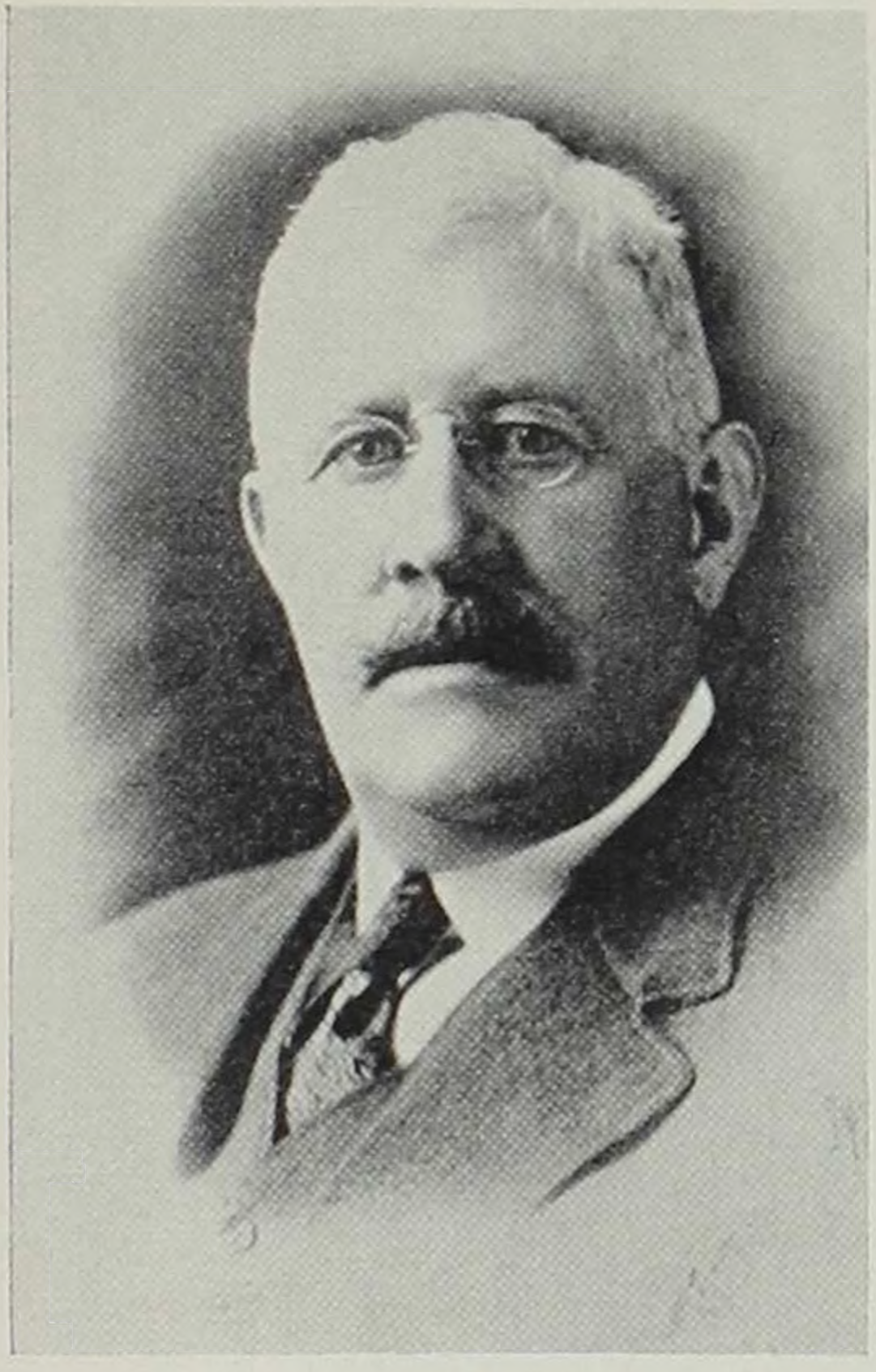
WILLIAM D. BOYCE Founder of American Scouting