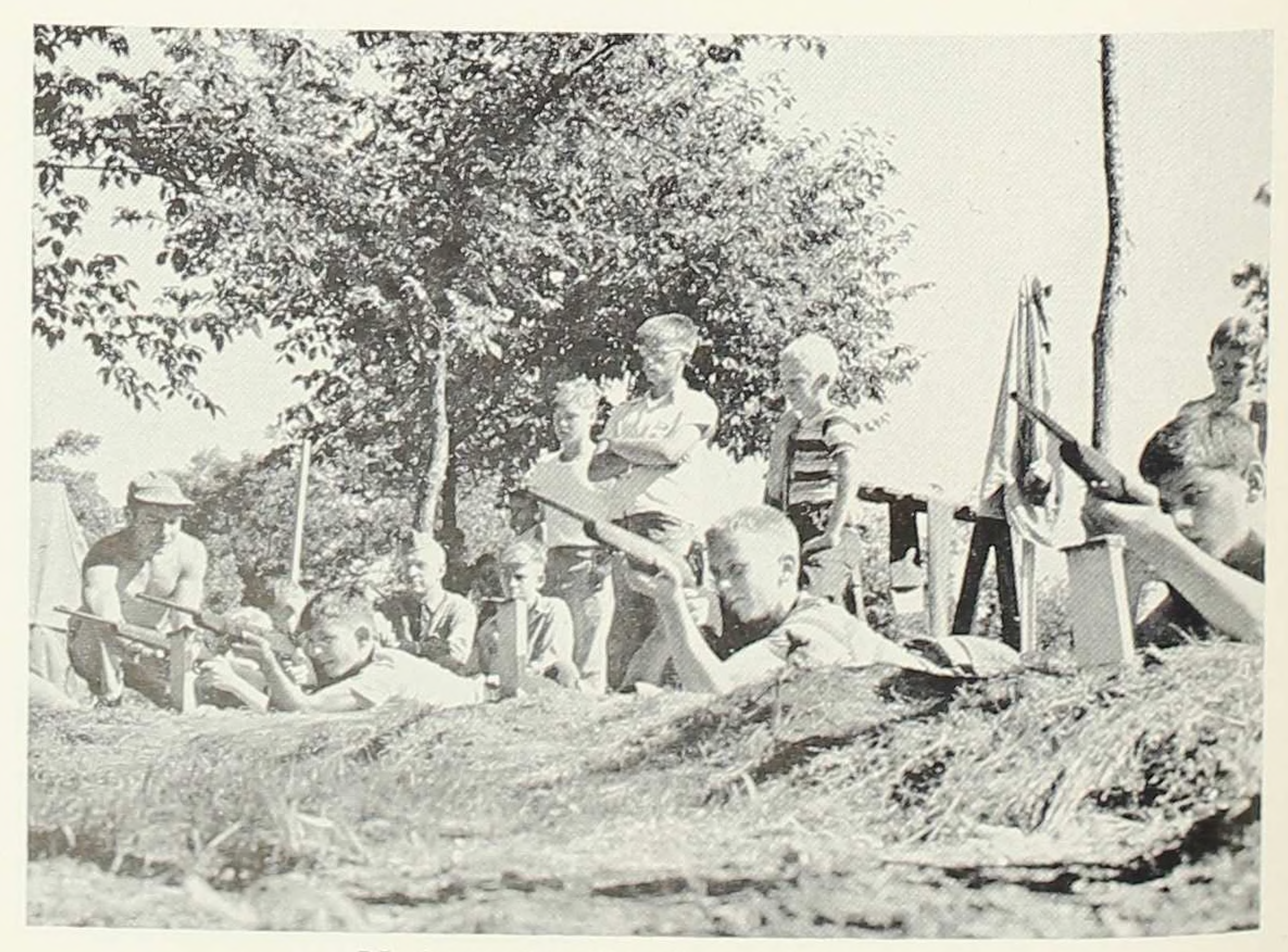
Marksmanship Practice at Ingawanis