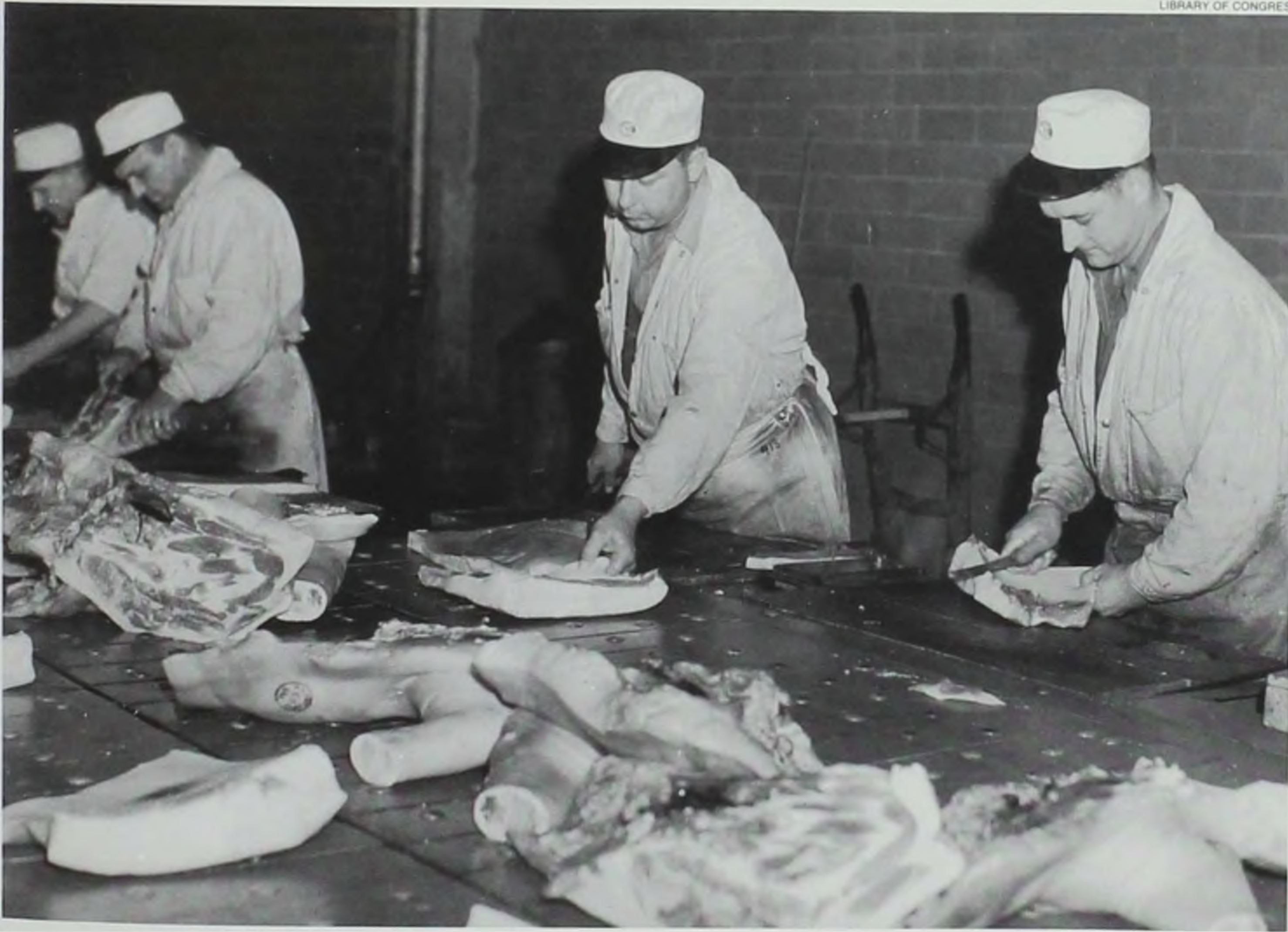
Meat cutting requires a steady pace and a sure hand. Wilson employees, like these at an unidentified packinghouse, balanced skill and speed.

packinghouses as military orders strained the industry's capacity, the Lend-Lease Act sent American foodstuffs abroad, and the draft pulled in most eligible men. Arguments over job categories and how to fill them took an important place on the agenda of labor-management relations during the war.