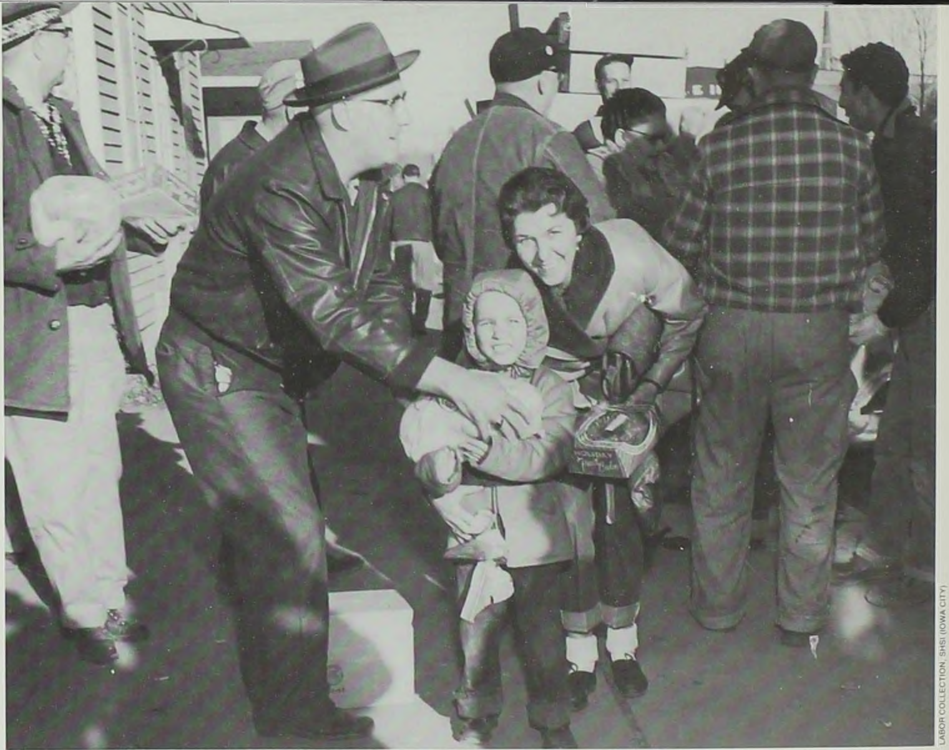
LABOR COLLECTION, SHSI (IOWA CITY)

As a community service, local P3 members distribute holiday turkeys and fruitcakes. (Date of photo unknown)