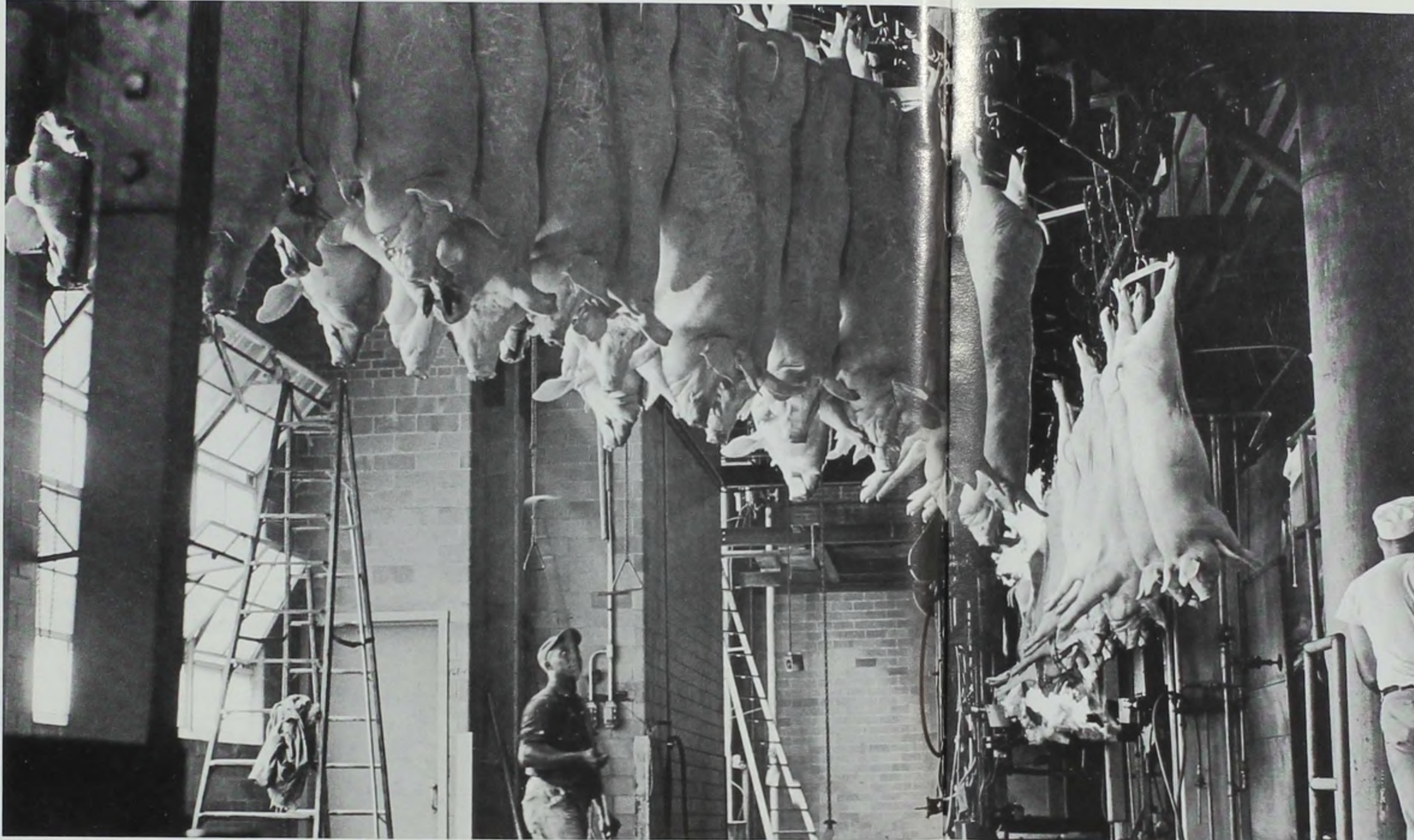
Hog carcasses move on a chain above Waterloo workers on the killing floor in 1948 at Rath, another Iowa packinghouse.

ing workers to the new organization in the early 1930s.