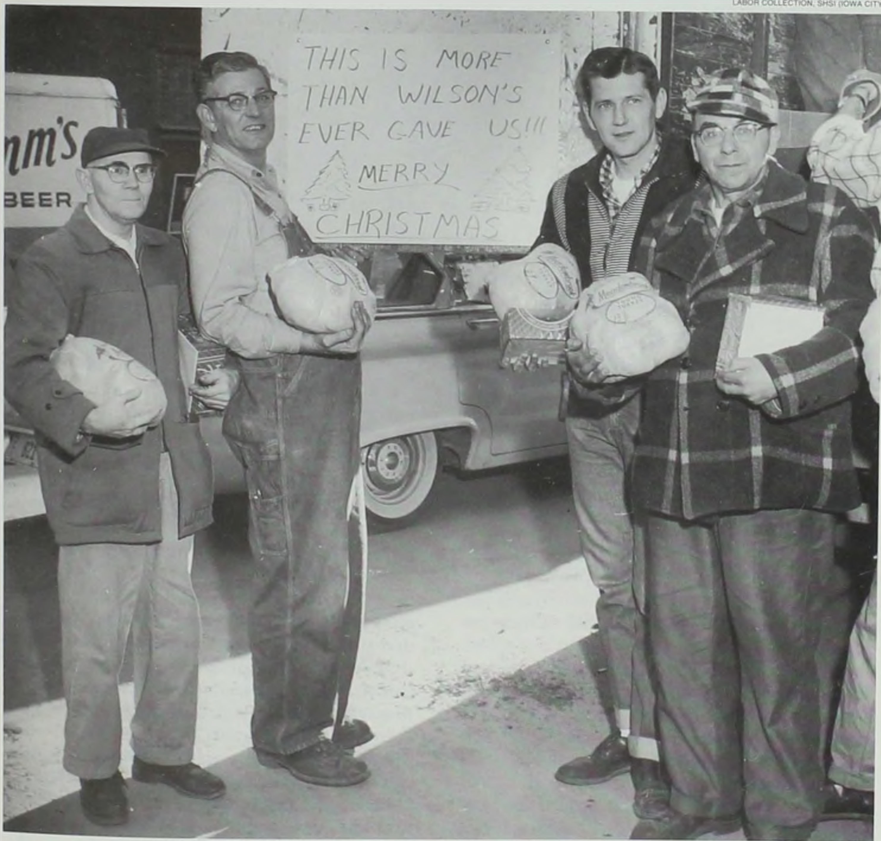
Holiday sign reminds passersby that turkey and fruitcake were "more than Wilson's ever gave us." (Circa 1950s)