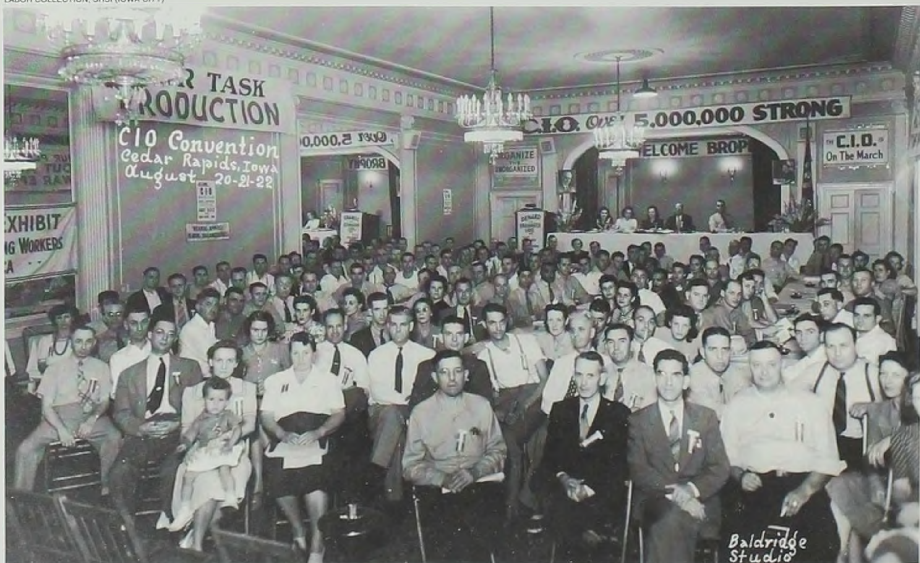
Under the banner “C.I.O. Over 5,000,000 Strong,” Iowa union members attend CIO convention, Cedar Rapids, August 1942.