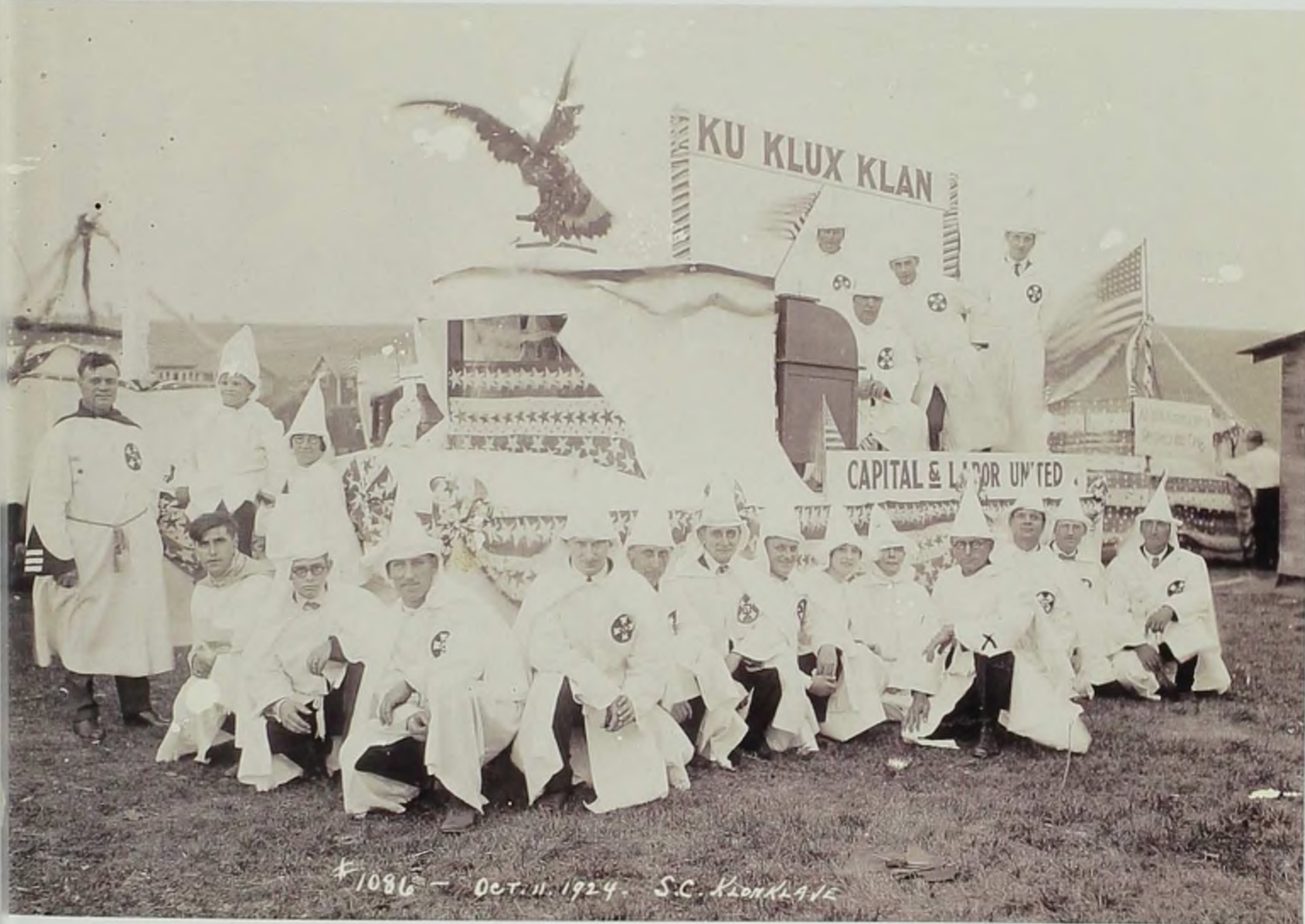
Above: Klan members pose proudly with float in Sioux City, October 11, 1924. Opposite: Poster (circa 1925) for the Klan's Labor Day celebration in Creston promises the "Largest Firey Cross Ever Seen in Iowa" and "an added, mysterious feature" at 10:30 p.m. "No American should miss this two hours of ENTERTAINMENT." The Klan often used carnival-type events, baseball games, bands, and parades to attract the public and draw huge crowds.