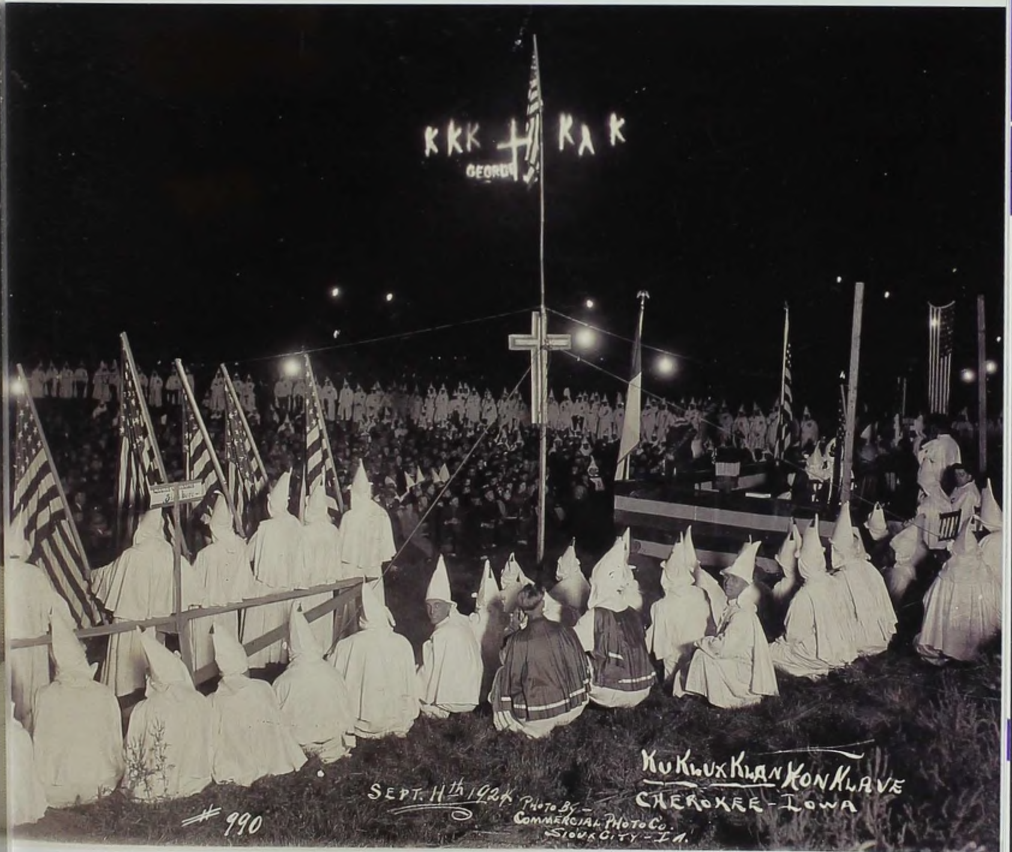
Above: Robed Klansmen ring the audience at a 1924 rally in Cherokee. Klan speakers used patriotic rhetoric and local issues to fire up support among midwesterners, who saw their traditional way of life threatened by changes in America's power structure. Opposite: Fireworks and cash prizes also helped attract the public to a rally in Fontanelle. □