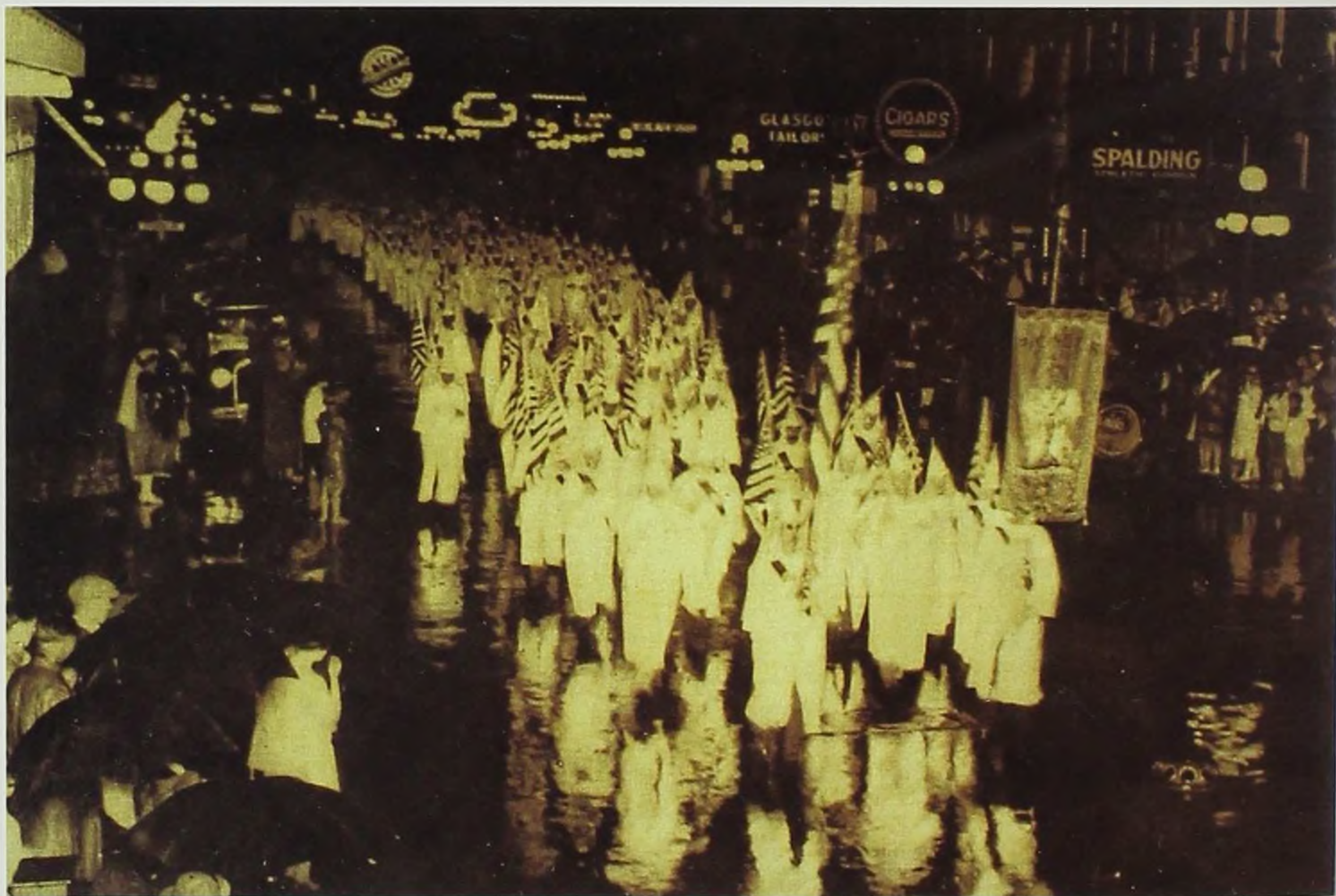
Above: Ku Klux Klanners march in evening rain in Des Moines, June 12, 1926, following a state-wide convention (or "klorero"). The Des Moines Register estimated the parade as "thirty three blocks long" with approximately 3,000 members. Here, the marchers pass Eighth Street on Locust. Opposite: Poster for parade.