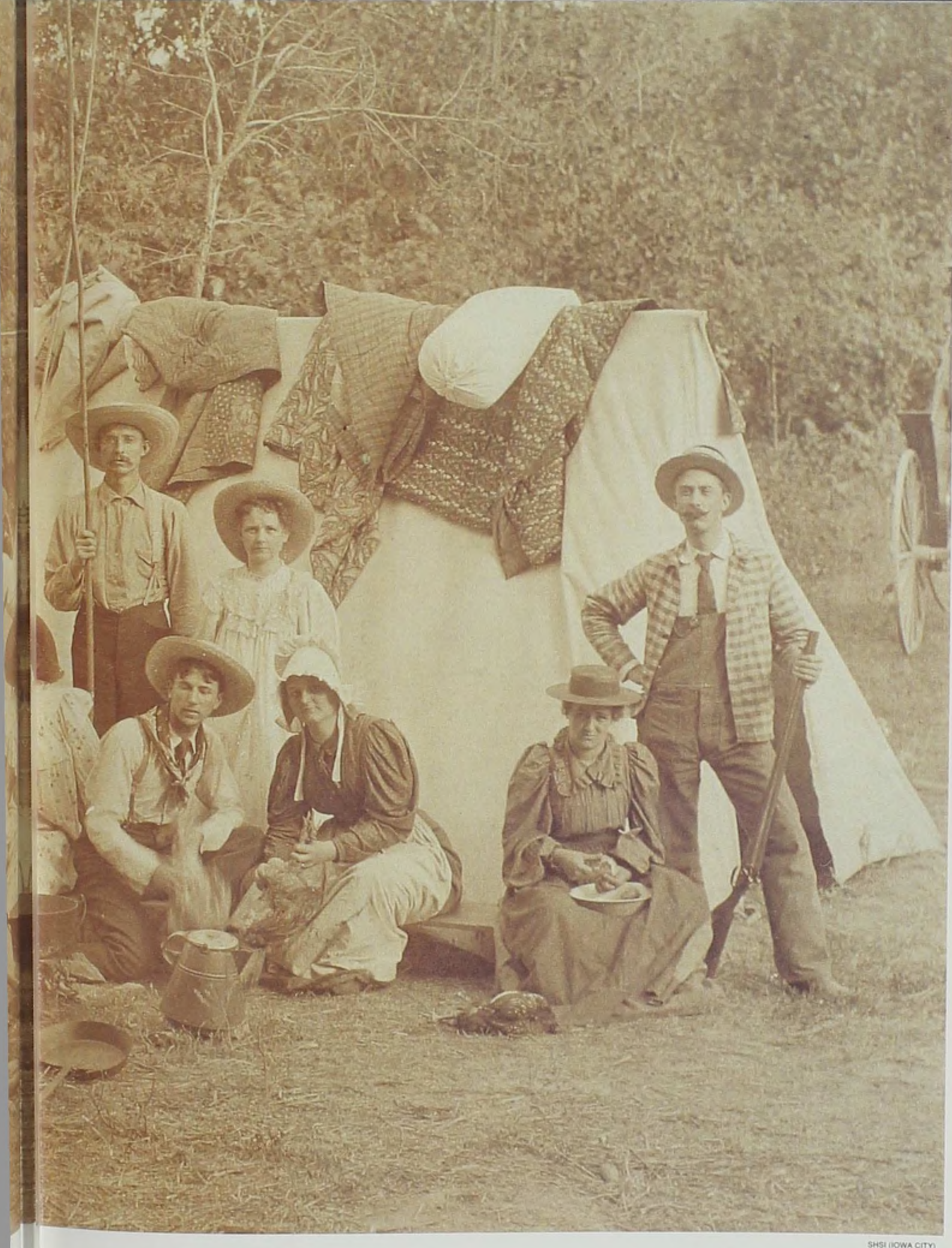
SHSI (IOWA CITY)