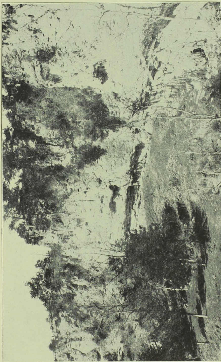
AN ANCIENT ROCK SHELTER THREE MILES EAST OF MONTICELLO, IOWA