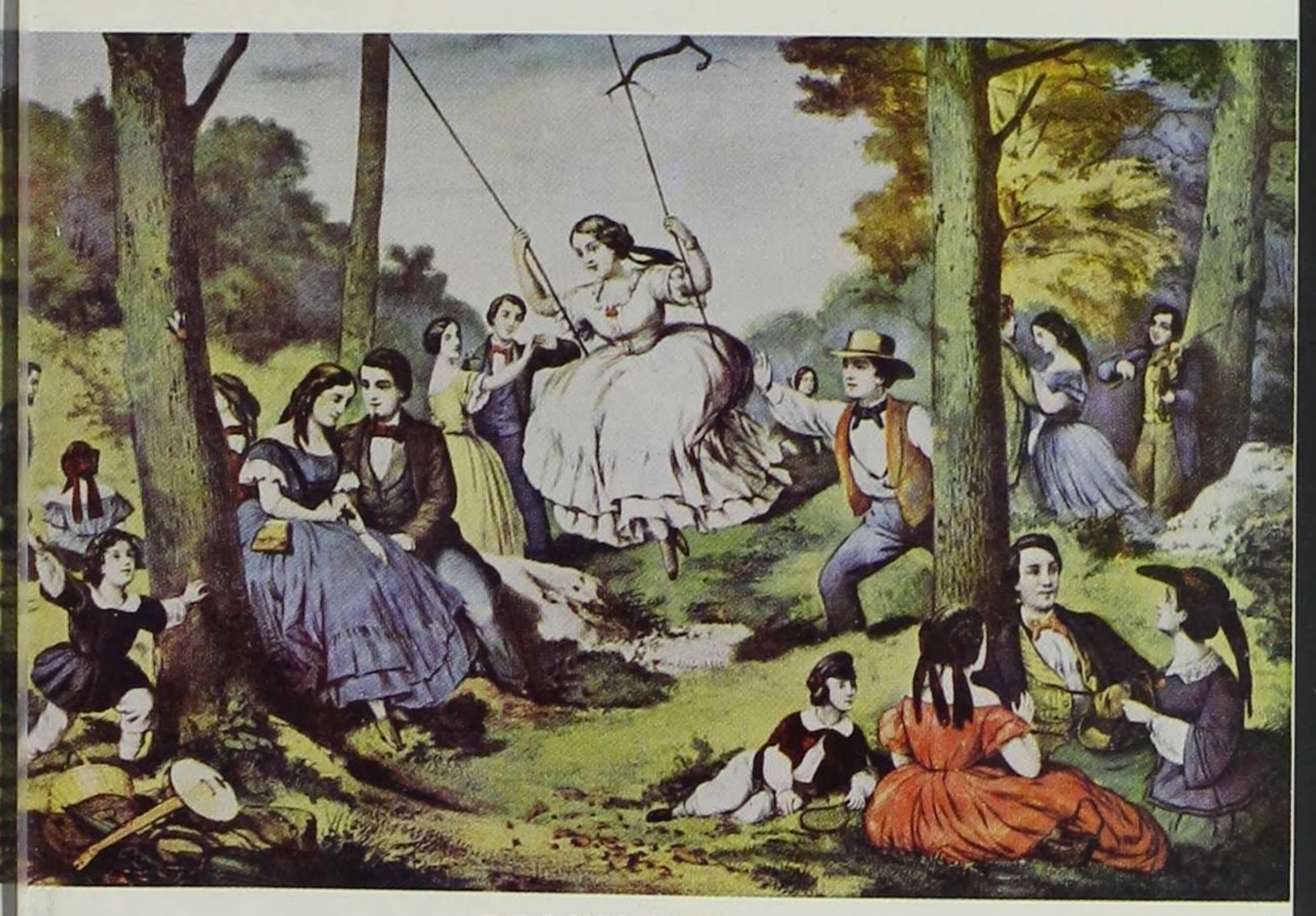
THE PICNIC PARTY