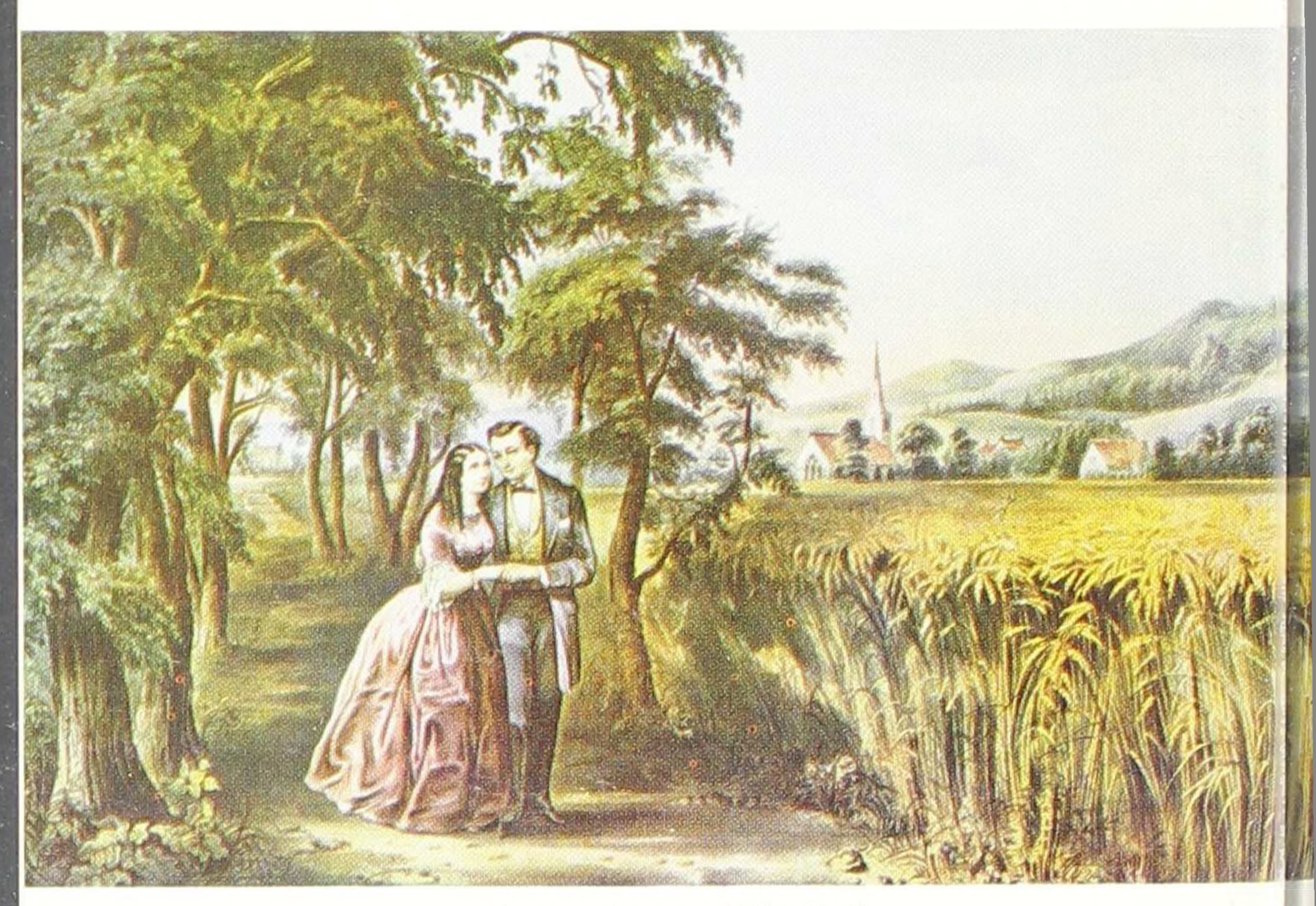
The Four Seasons of Life: Youth