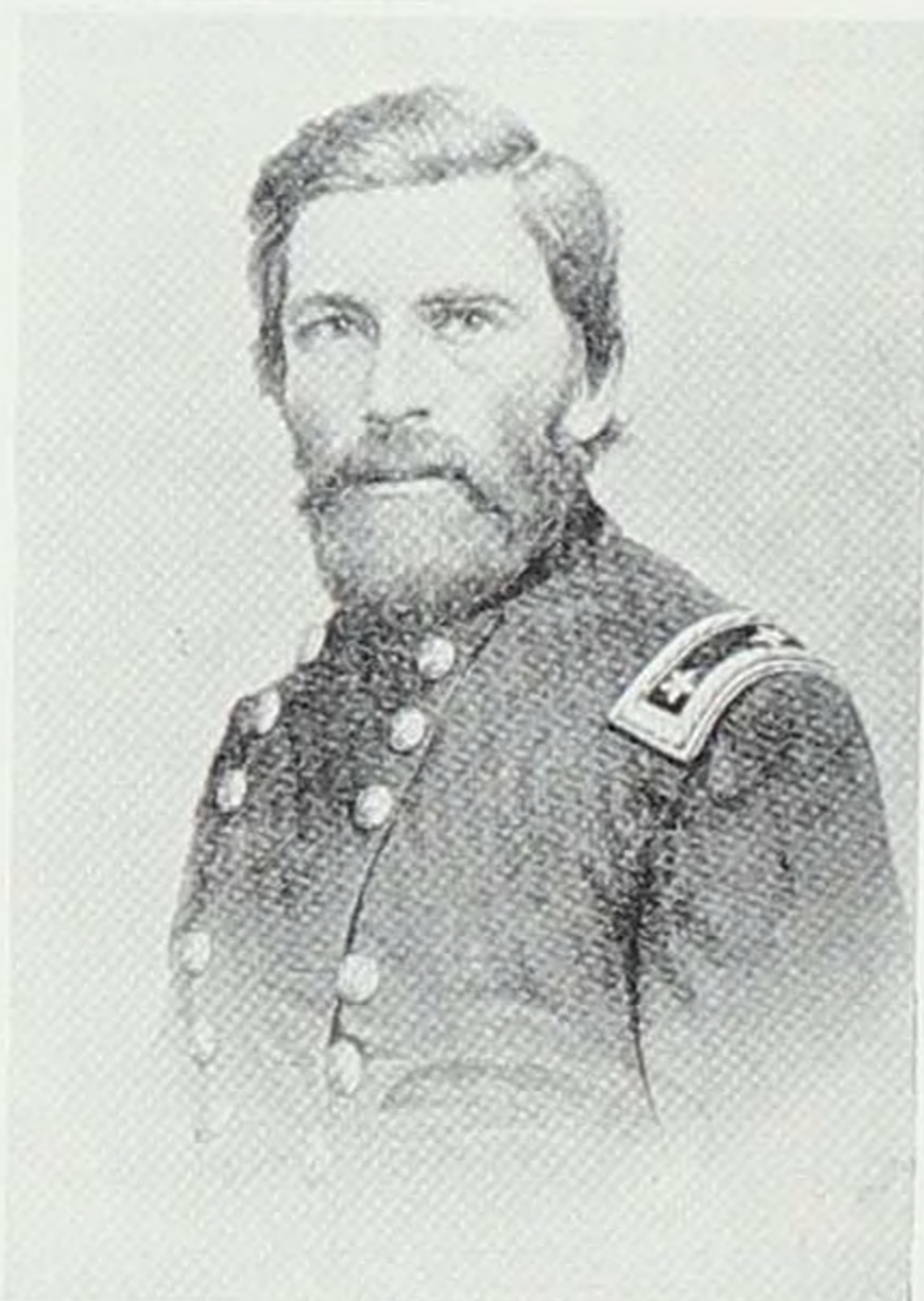
GRENVILLE M. DODGE