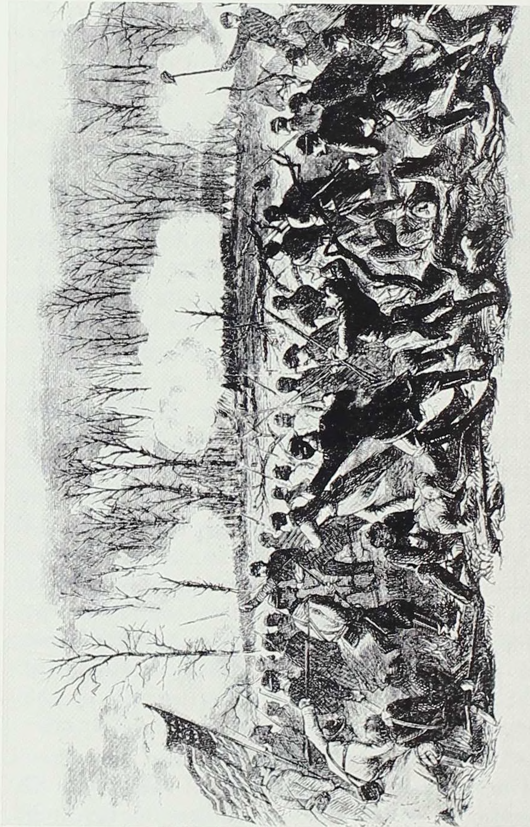
Harper's Weekly , March 15, 1862. Attack of Second Iowa on Batteries of Fort Donelson