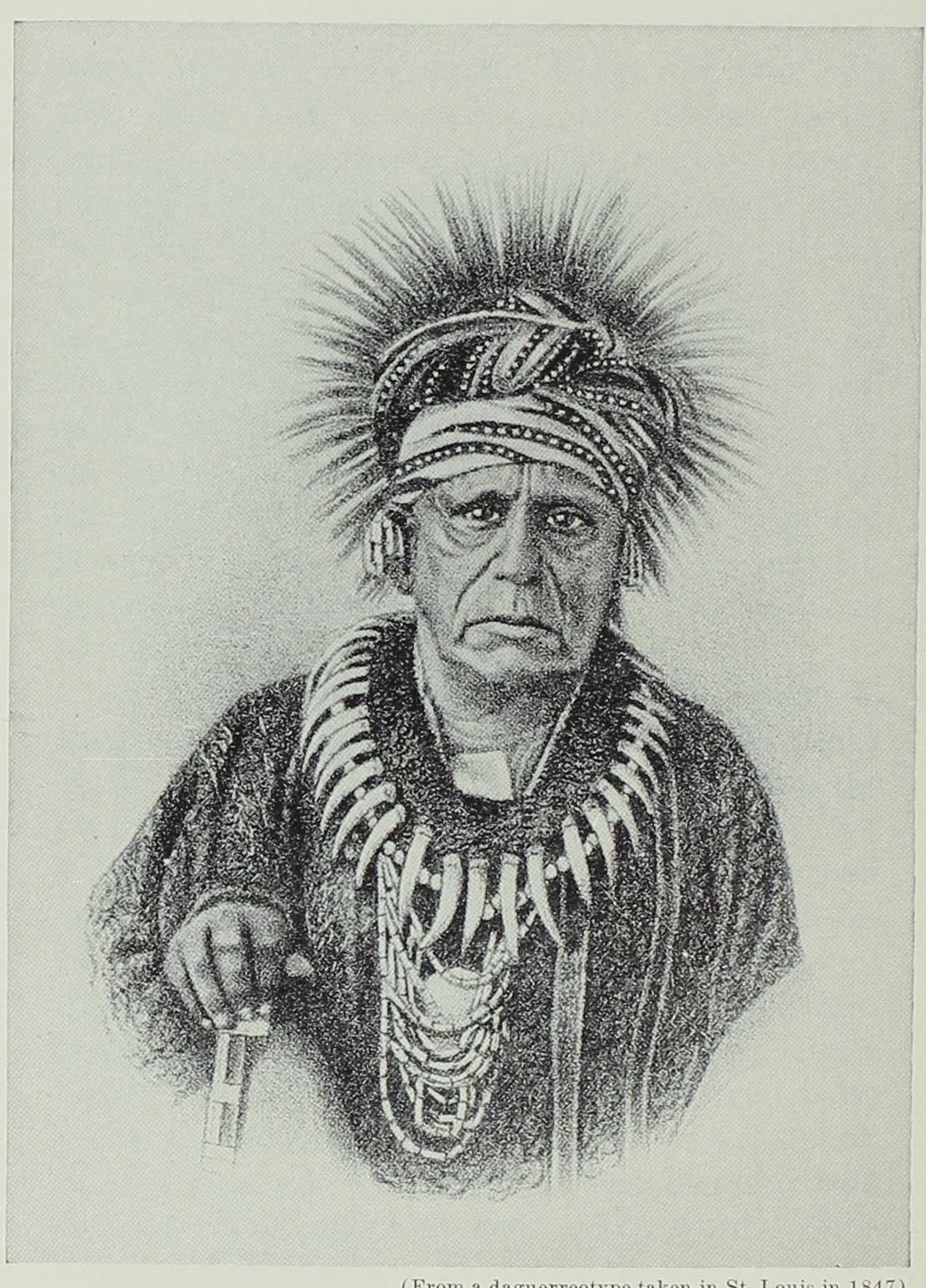
(From a daguerreotype taken in St. Louis in 1847) Keokuk