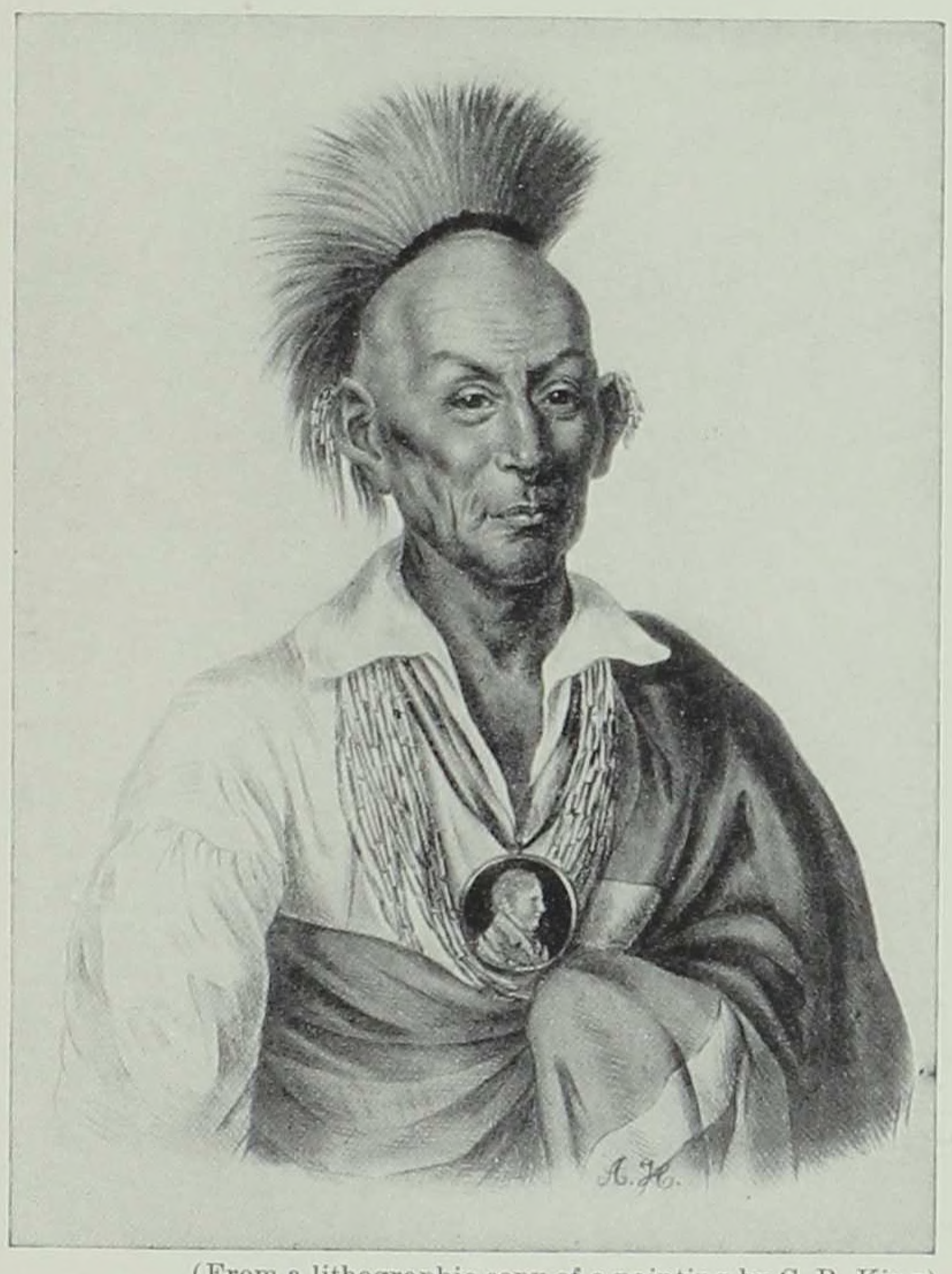
(From a lithographic copy of a painting by C. B. King) Blackhawk