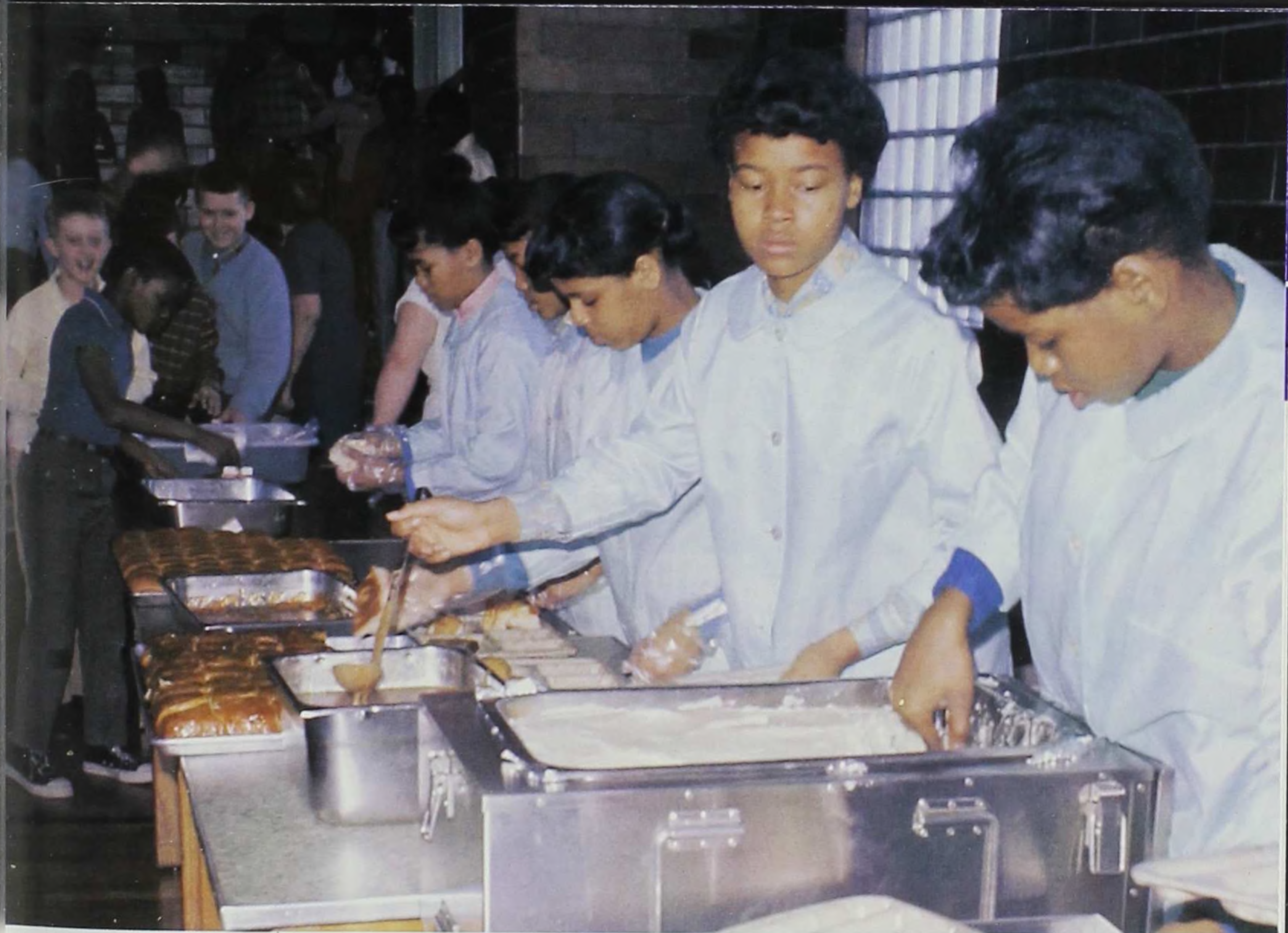
Students help serve food at Longfellow Elementary School in Waterloo, about 1970. Hot food in bulk was transported to the school in heated cases, and cold food in chilled cases with ice packs.