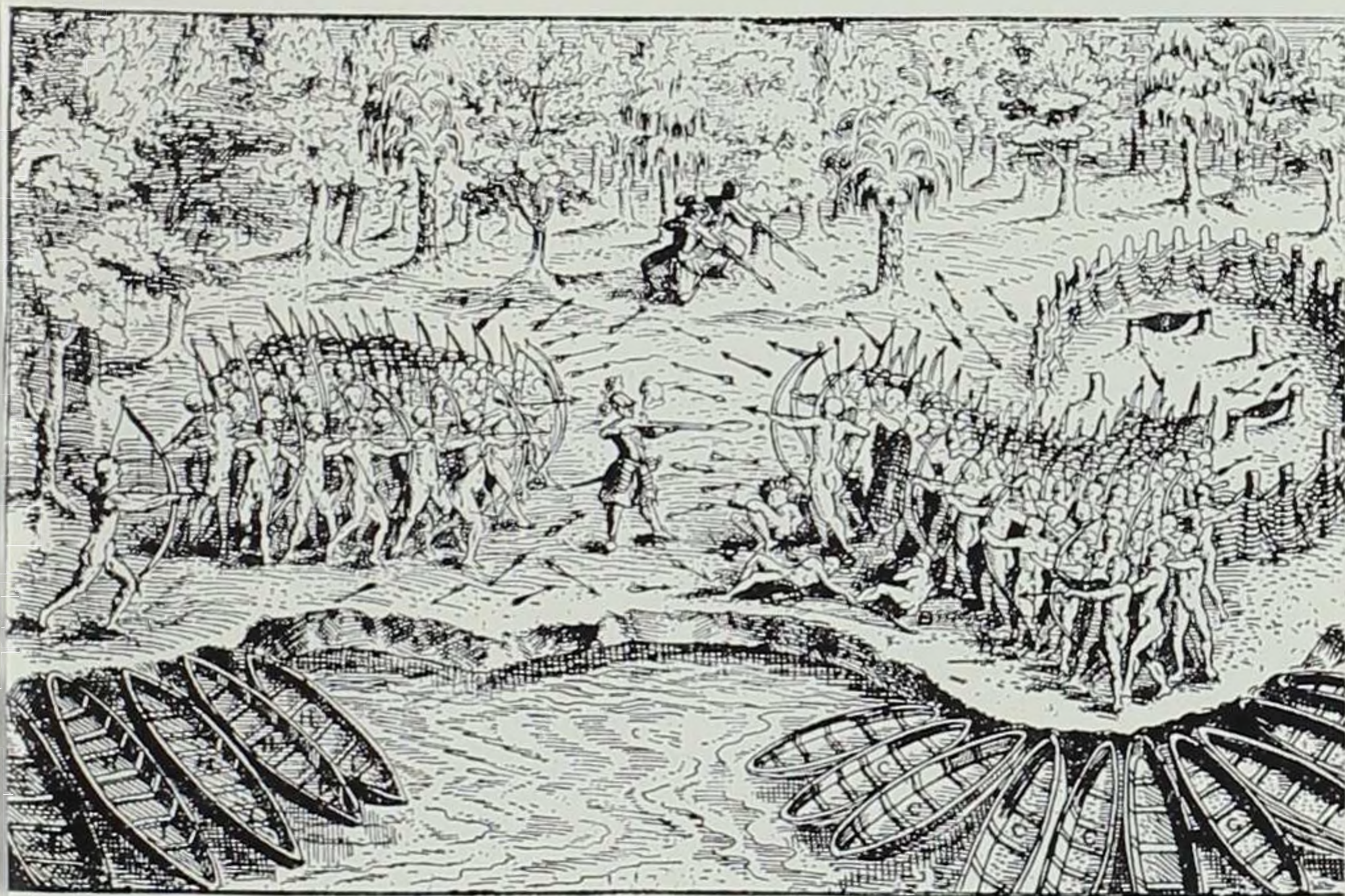
From Justin Winsor's Cartier to Frontenac Champlain's fight with the Iroquois near Ticonderoga

first discharge, killing two on the spot. When our Indians saw this they roared so loudly that you could not have heard it thunder. Then arrows flew like hail on both sides. But when my companions [white] fired from the woods the Iroquois, seeing their chief killed, turned tail and fled.