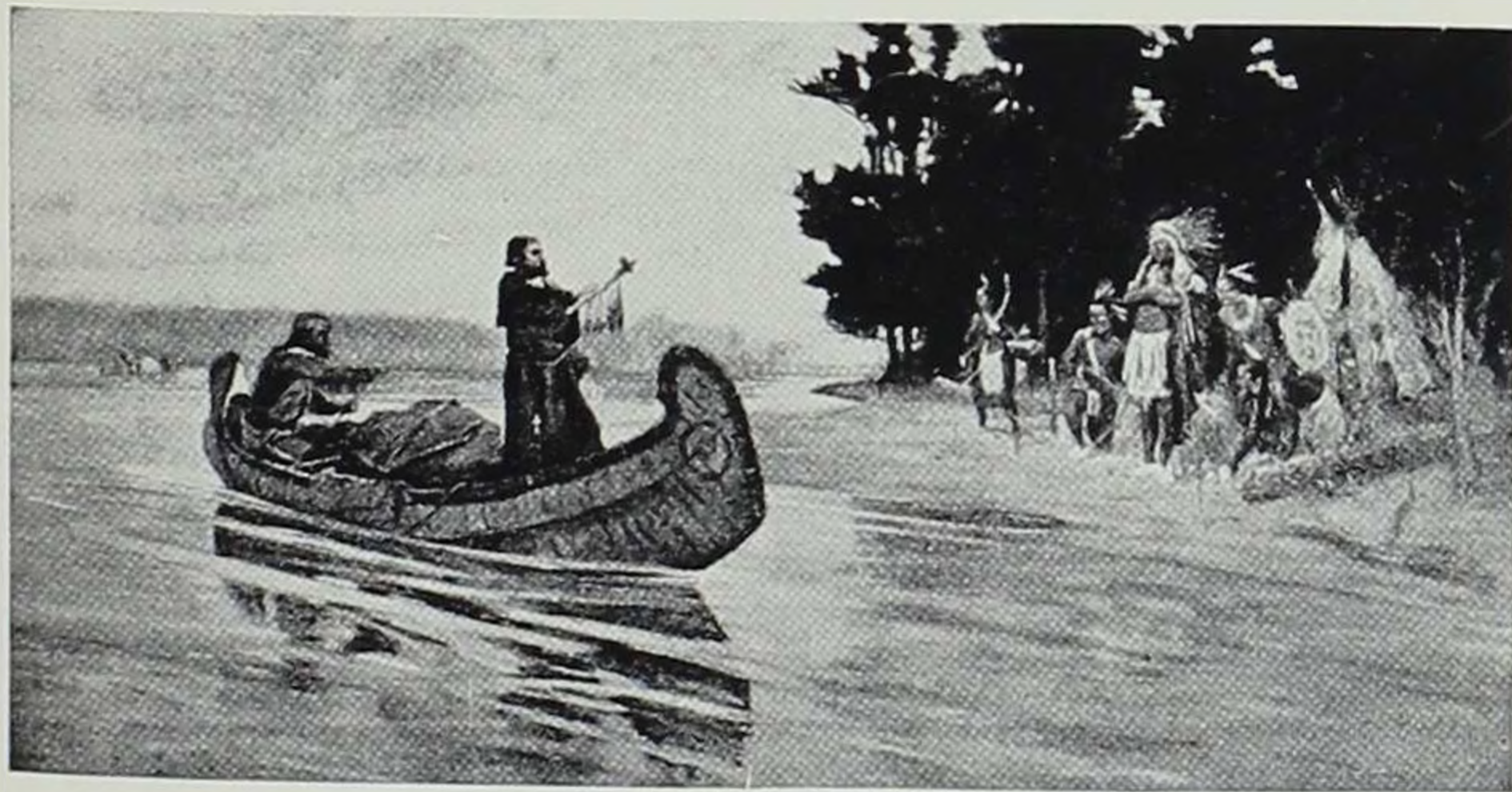
Joliet and Marquette Descending the Mississippi