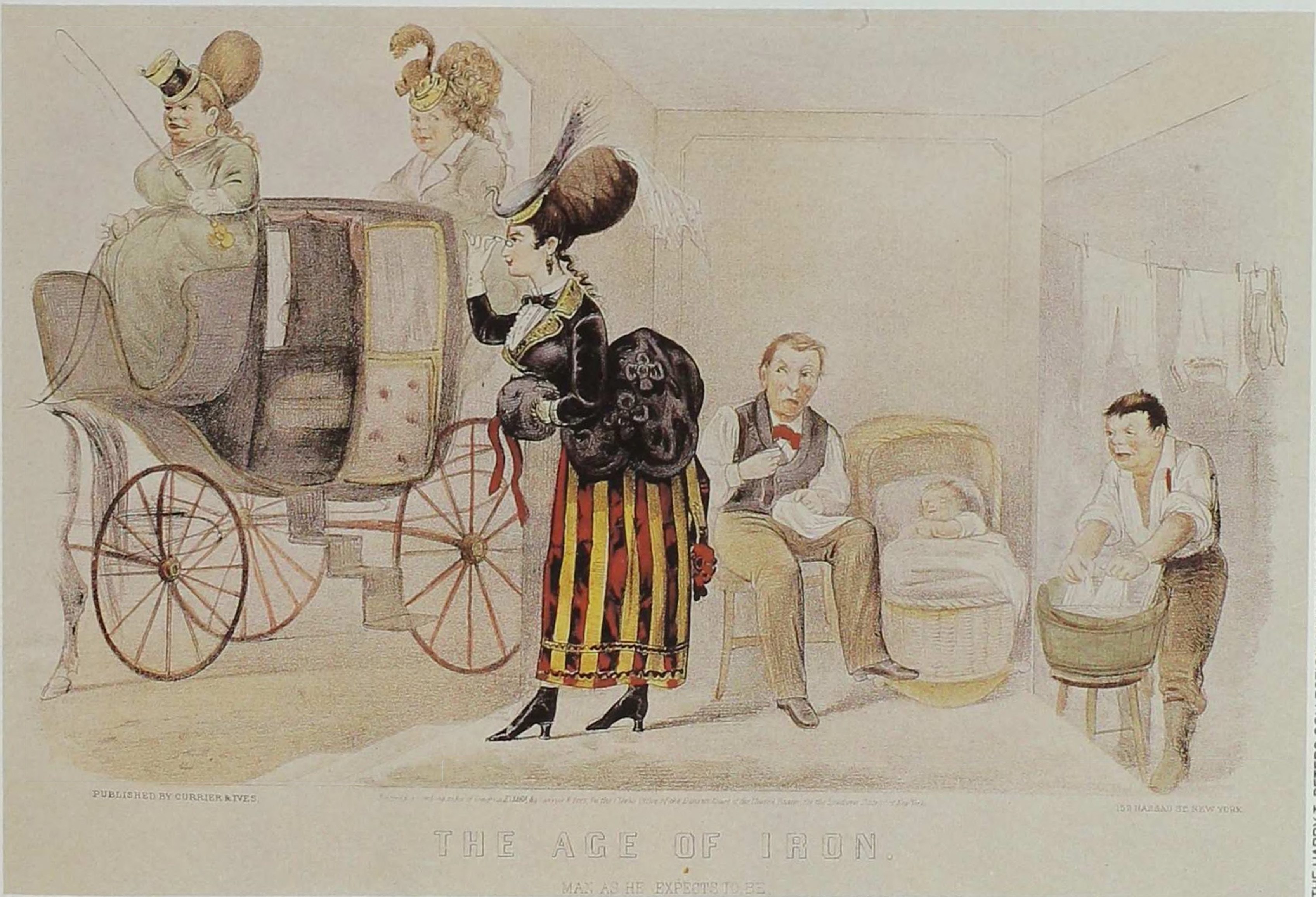
"THE AGE OF IRON: MAN AS HE EXPECTS TO BE." A Currier and Ives lithograph from 1869 spells out a common fear that women — given the vote — would abandon the "woman's sphere" and its domestic duties of home and children.

selves "feminists." Whatever their labels or their causes, the women of the twentieth century and beyond owe something to those rather "unladylike" females, many of them Iowans, who dared to break out of their traditional sphere in the early 1870s. They may not have been immediately successful. Those who left their home chores to lobby lawmakers or make speeches one month most likely were back home the next. But, with the help of the Iowa press, they made some headlines. And if they didn't exactly break the woman's sphere wide open, they at least made a crack or two in it. □