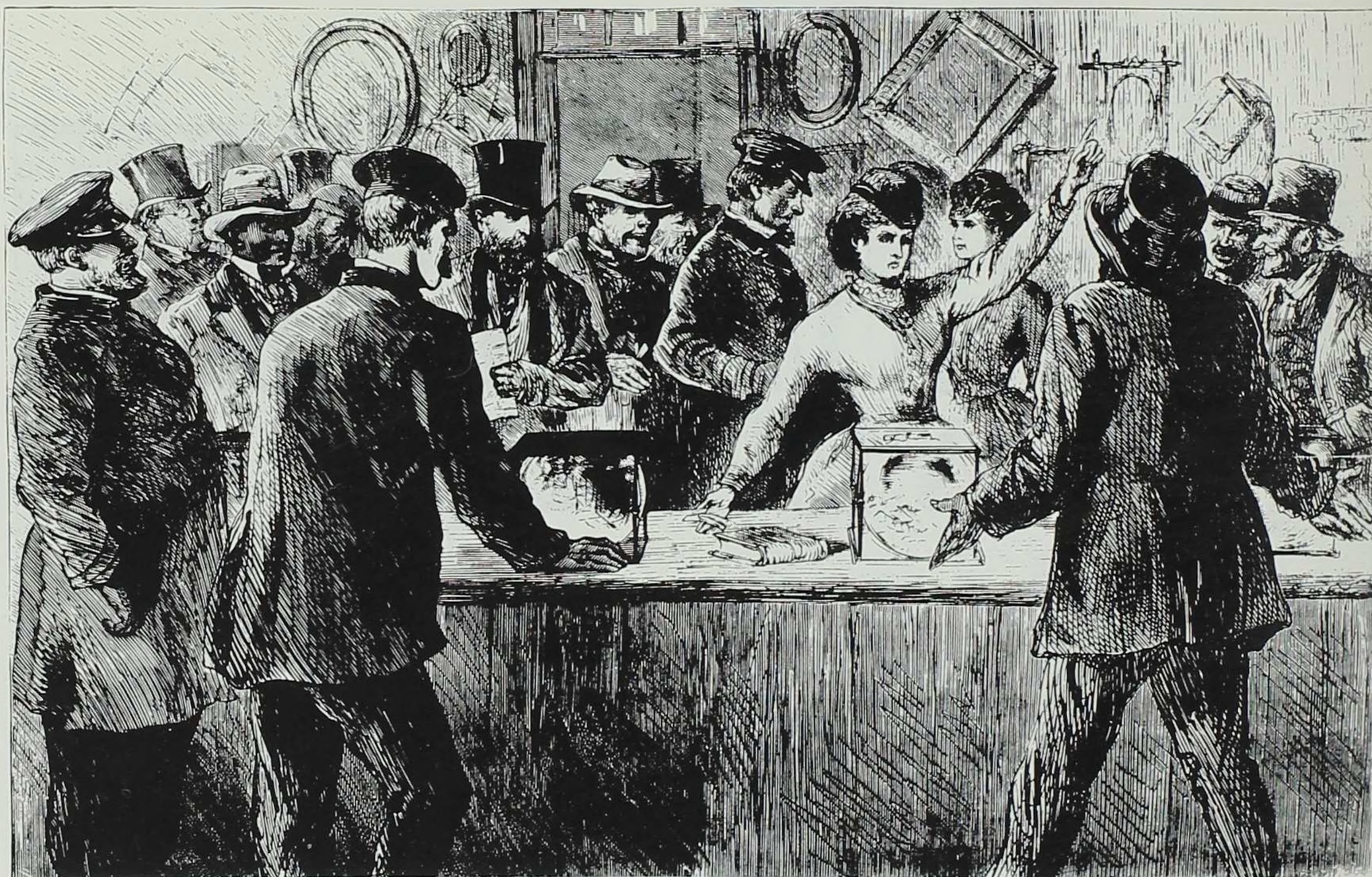
FRANK LESLIE'S ILLUSTRATED NEWSPAPER (NOVEMBER 25, 1871)