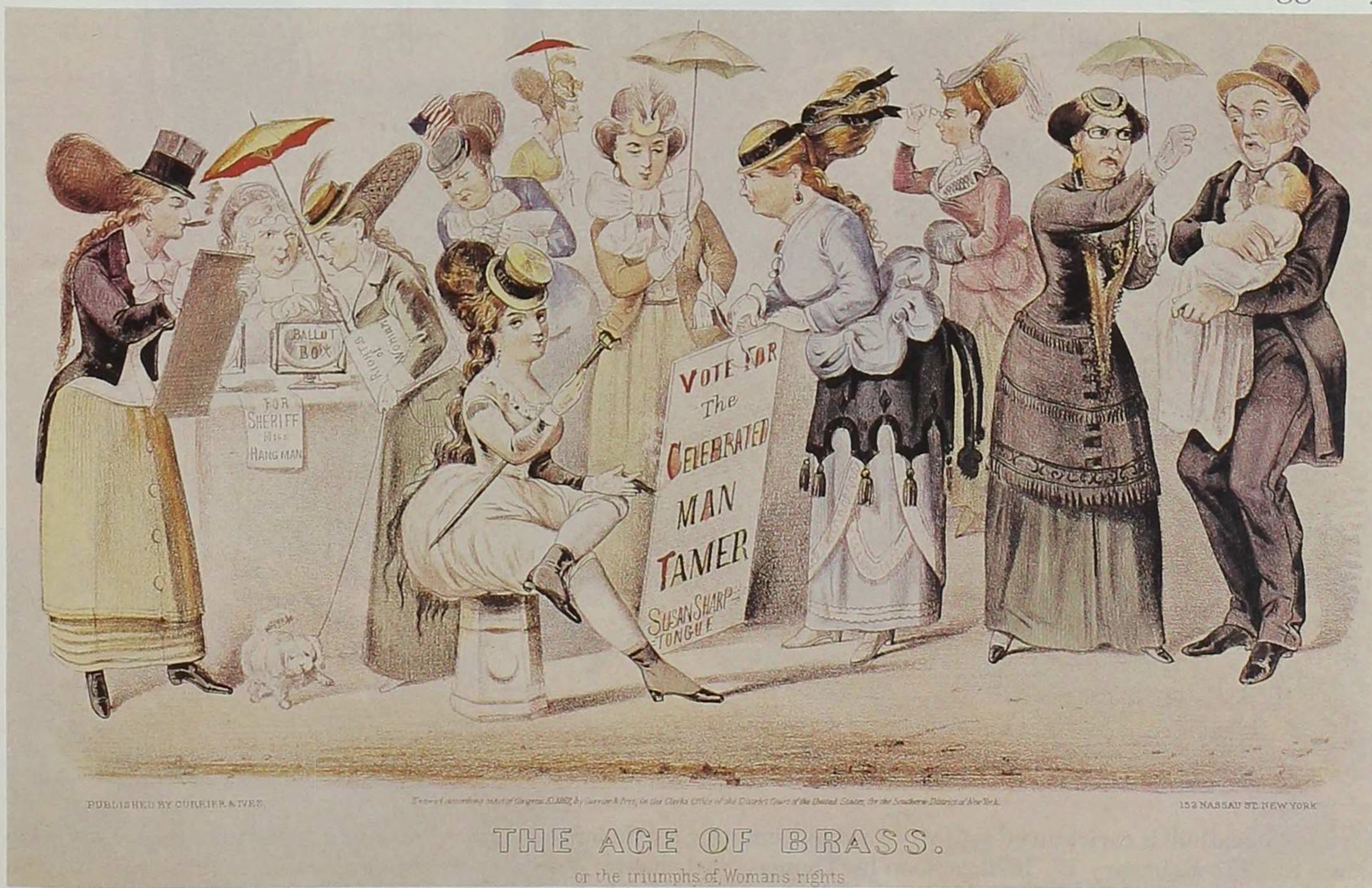
THE HARRY T. PETERS COLLECTION, MUSEUM OF THE CITY OF NEW YORK