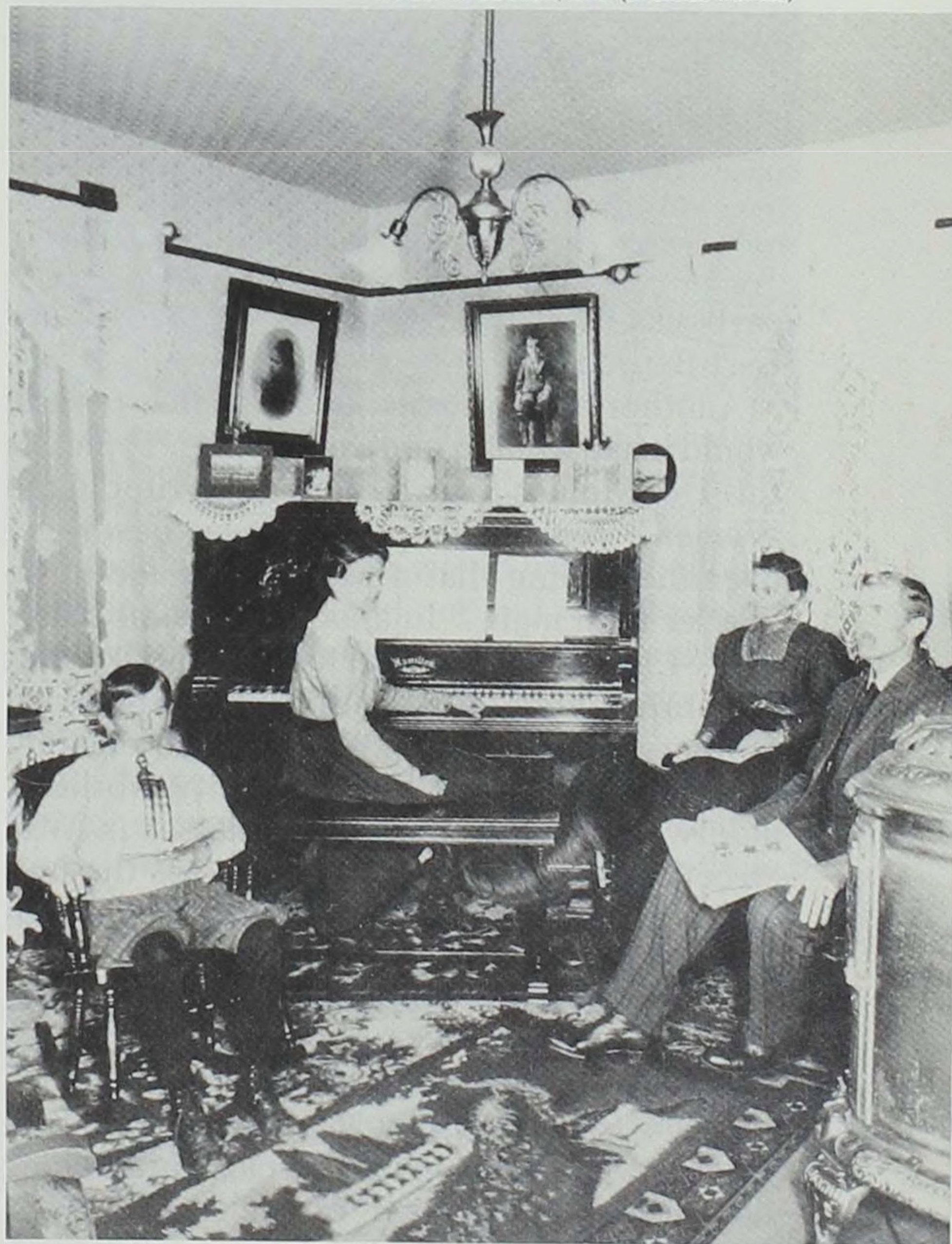
PARLOR IN CLARION, IOWA

"A neat, clean, fresh-aired, sweet, cheerful, well-arranged house exerts a moral influence over its inmates" ( Dubuque Herald ). Anti-suffragists feared that the vote would lead women out of this "woman's sphere" and into the "sordid" world of work and politics.