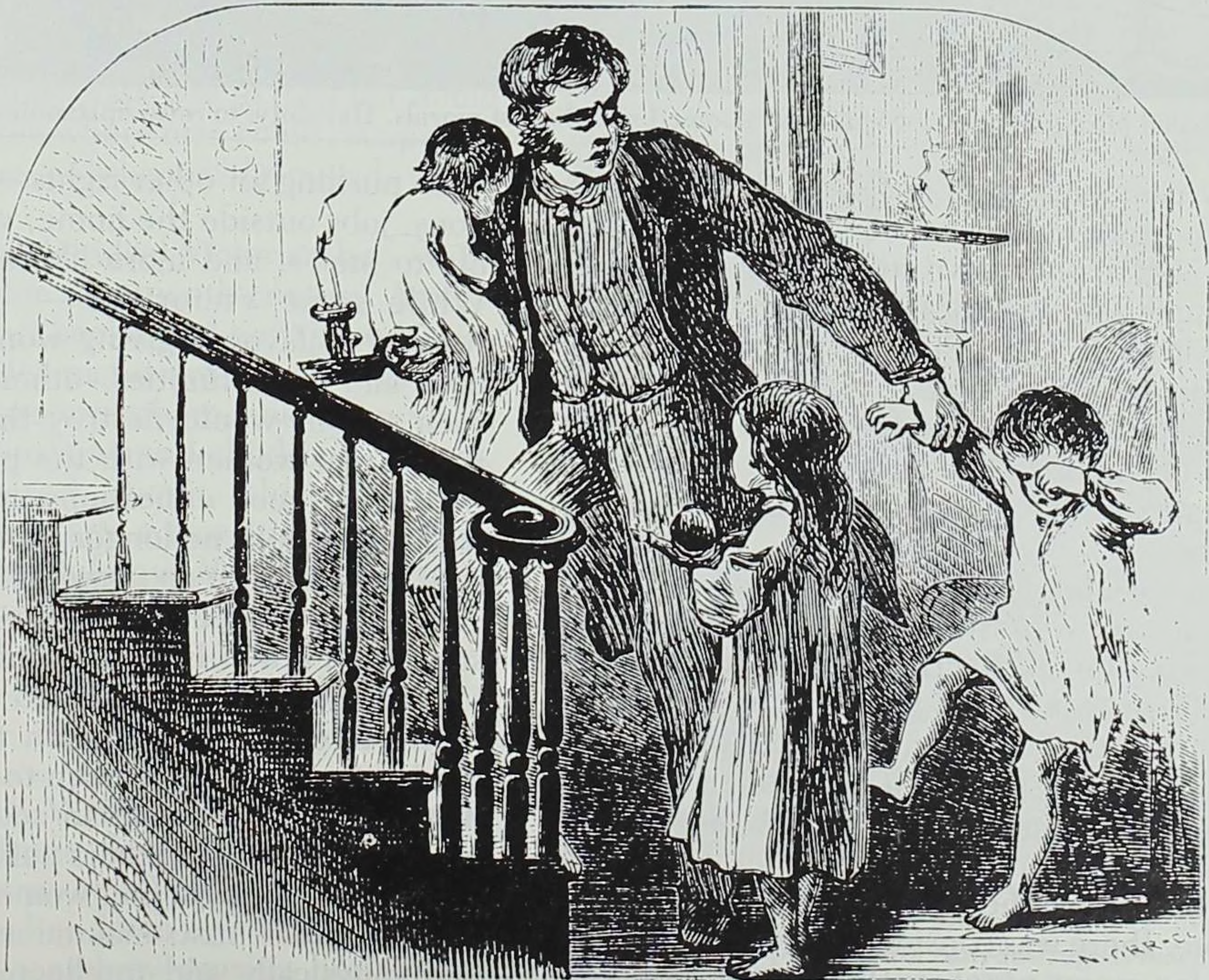
THE FATHER STAYS AT HOME, ATTENDING TO THE CHILDREN.