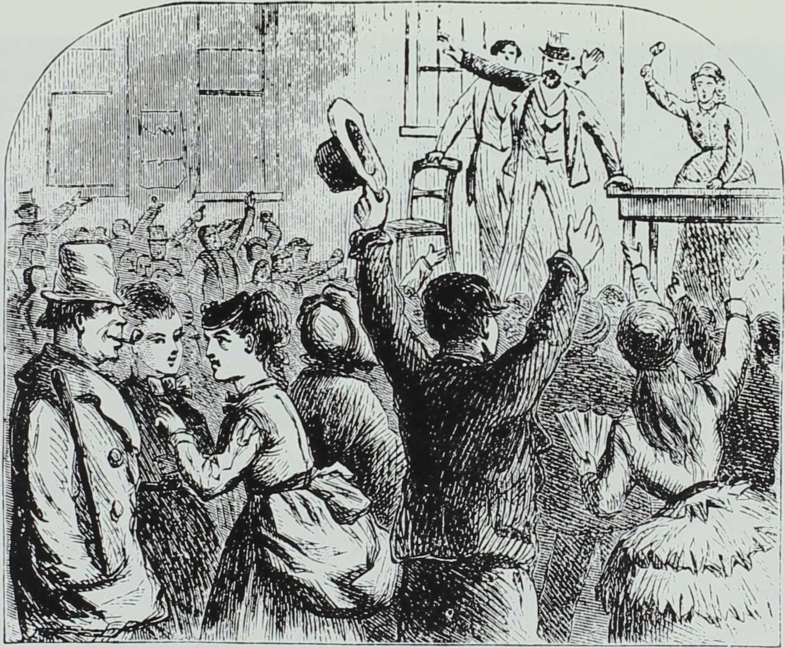
THE WIFE AND MOTHER AT A PRIMARY,