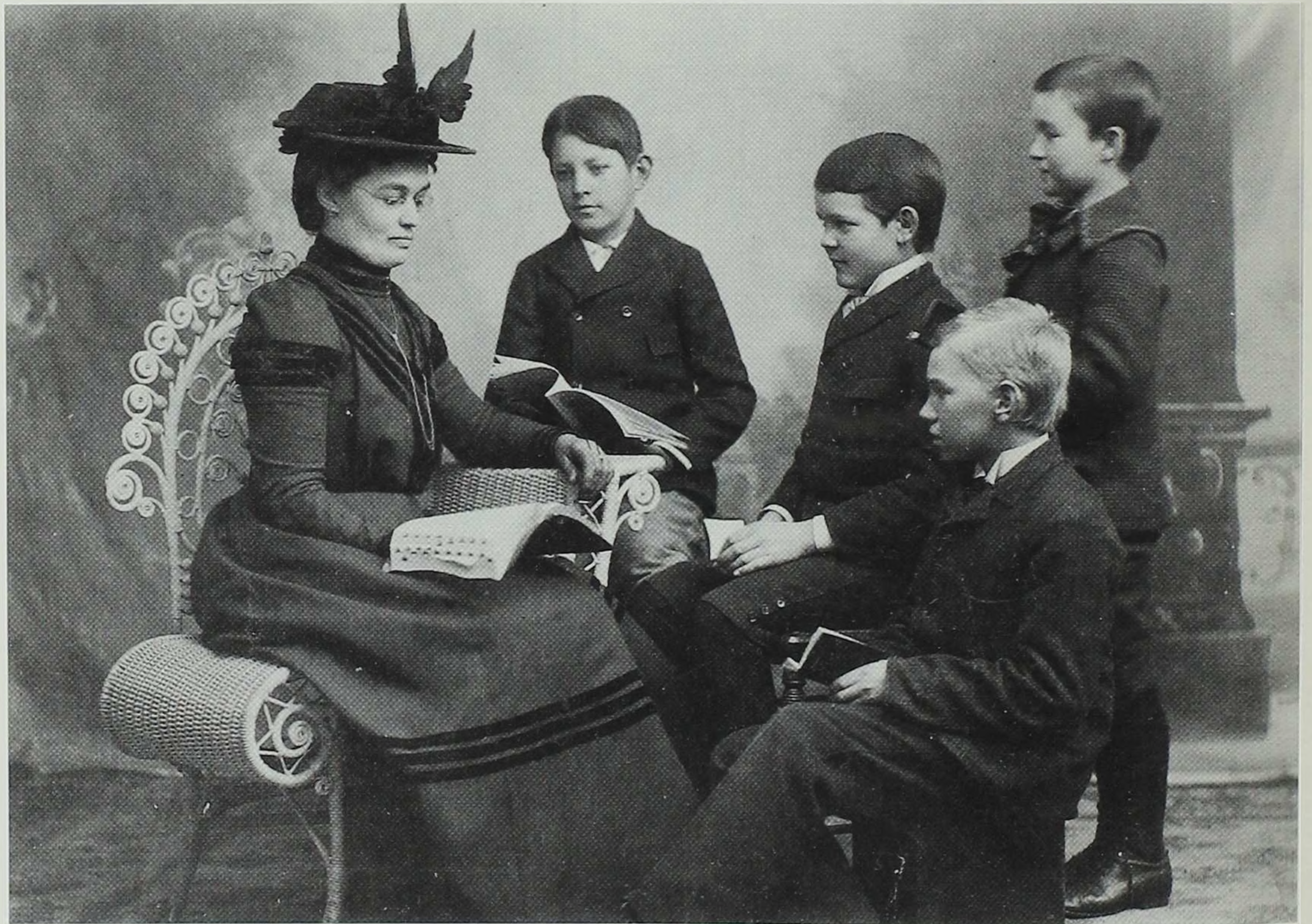
Considered pure and pious, woman was deemed guardian of morals. Her duty: to raise upstanding children.

heavy campaign to persuade both lawmakers and the public that women should have the vote. Nationally known suffragists lent a hand. During the summer of 1871, Susan B. Anthony and Elizabeth Cady Stanton, on a cross-country speaking tour, spent three days in Des Moines. Iowa suffragists hoped to further their cause at the first state convention of the Iowa Woman Suffrage Association in Des Moines in October.