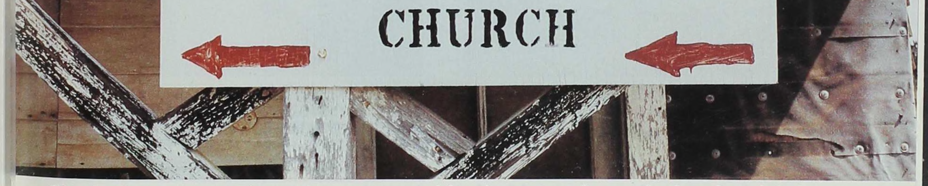
This church sign, from Acadia Parish in Louisiana, exhibits the varying influences that have formed the human landscape of contemporary southwest Louisiana. Migrating Iowans were among those influences. On the sign, the Baptist denomination and surname Miller are not usually associated with Cajuns. The term "French" and the barely visible statement "Jesus est Seigneur" (Jesus is Lord), however, demonstrate a Gallic background.

president of Iowa State College in 1884 and his earlier successes in breeding stock and editing the Western Stock Journal and Farmer . (In 1885 Knapp himself took a leave of absence to establish a rice plantation in Louisiana.)