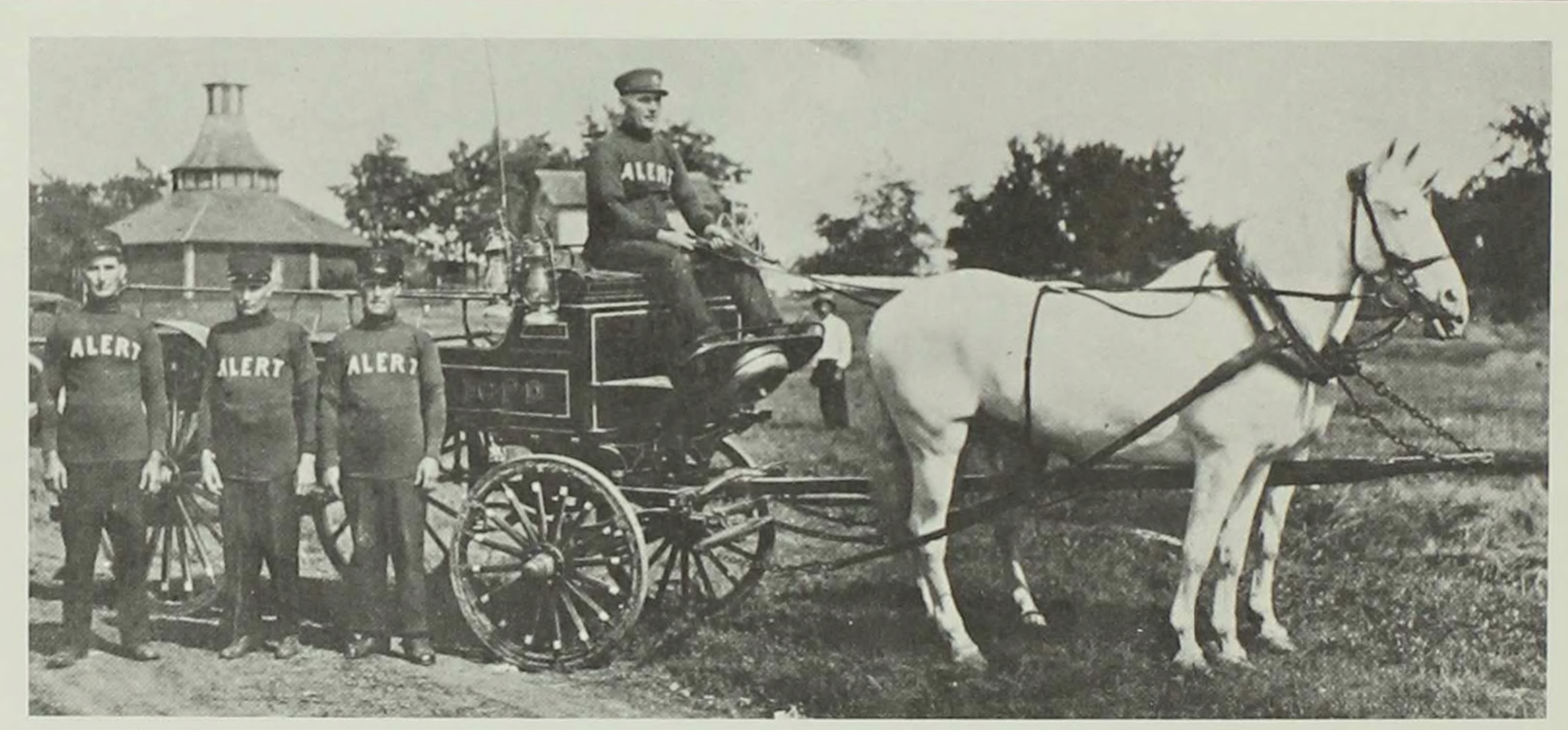
The Alert Fire Company of Iowa City, participants in the tournament of 1897

Democratic leanings, disagreed and supported the firemen. In any event, as a third newspaper reported on June 23, certain facts were clear: