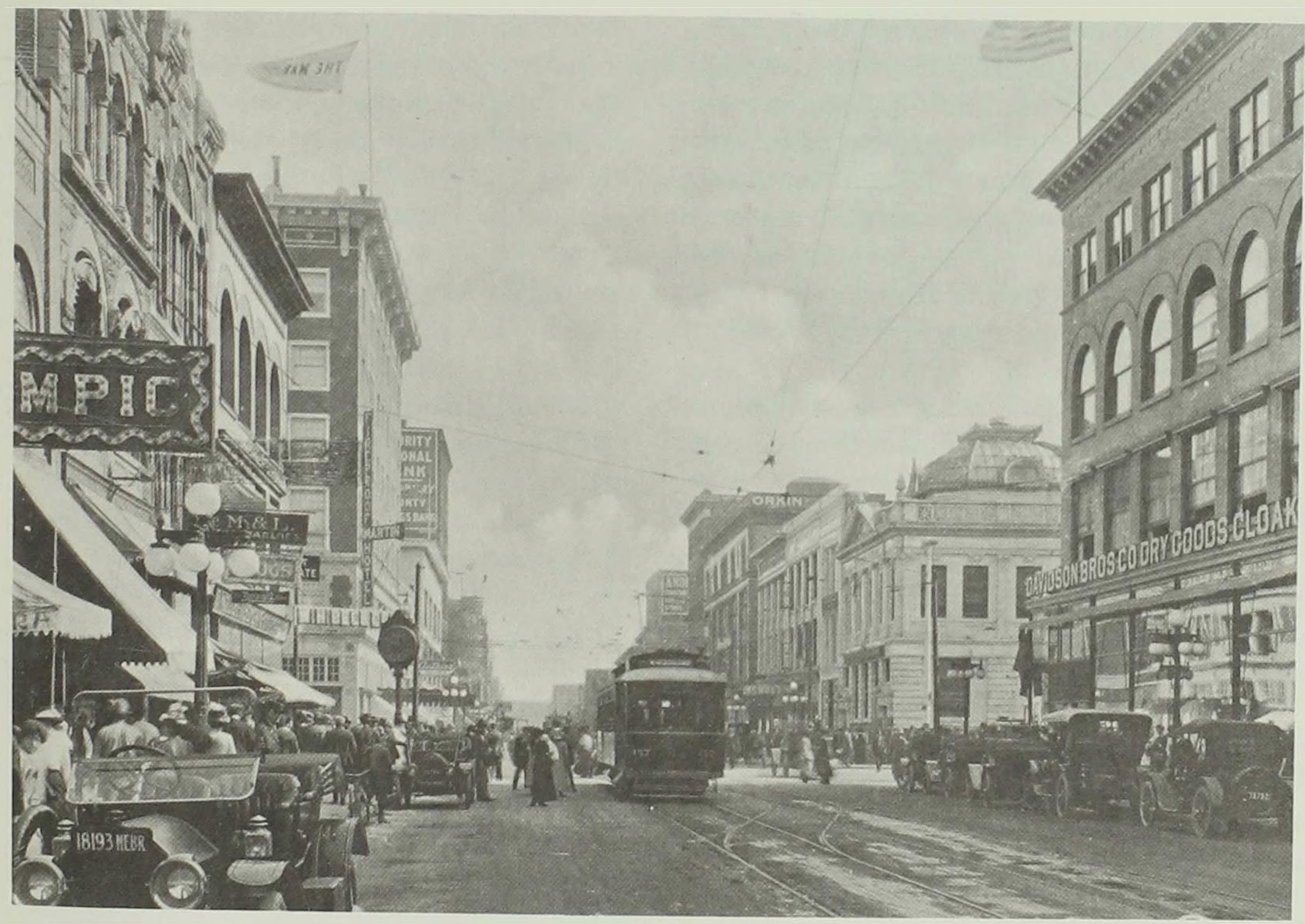
Downtown Sioux City in the 1910s

His counter-charges that the city's fire-traps benefited only their owners did little to counter-balance the insinuations of his enemies.