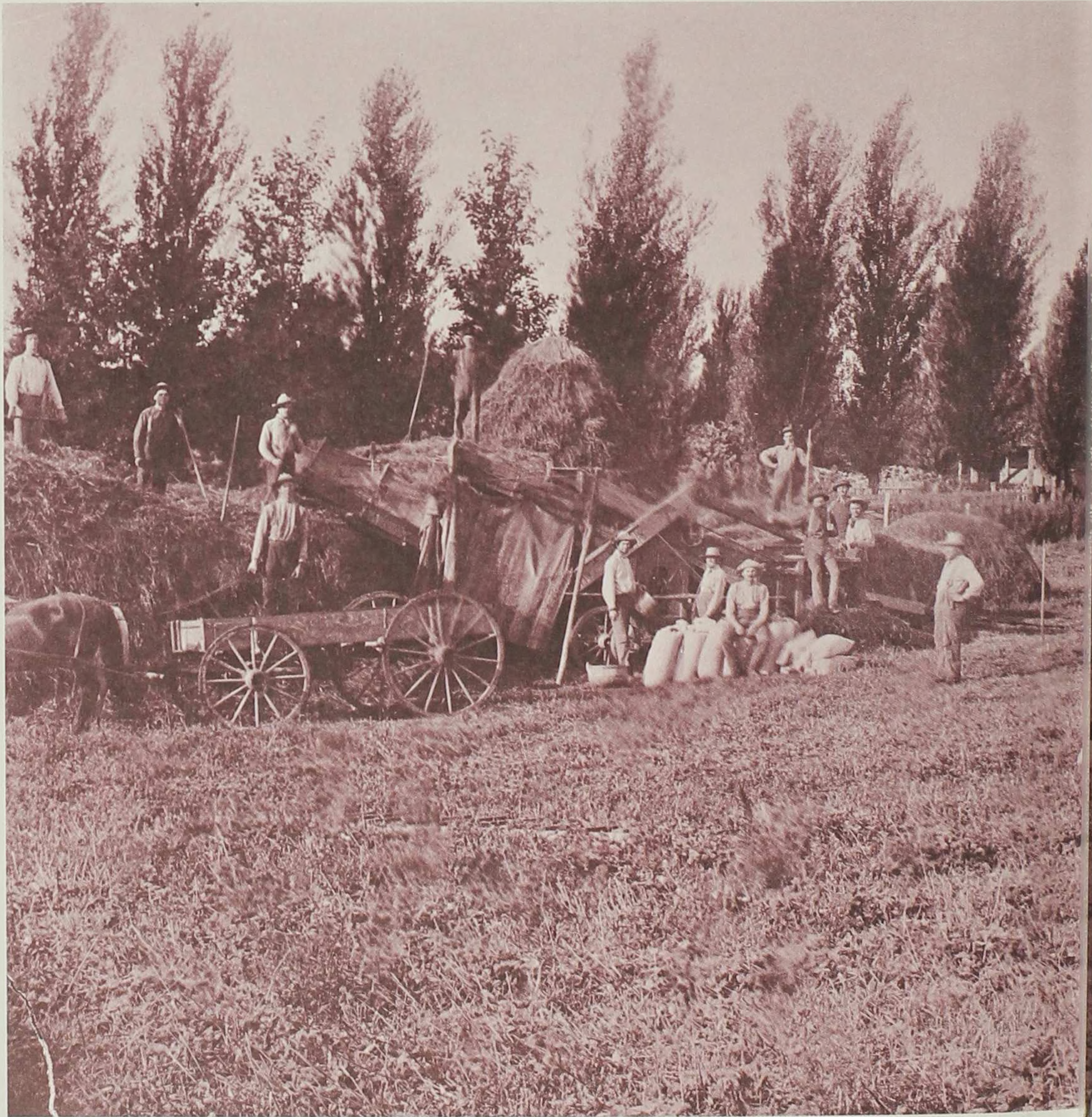
Threshing was an important community activity, during and after the colony days. This scene dates from 1888.