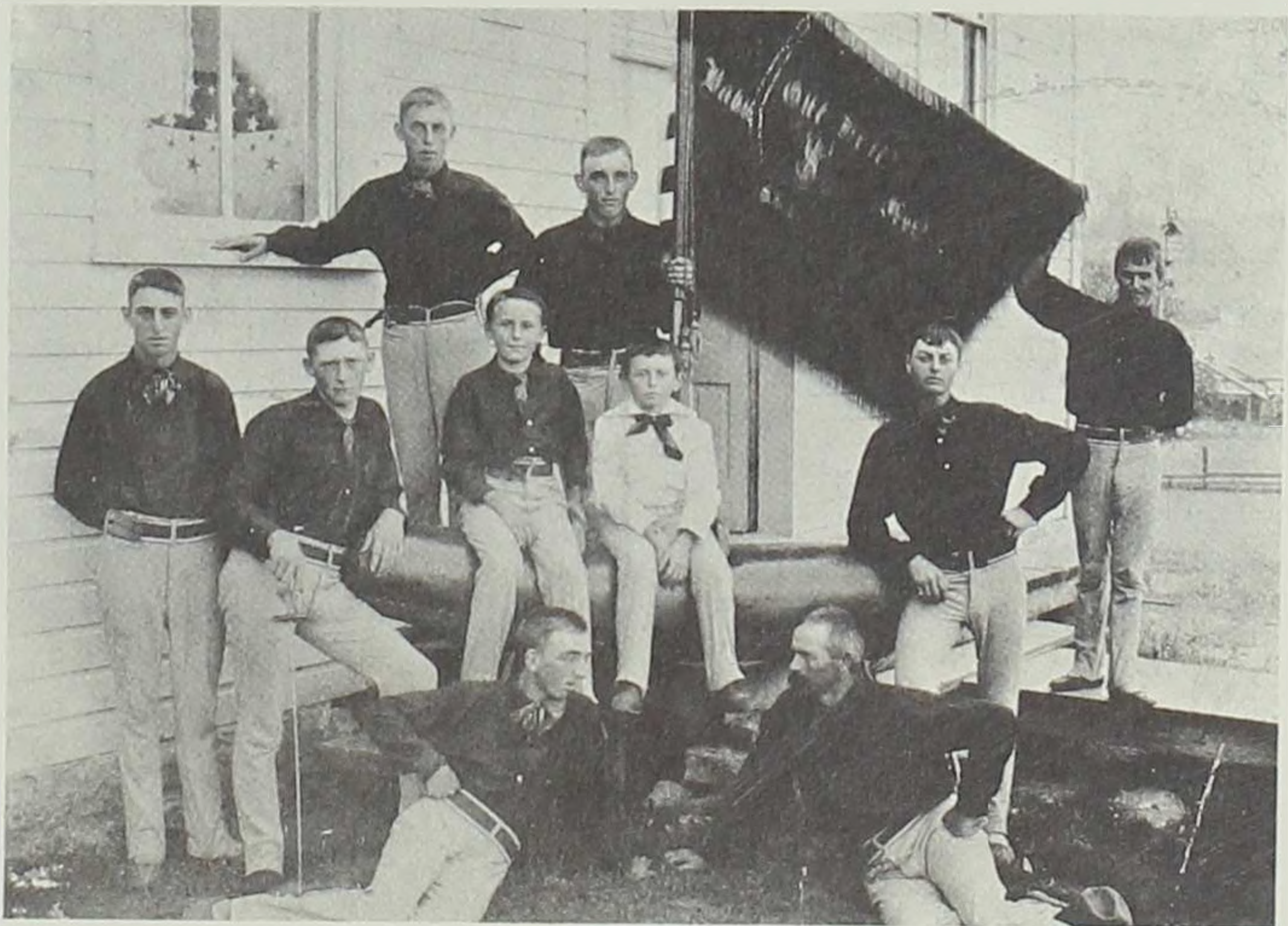
A group of "Active Turners" gathers at the former colony hall in 1895.