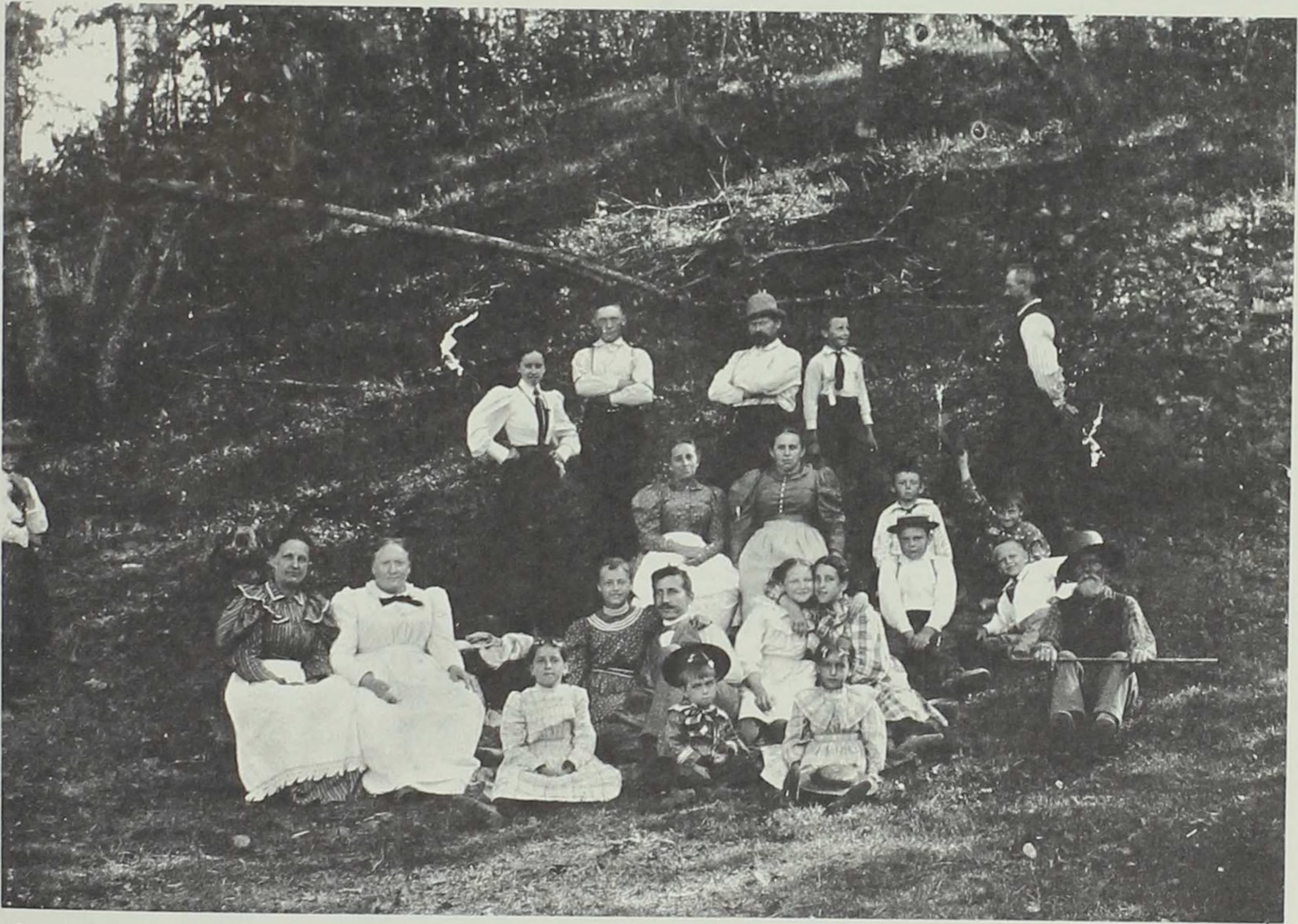
The older men and women attending this "Fish Picnic" in 1895 were undoubtedly ex-communitarians.