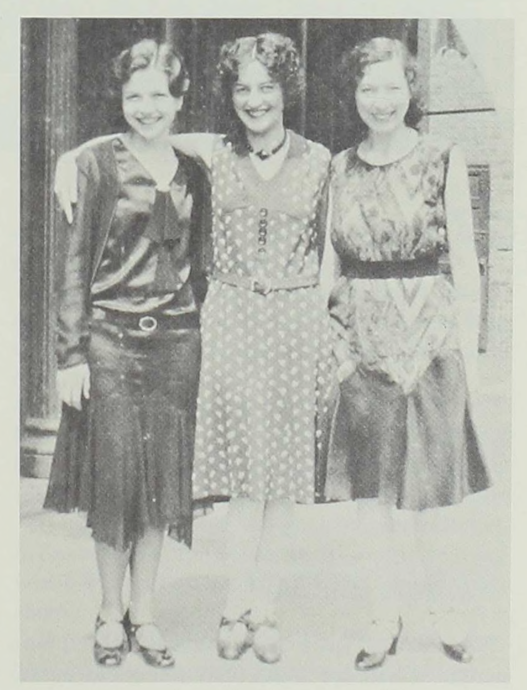
Three Universal coaches

They started the Universal Producing Company in Cedar Rapids around 1926, but they soon returned home to Fairfield, the small town that was to be their headquarters for more than 20 years. The company prospered through the worst years of the Depression, continuing to send out troops of young women, eventually expanding into the production of simulated radio amateur hours and motion picture exhibitions.